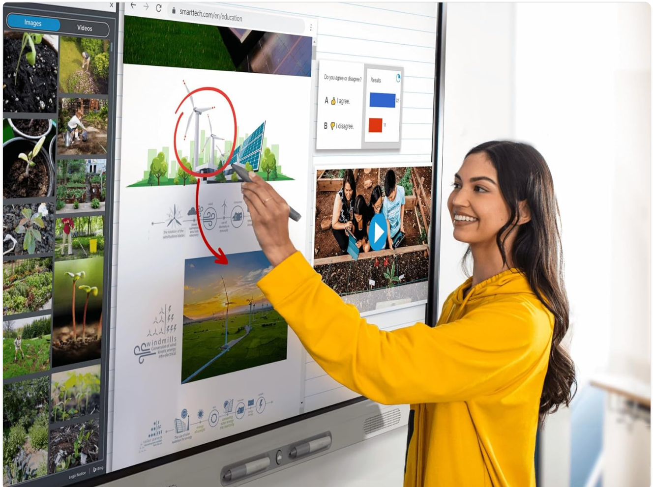
Figure 4: A user interacting with the SMART Board MX286-V5, demonstrating its large interactive surface and collaborative capabilities.