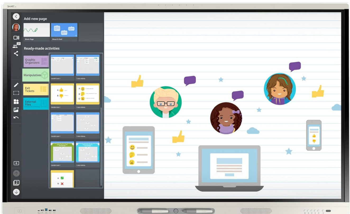
Figure 3: The SMART Board MX286-V5 showcasing various ready-made activity templates within its software, facilitating quick content creation.