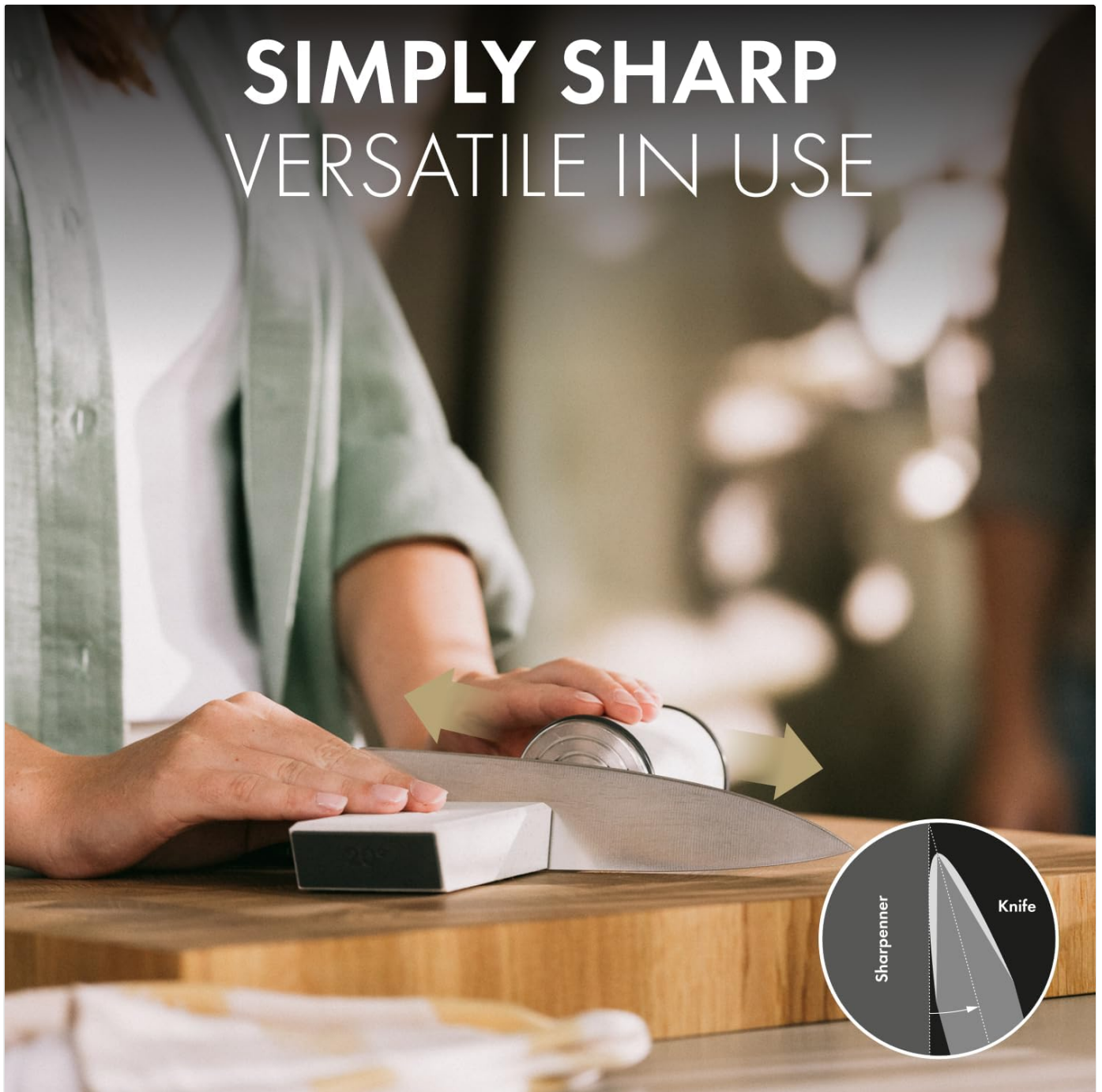
Image: A knife blade securely held by the magnetic grip pad, ready for sharpening.