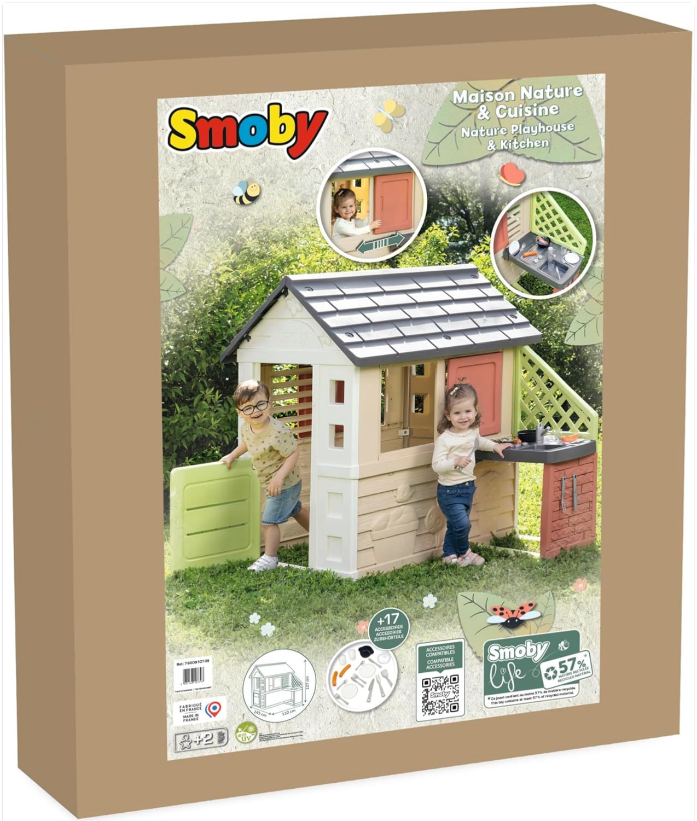
Image: The product packaging, which may contain additional assembly information or QR codes for instructions.