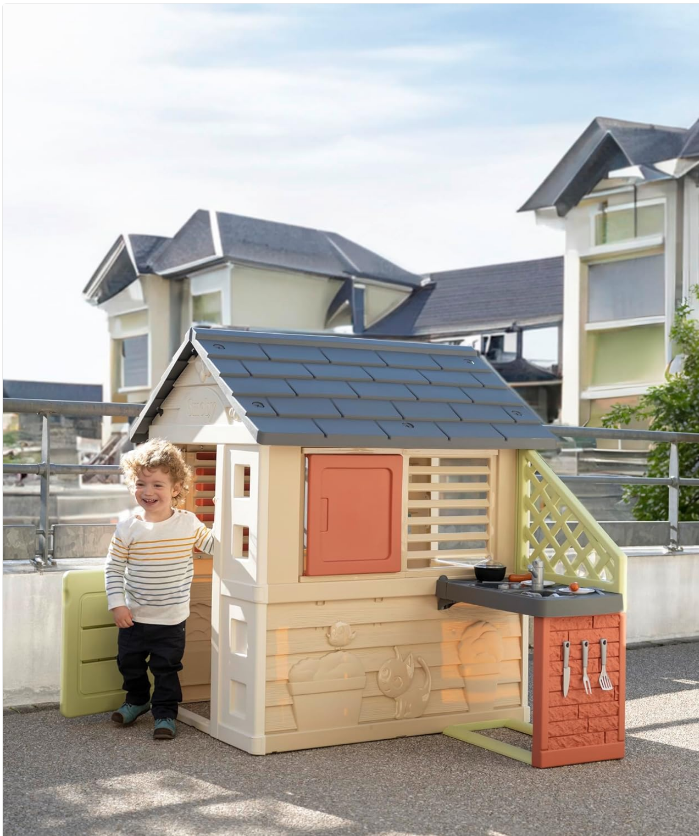
Image: Visual highlighting the product's composition of at least 57% recycled material and its manufacturing origin in France, indicating material quality.