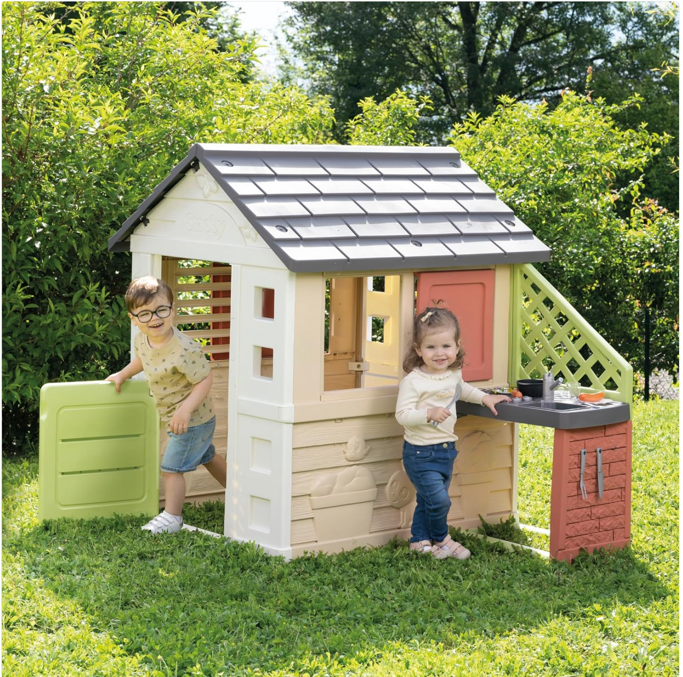
Image: A child engaging with the kitchen unit, demonstrating the use of the sink and accessories.