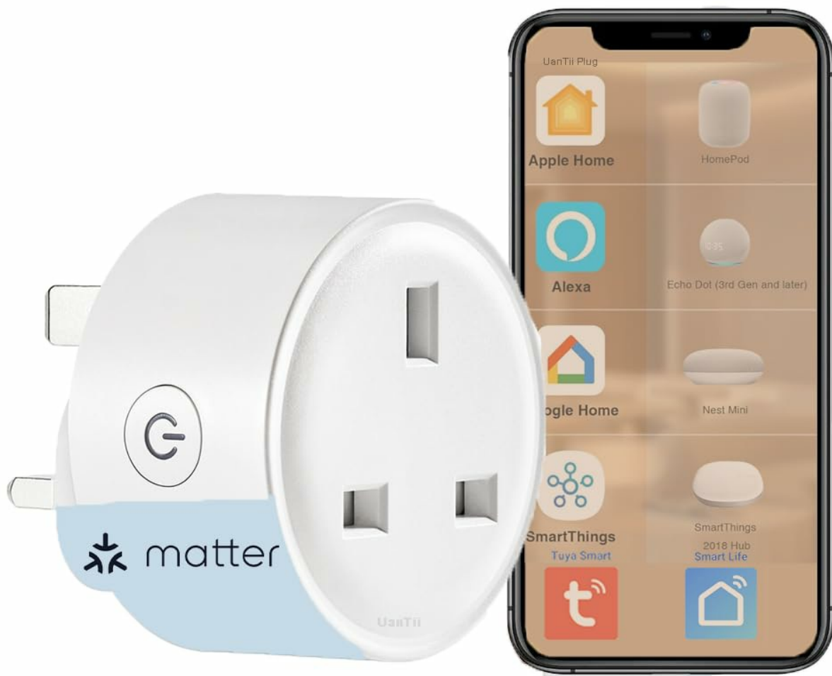
Figure 1: UanTii Smart Matter Plug and its multi-platform compatibility.