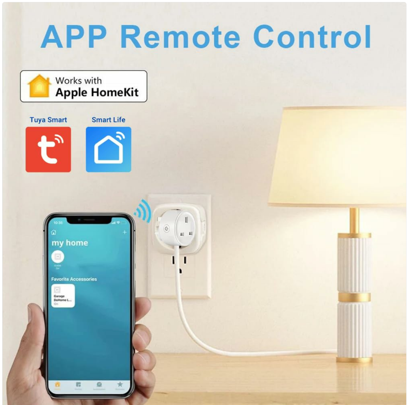
Figure 4: Remote control of appliances via the Tuya Smart or Smart Life app.

Once connected, you can control the smart plug from anywhere using the Tuya/Smart Life APP. Turn appliances on or off, and manage schedules directly from your smartphone.