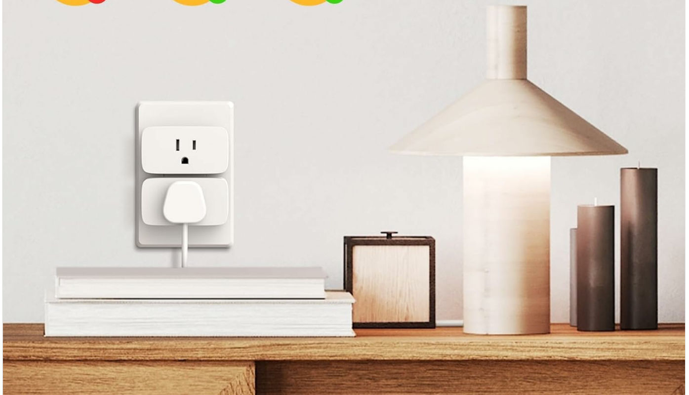
Figure 5: Use voice commands with your preferred assistant to control the plug.