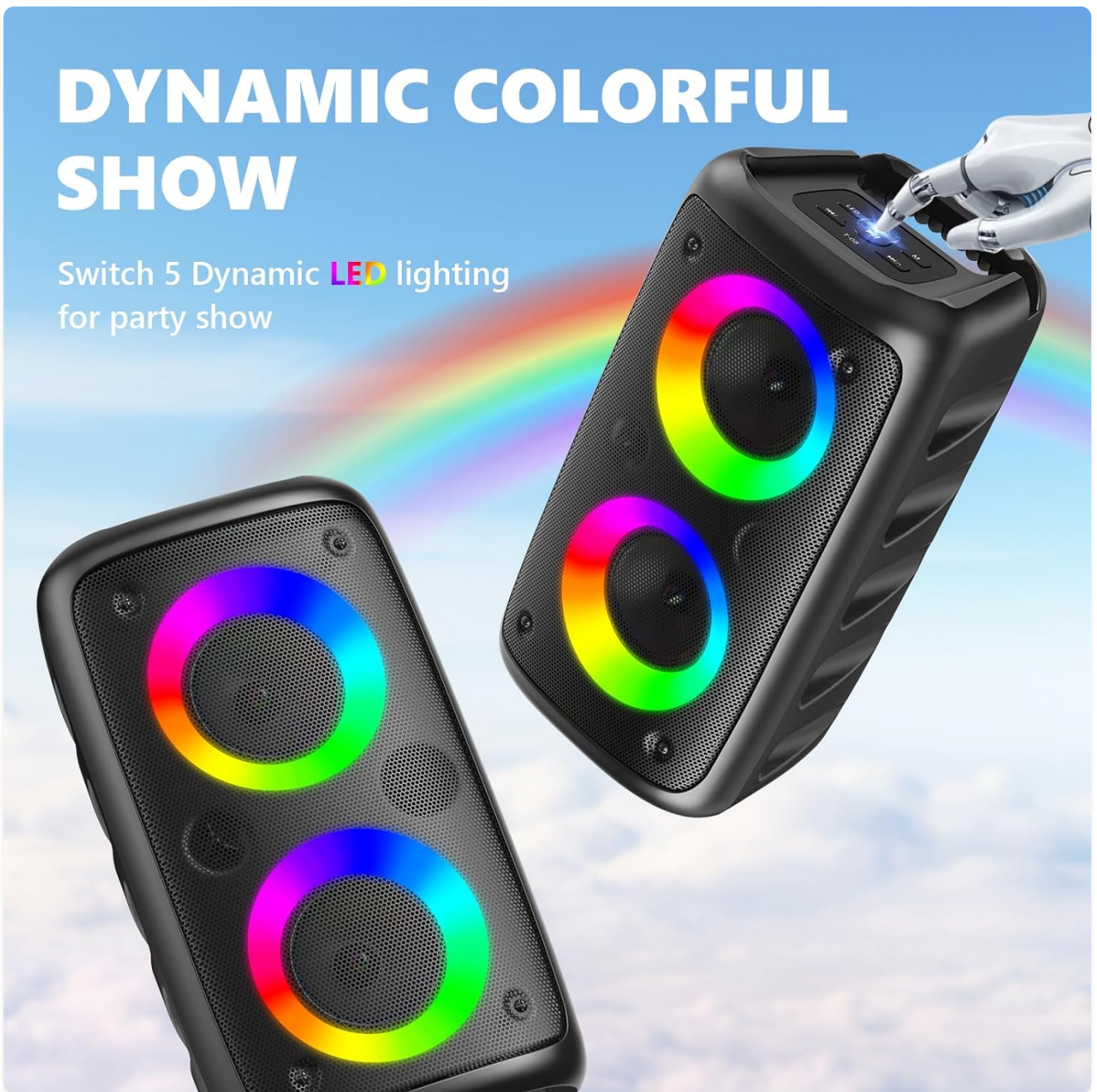
Figure 5.2: Dynamic LED lighting. This image showcases the dynamic LED lighting feature of the karaoke machine, with vibrant, color-changing lights emanating from the speaker grilles, enhancing the party atmosphere.

Switch 5 Dynamic LED lighting for party show