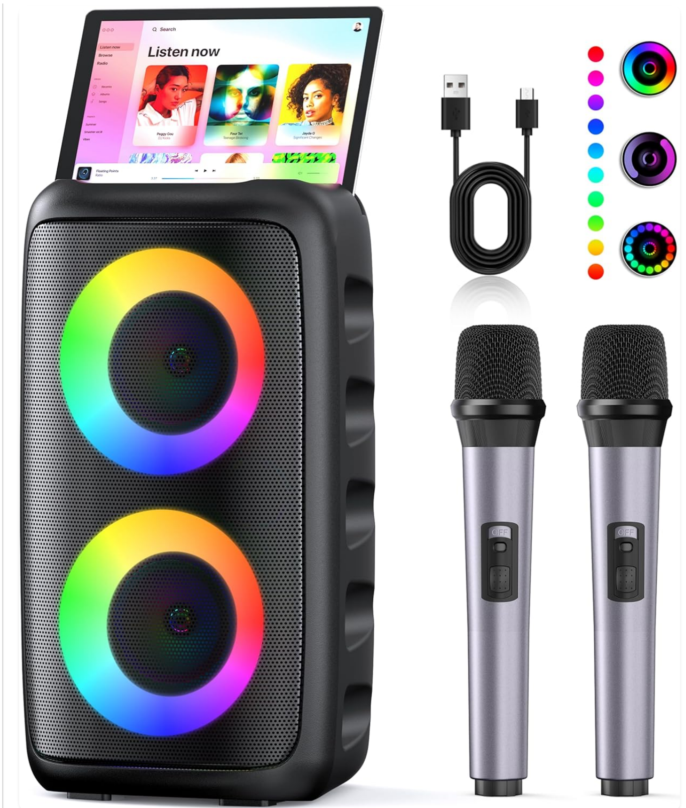
Figure 2.1: Complete package contents of the Peski Karaoke Machine. This image displays the main karaoke speaker unit, two wireless microphones, a USB-C charging cable, and a USB-A to USB-C charging cable. The speaker features dual illuminated woofers and a top slot for a tablet or smartphone.