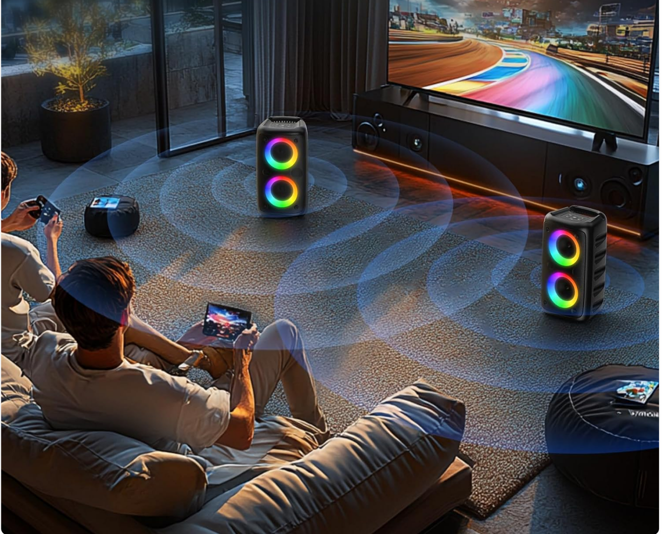
Figure 5.1: TWS setup. This image illustrates the True Wireless Stereo (TWS) function, showing two karaoke machines connected wirelessly to create a wider, more immersive stereo sound experience, ideal for larger spaces or enhanced audio.

Pairing two speakers to build a nature audio environment to create a three-dimensional effect.