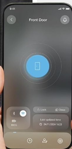
Figure 3: Overview of the various unlocking methods available.