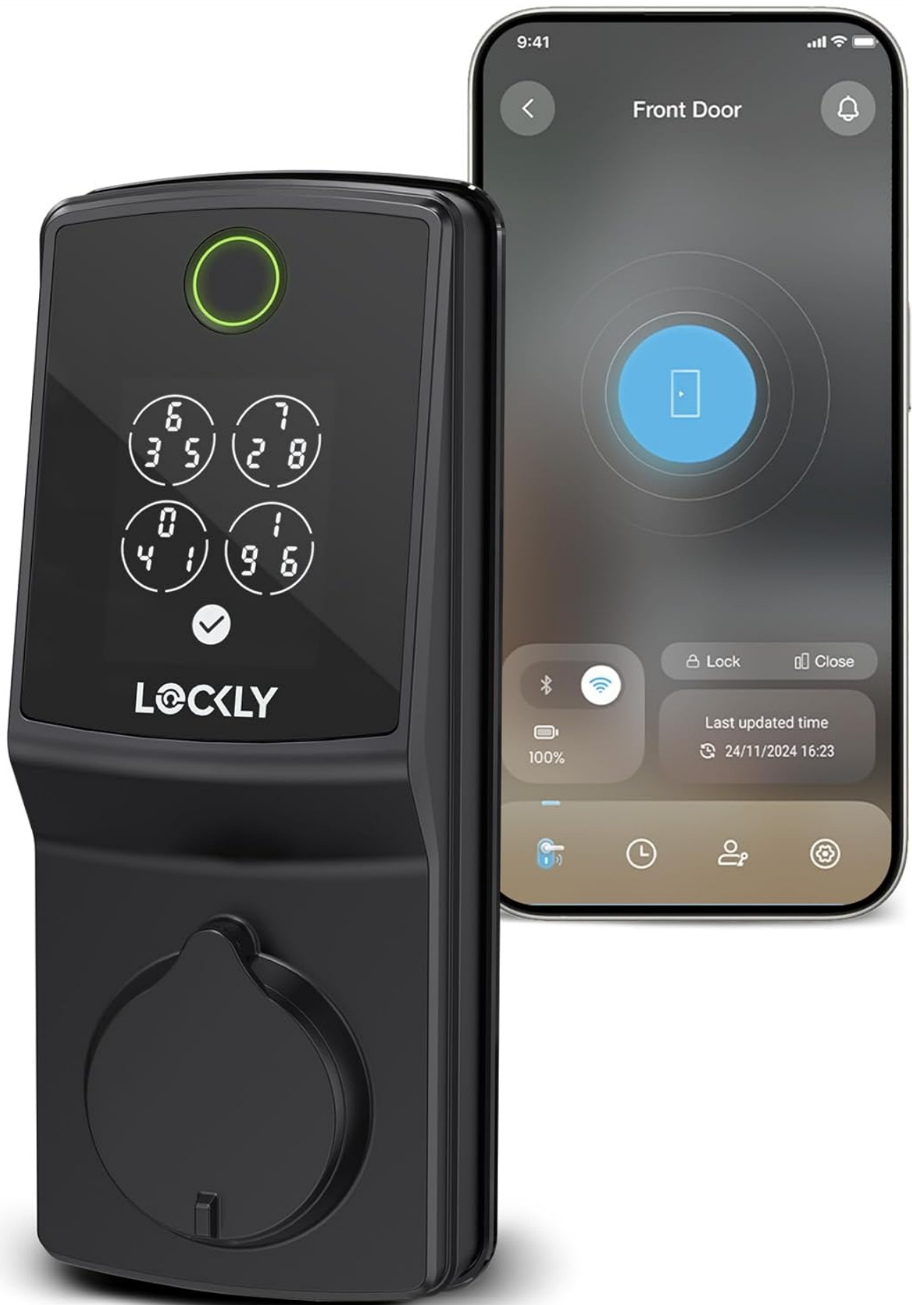
Figure 1: Lockly Smart Lock Secure Pro and companion mobile application.