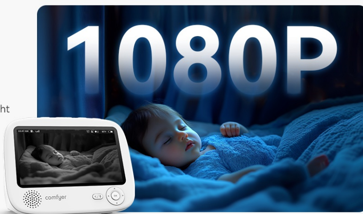
Image: Clear night vision display of a sleeping baby.

Love doesn't sleep, and neither does our night vision. Watch over your baby with our sharp 1080p clarity screen, even in deepest night.