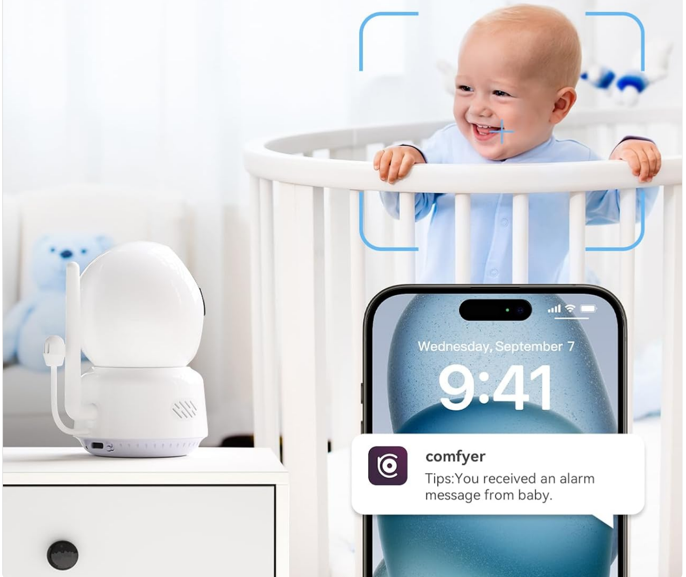
Image: Smart caring features including movement detection, noise detection, and real-time alerts.