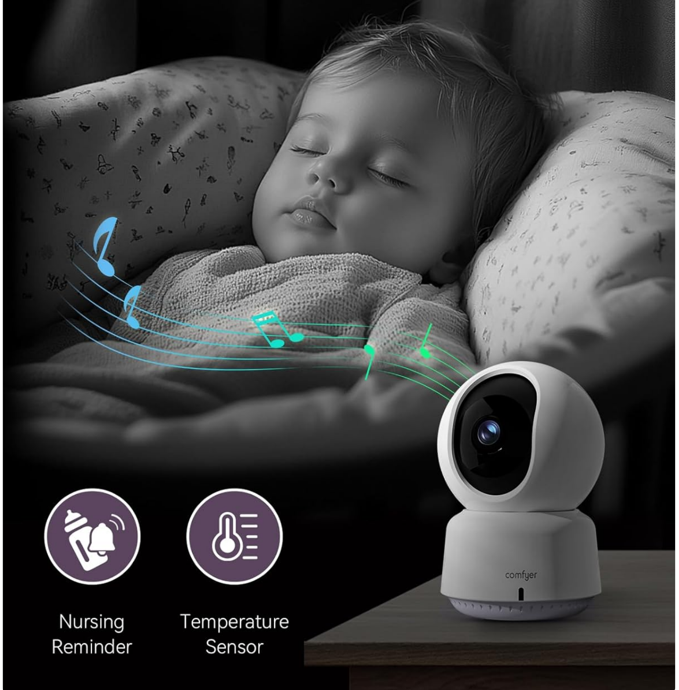
Image: Features like lullabies and temperature monitoring for baby's comfort.