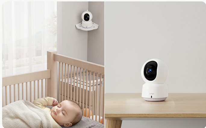
Image: Examples of tabletop and wall-mounted camera installations.

Mount it on the wall for an elevated perspective or set it on a table for easy portability and fast setup.