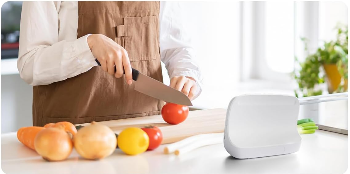
Image: Illustration of local monitor viewing and remote app viewing.