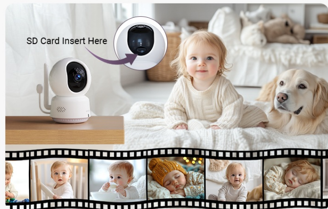
Image: Location of the SD card slot for local recording.

Choose either continuous 24/7 surveillance or intelligent motion-detected recording. Capture spontaneous photos or videos (requires an additional SD card to be inserted) instantly with a single button.