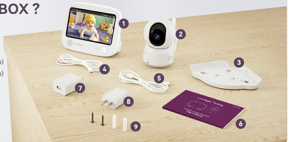
Image: All components included in the Comfyer Smart WiFi Baby Monitor package.