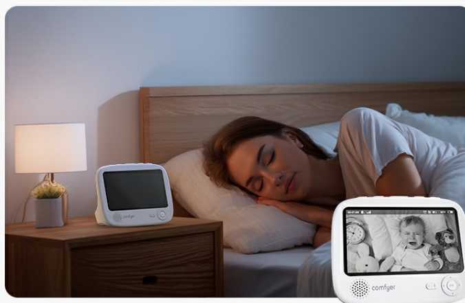
Image: VOX mode for prioritizing parent's sleep.

Enable Vox mode so the screen lights up solely in response to your baby's noises, ensuring yours' uninterrupted rest