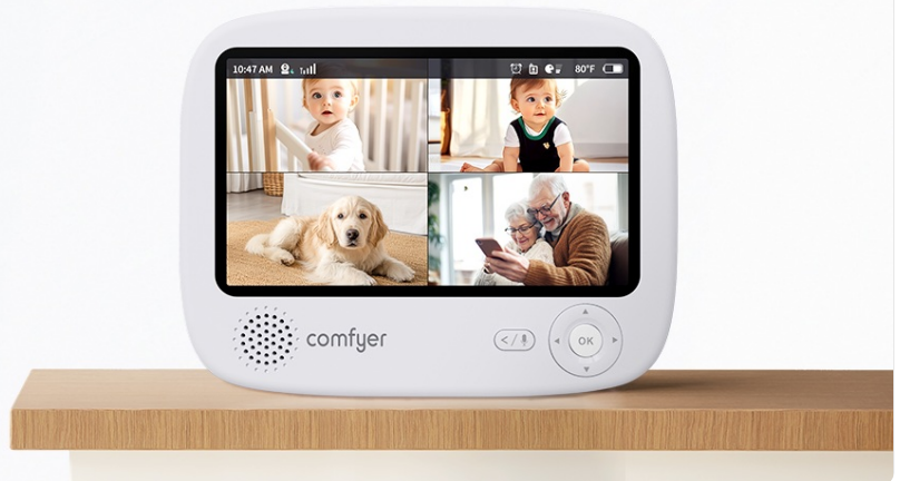
Image: Monitor displaying feeds from up to four connected cameras.

Watch multiple rooms, angles, or siblings simultaneously—all on one crystal-clear display. Note: The split-screen feature requires additional cameras to function properly