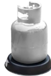
Image: Product dimensions and external propane tank placement.

Propane tank(not include)does NOT fit inside the fire table.