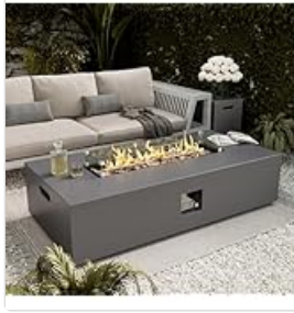
Image: Included components for the UPHA fire pit table.