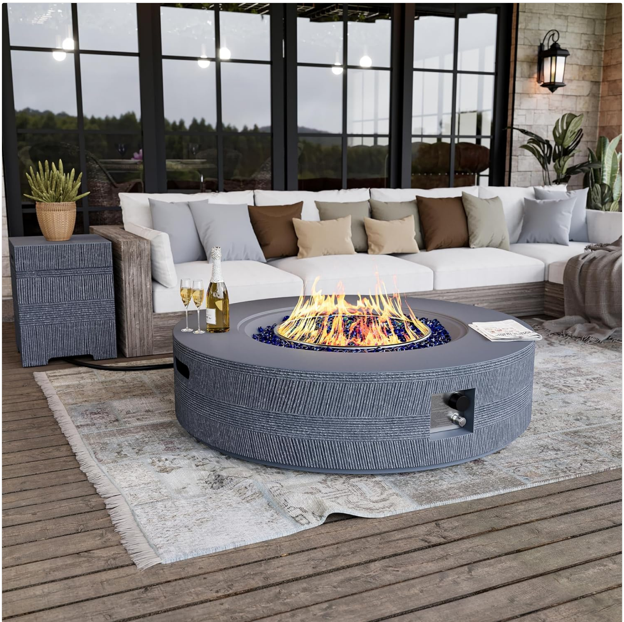
Image: UPHA 42-inch Round Propane Gas Fire Pit Table.