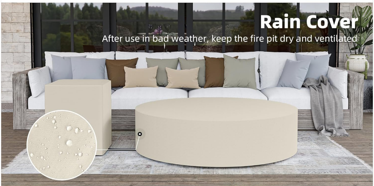
Image: Rain cover protecting the fire pit table and side table.

After use in bad weather, keep the fire pit dry and ventilated