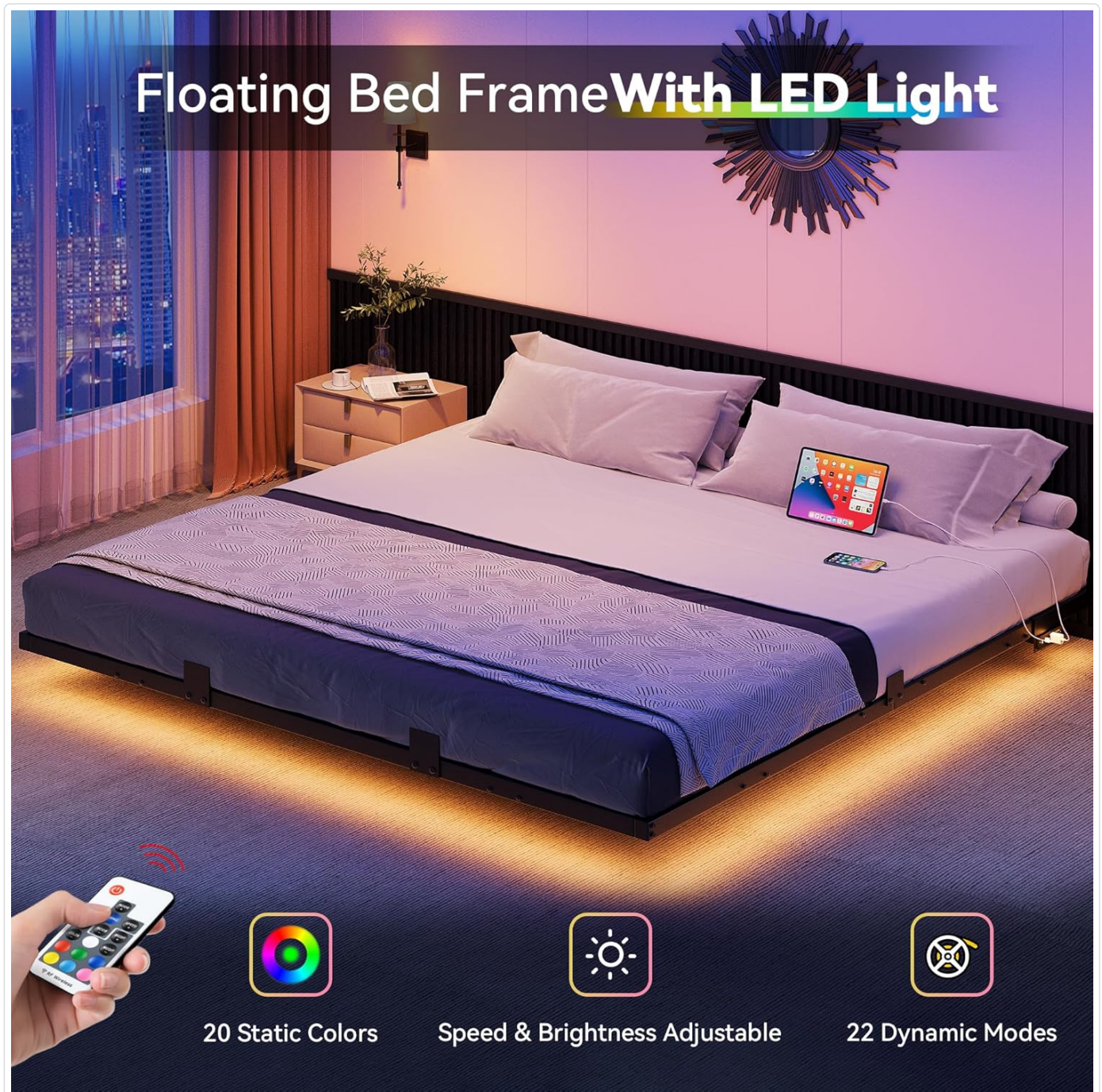
Image 5.1: The bed frame illuminated by its LED lights, with the remote control shown for adjusting settings.