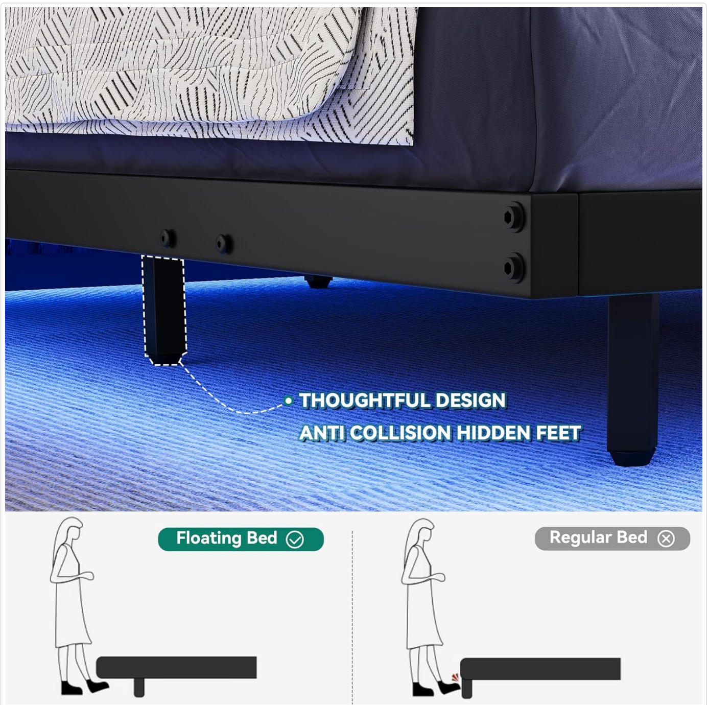
Image 1.2: Visual comparison illustrating the concealed leg design of the floating bed frame versus a traditional bed frame.