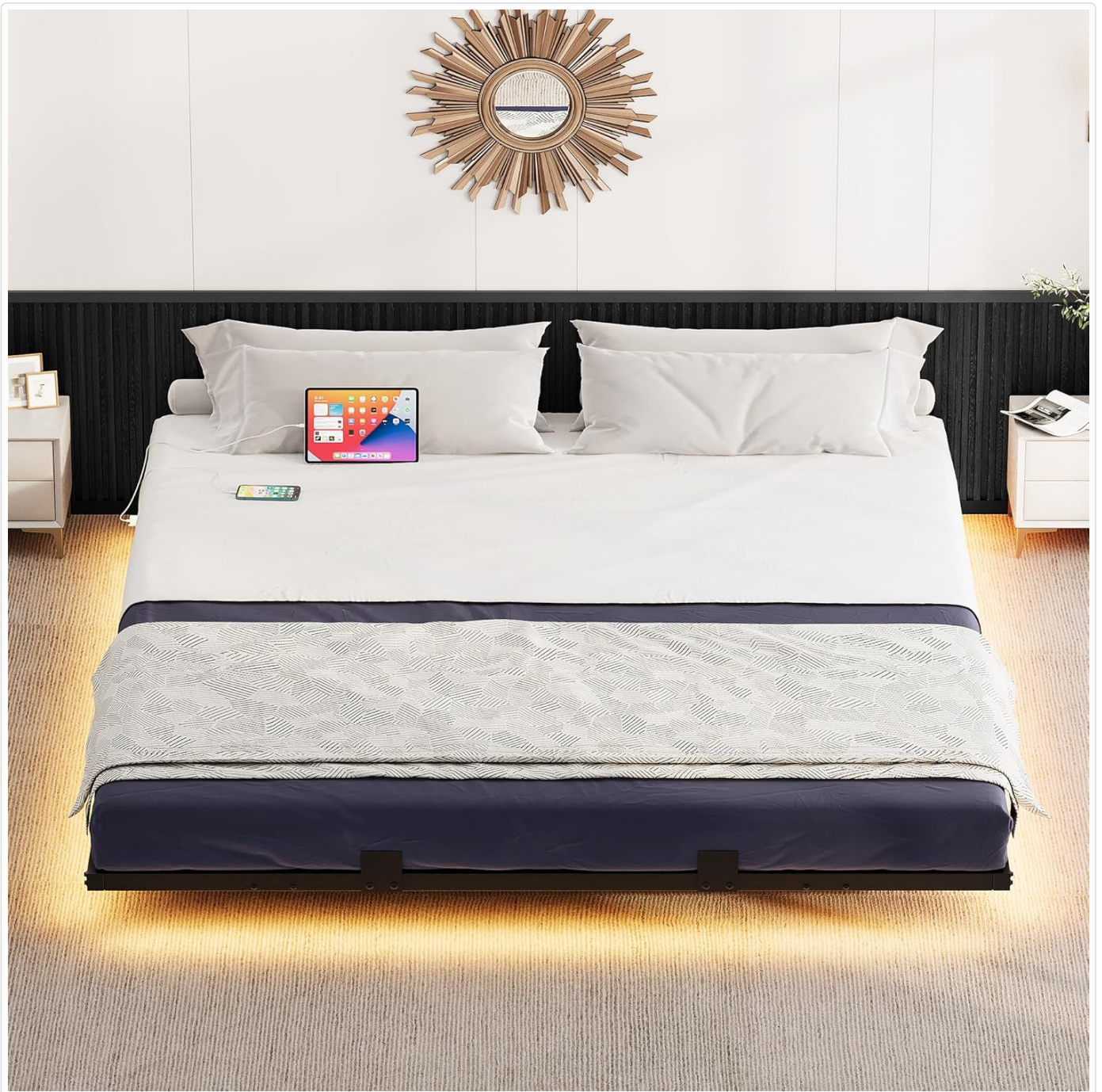
Image 1.1: The DWVO King Size Floating Bed Frame, showcasing its illuminated base and integrated charging capabilities.