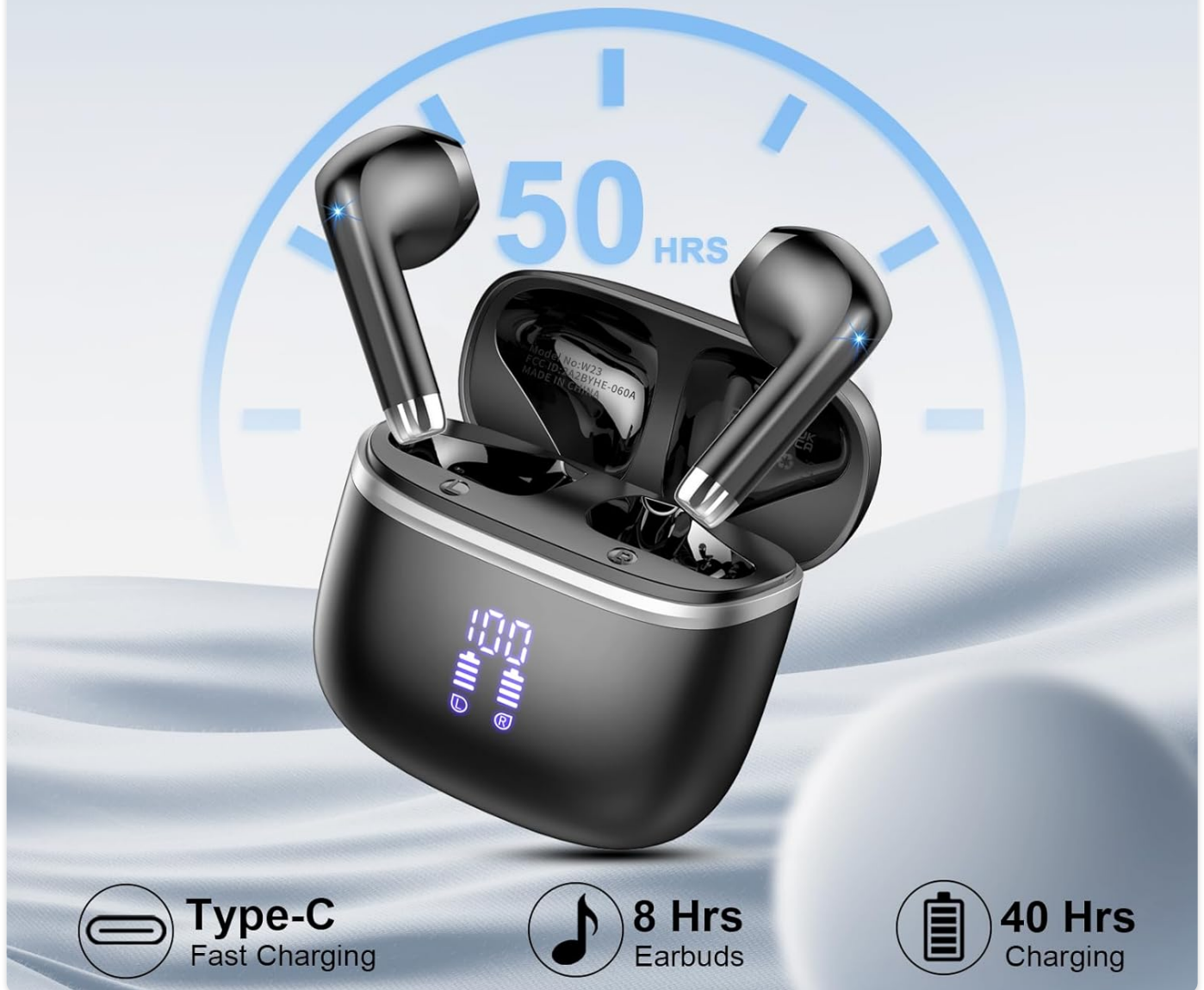
Figure 3: Charging Case with LED Display

Enjoy music without frequent charging. With the charging box, the battery life is up to 50 hours.