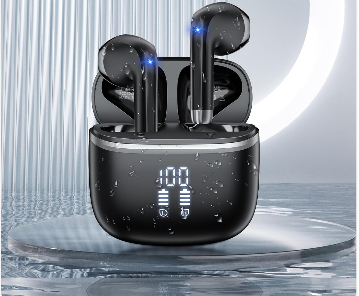
Figure 7: IPX7 Water Resistance

The W53 wireless earbuds has passed the IPX7 waterproof test, making it resistant to sweat and rain.