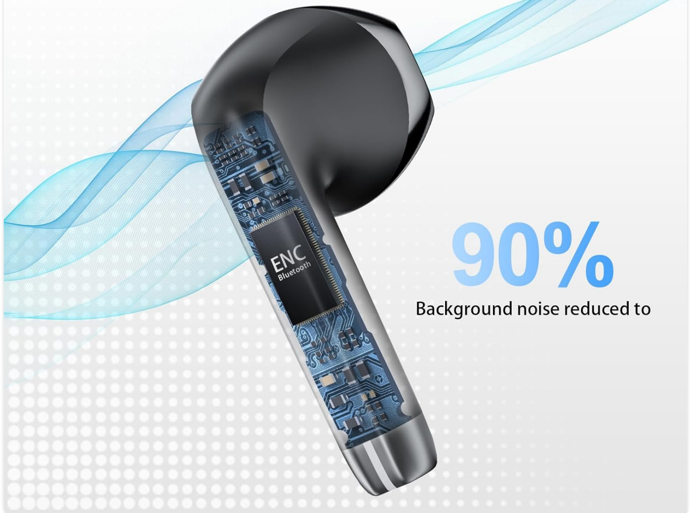
Figure 6: ENC Noise Cancelling Microphones

Reduces ambient noise by up to 90% for crystal-clear call clarity