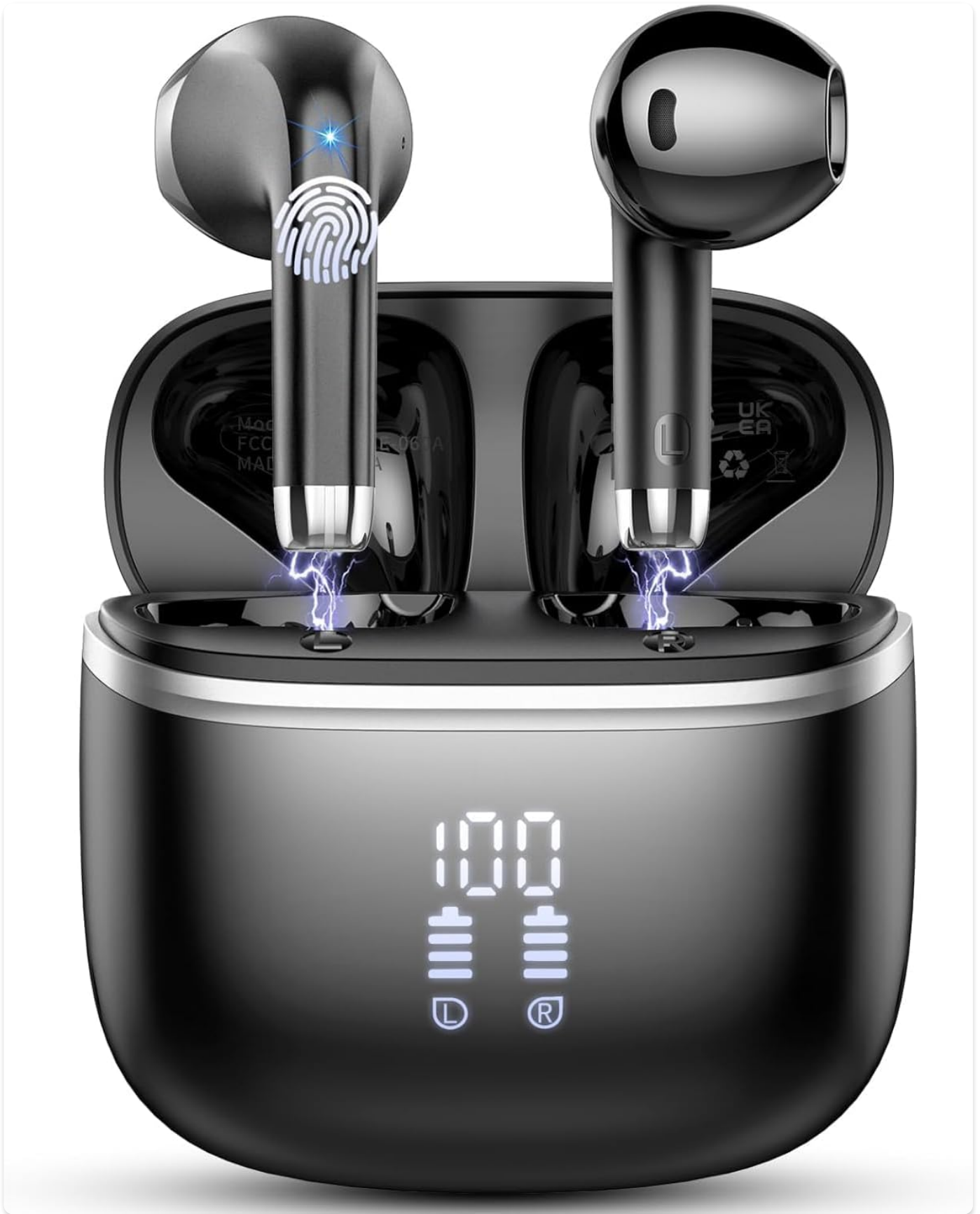
Figure 1: HOIFA W53 Wireless Earbuds and Charging Case