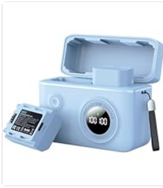
Image 8: Detailed view of the smart digital display and its indicators.