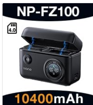
Image 2: Feature comparison highlighting 20W PD charging, SD card reader, built-in power, and battery level display.