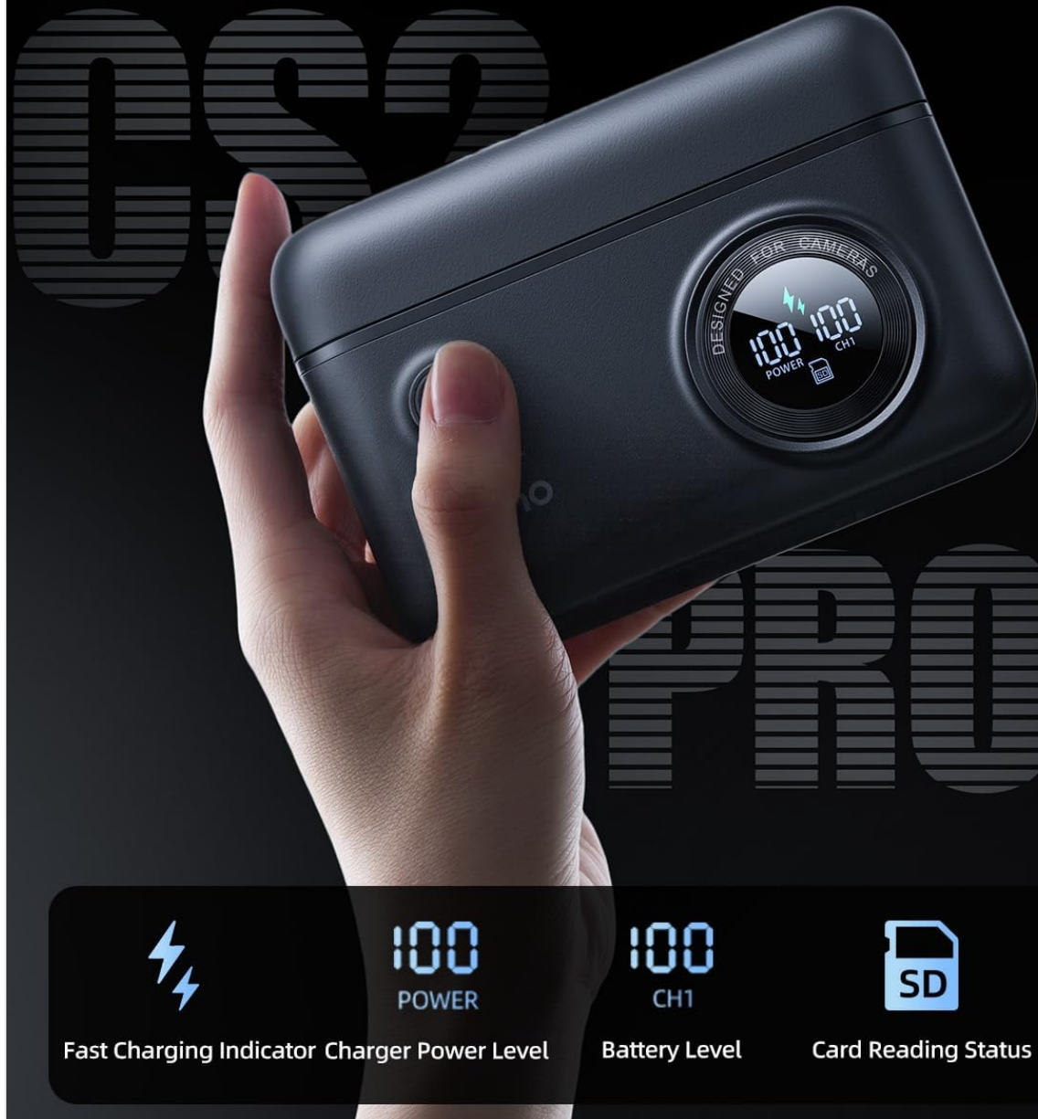
Image 7: The Ilano charger with its lid open, revealing storage for a battery and SD cards.