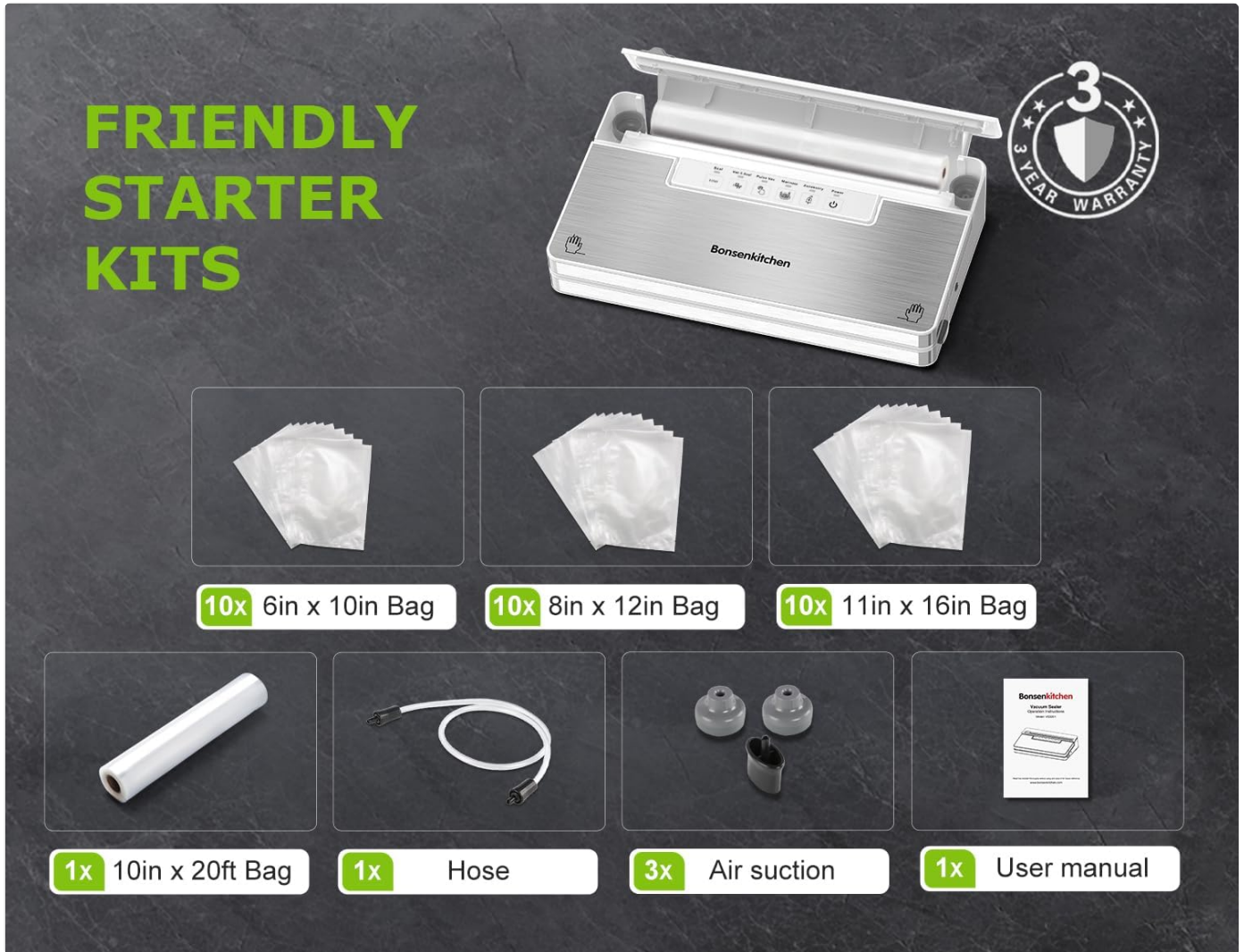
Image: All items included in the Bonsenkitchen Vacuum Sealer Machine starter kit, laid out for clear viewing.