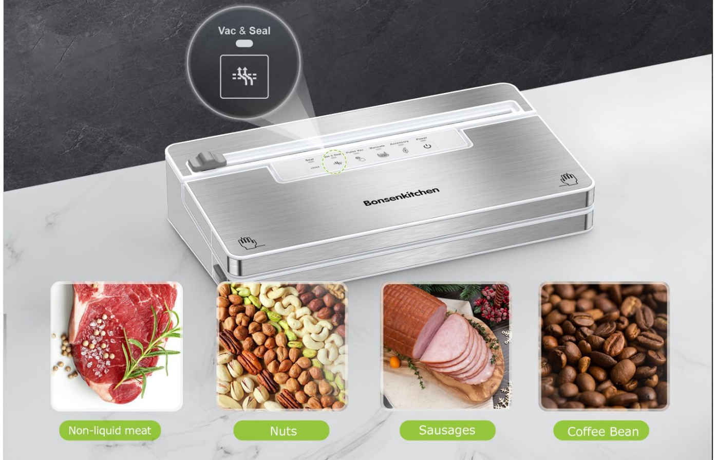
Image: The vacuum sealer operating in Vac & Seal mode, suitable for various dry food items.

One-Touch automatic vacuum and seal dry foods