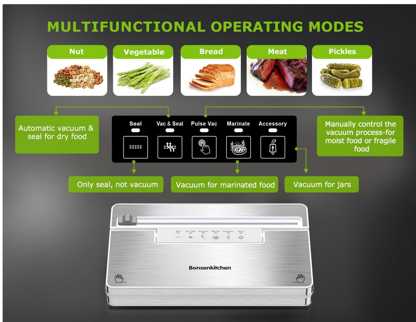
Image: Overview of the vacuum sealer's five operating modes and their primary uses.

The Bonsenkitchen Vacuum Sealer offers multiple modes for various food types and preservation needs.