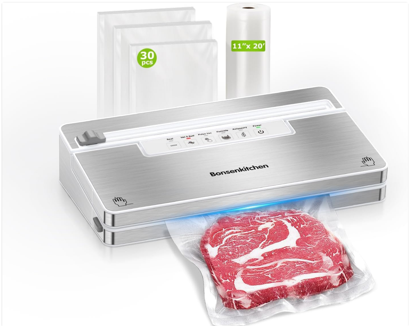
Image: The Bonsenkitchen Vacuum Sealer Machine, highlighting its sleek design and the accessories it comes with.