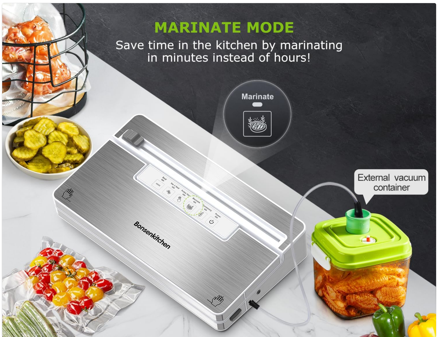
Image: The vacuum sealer connected to an external container, demonstrating the marinate function for quick flavor infusion.