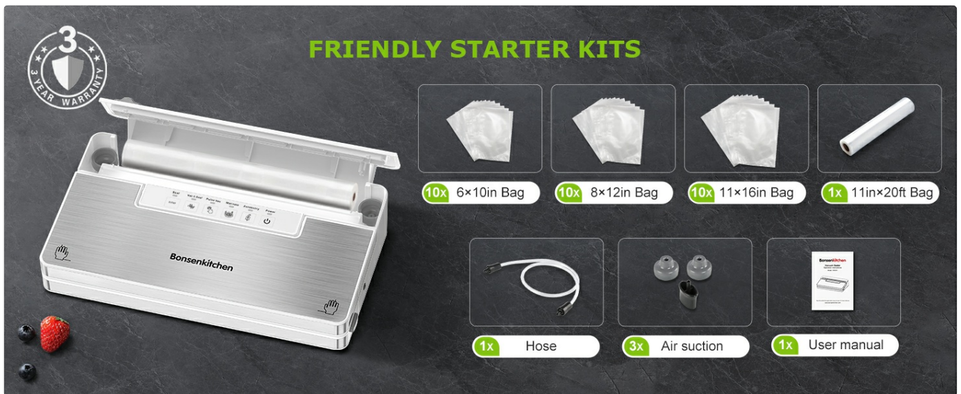
Image: Instructions for using the external vacuum system with various accessories like vacuum tanks, Ziplock bags, and wine bottles.