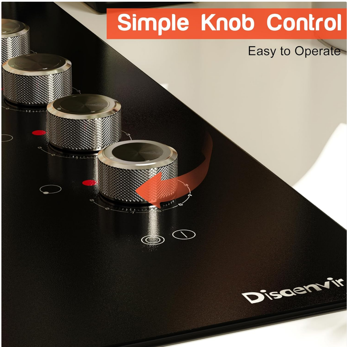
Image 3: Detailed view of the cooktop's knob controls, demonstrating their simple and tactile design for adjusting heat settings.