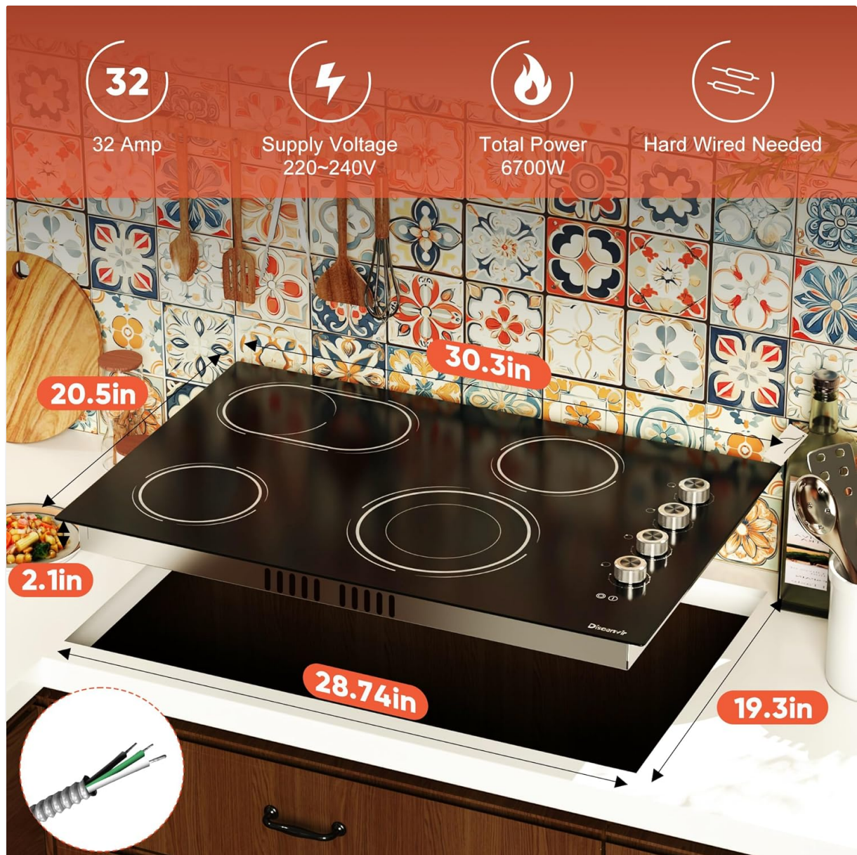
Image 2: Diagram illustrating the product dimensions and the hard-wired electrical connection requirements for the cooktop.

Included Components: Your cooktop package includes the 4-burner electric cooktop unit, a user manual, and a cleaning scraper.