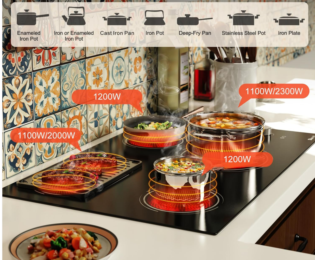
Image 5: Visual representation of the cooktop's compatibility with different flat-bottomed cookware types.

No Need to Change Your Pans to Accommodate this Stove