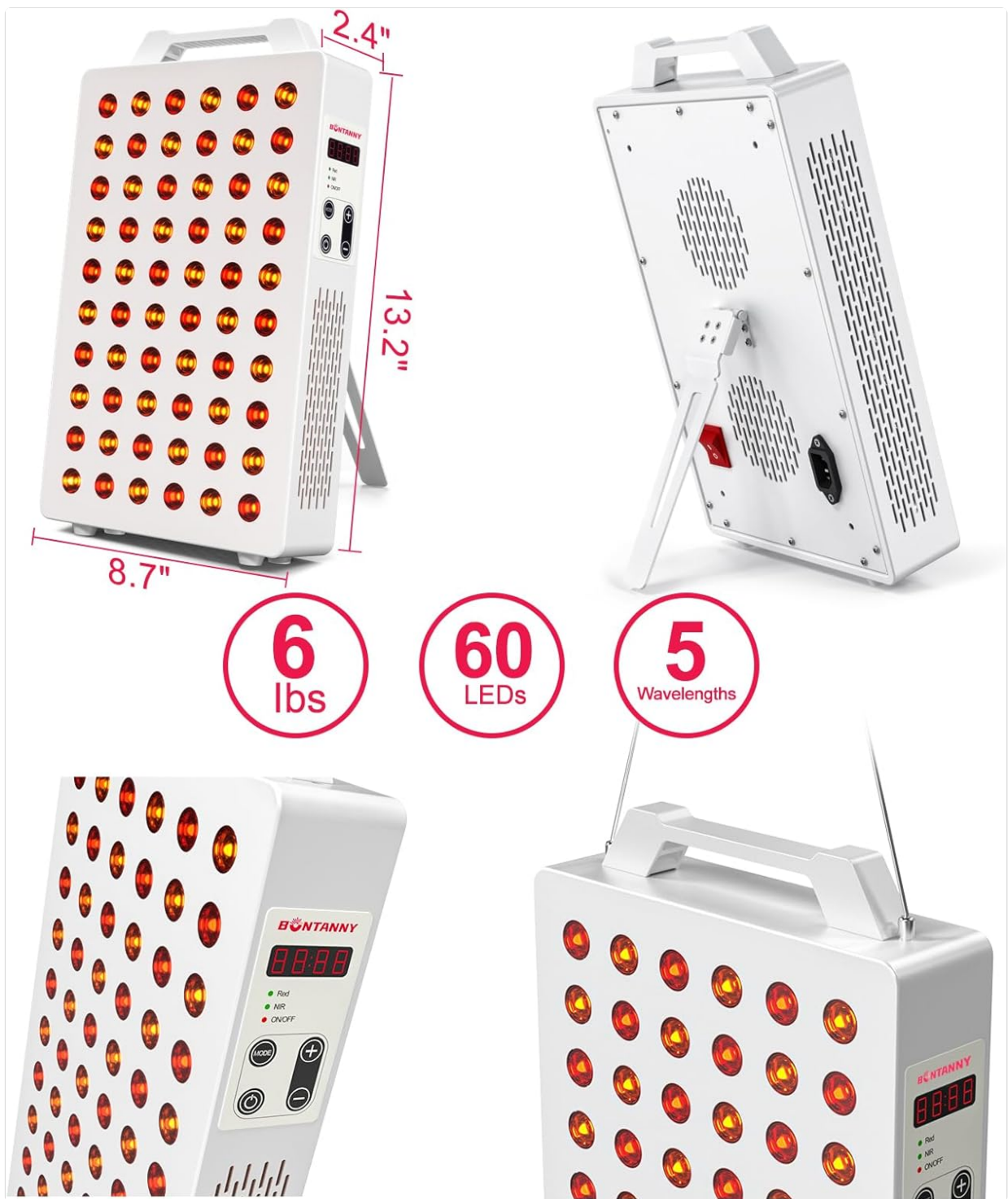
Image: Visual representation of the device's dimensions, weight, LED count, and number of wavelengths.