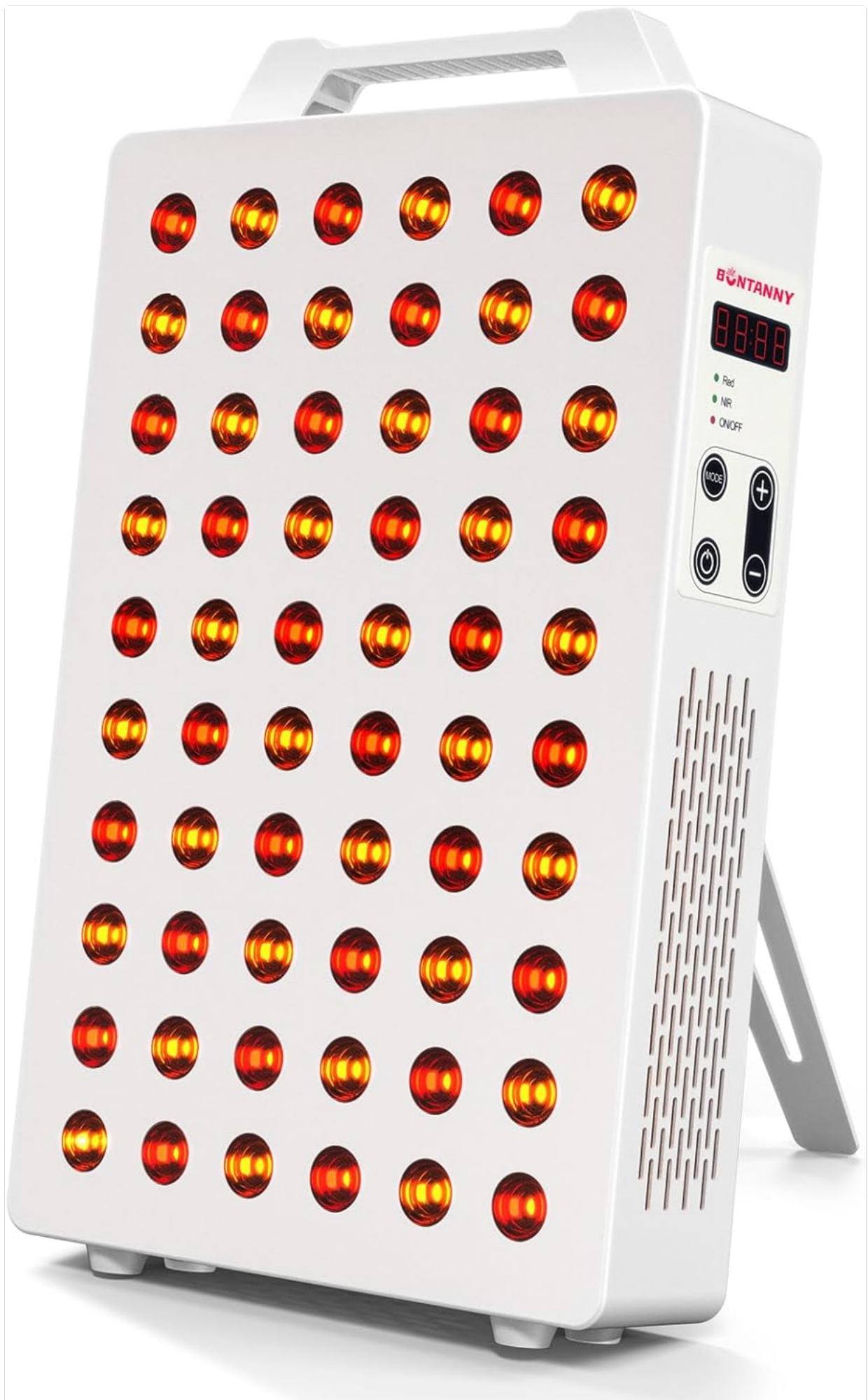
Image: BONTANNY BO-300 Red Light Therapy Device, showcasing its sleek design and LED panel.