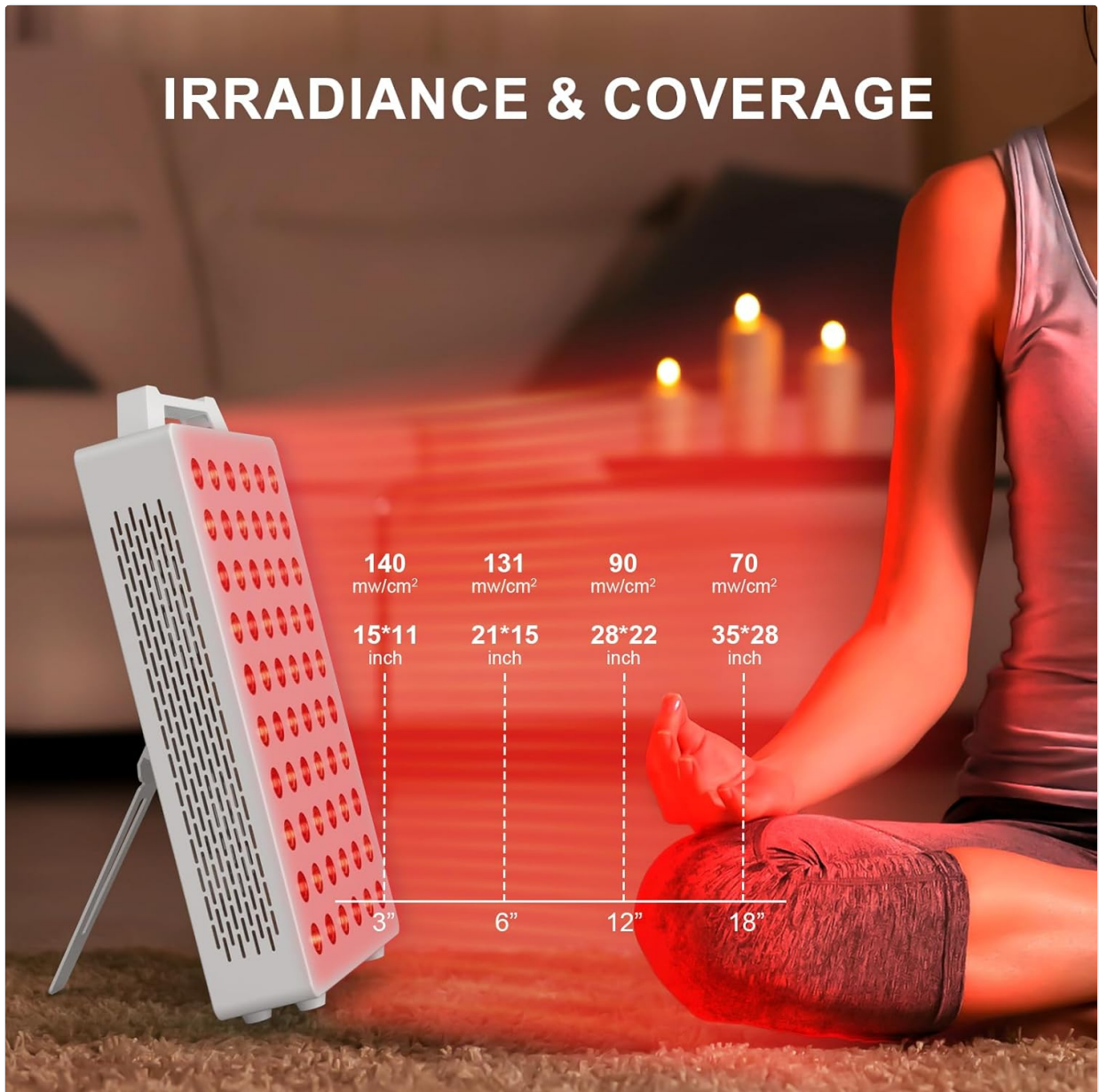
Image: Chart illustrating the irradiance levels and coverage areas at various distances (3, 6, 12, 18 inches) from the device.