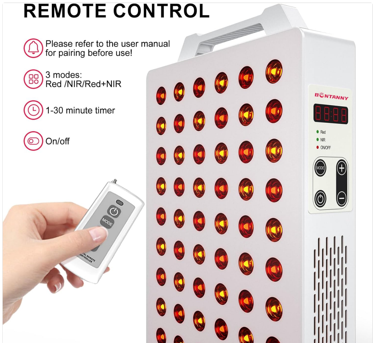
Image: Close-up of the device's control panel and remote control, highlighting the mode selection and timer functions.