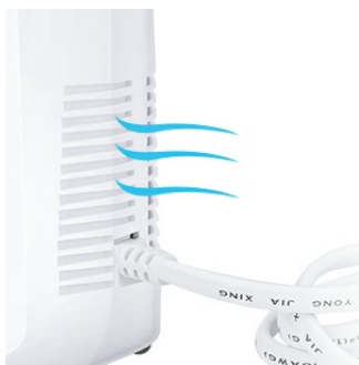
Air Vents: This image shows the air vents on the side of the main unit, indicating where the air filter is located.

Important: Do not wash or reuse air filters. Do not operate the device without an air filter.