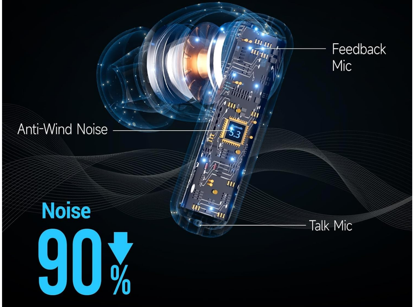
Image: Detailed diagram illustrating the 4-microphone system with CVC8.0 technology for clear calls, highlighting anti-wind noise design, feedback microphone, and talk microphone, which contribute to 90% background noise reduction.

Enhance your voice and reduce up to 90% background noise