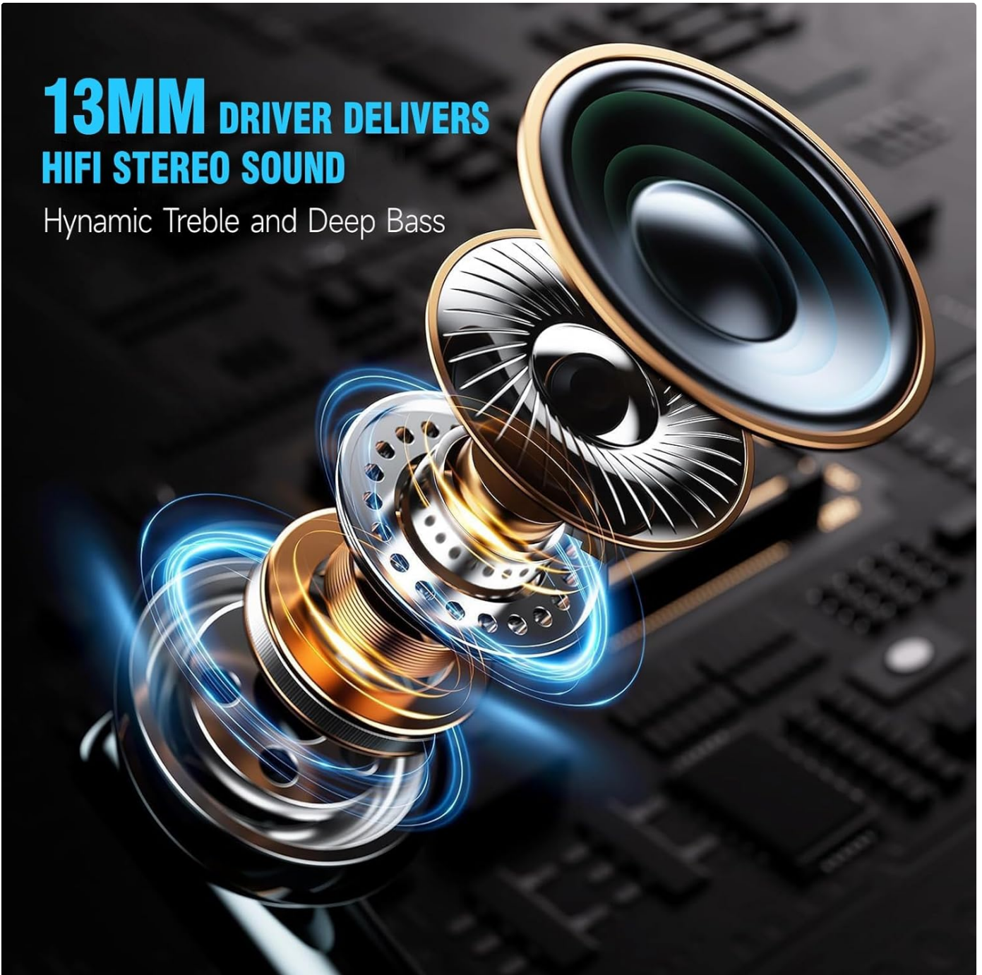
Image: An exploded view of the 13mm dynamic driver, showcasing its components and emphasizing its capability to deliver HIFI stereo sound with dynamic treble and deep bass.