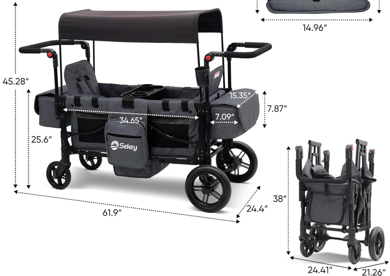
Figure 7.1: Production dimensions and key measurements of the Sekey KW-3 Wagon Stroller.