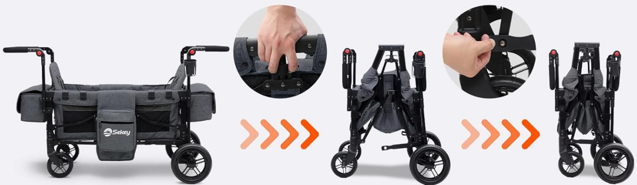
Figure 3.1: Visual guide for the easy one-handed folding and unfolding mechanism of the wagon stroller.