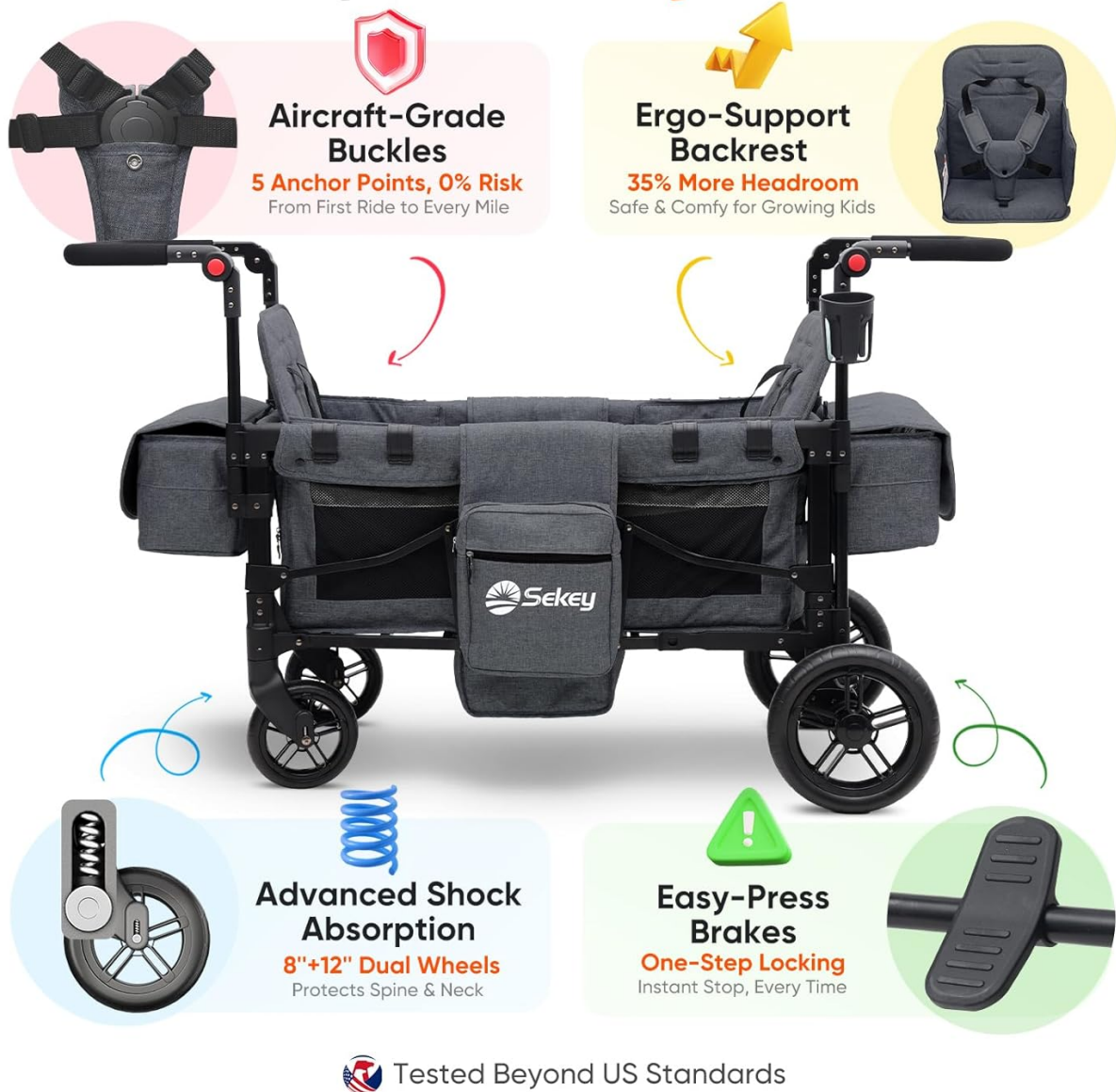
Figure 2.1: Overview of the 4-Layer Safety Shield features, including aircraft-grade buckles, ergo-support backrest, advanced shock absorption, and easy-press brakes.