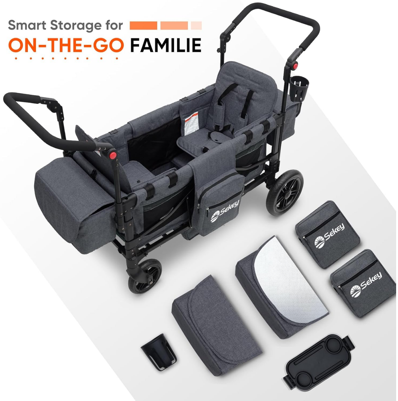
Figure 3.2: All modular components and accessories of the Sekey KW-3 Wagon Stroller, ready for customization and attachment.