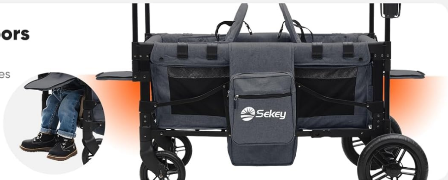
Figure 4.1: Key features for parents, including the 5-position adjustable handle, soft-touch grip, secure cup holder, and convenient dual-access doors.

—Easy In & Out— No More Lifting Struggles