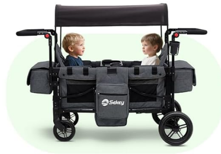
Figure 4.4: The 4-in-1 design of the wagon stroller, demonstrating various seating configurations for versatility.