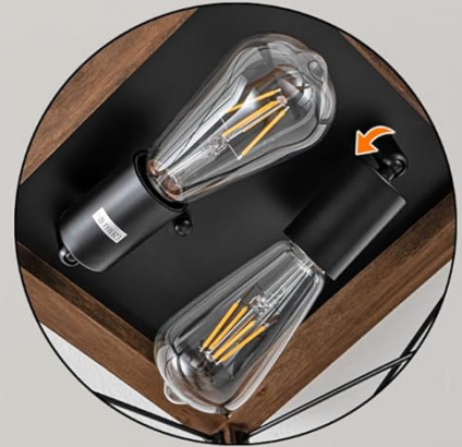
Adjustable Lamp Holder