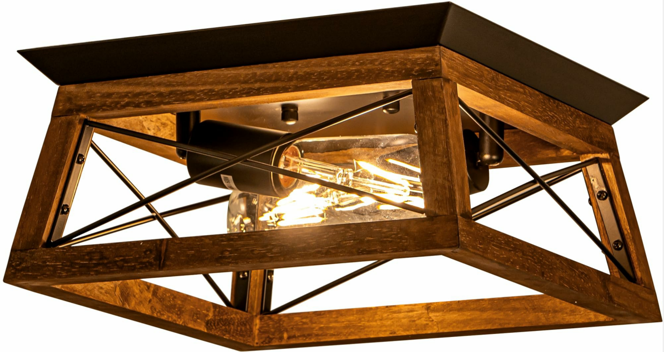
Image 3.1: The Rpzloila Farmhouse 2-Light Flush Mount Ceiling Light, showcasing its metal and wood design.