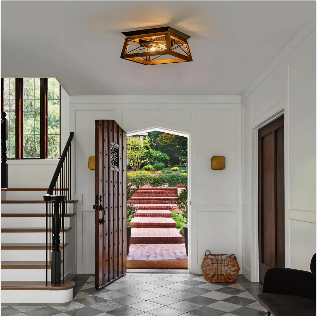
Image 6.1: Visual comparison of the light fixture when turned off and on, demonstrating its illumination.

This fixture is compatible with dimmable E26 bulbs and a compatible dimmer switch (not included). To utilize dimming, ensure you install dimmable bulbs and connect the fixture to a dimmer switch.