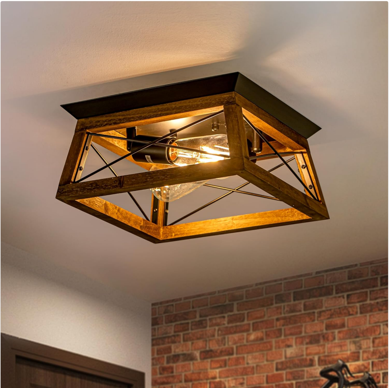
Image 5.1: The ceiling light fixture installed in an entryway, demonstrating its flush mount design.

Your browser does not support the video tag.