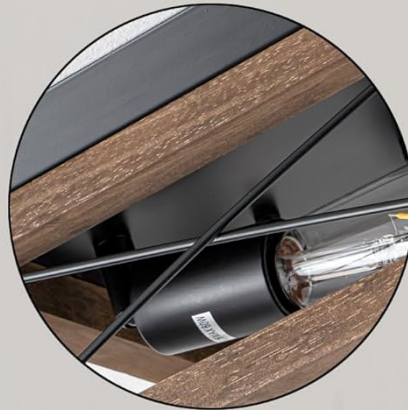
Rational Hollow Structure