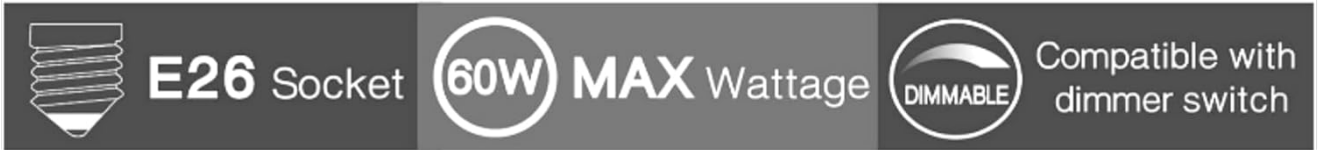
Image 3.2: Detailed dimensions and compatible E26 bulb types for the fixture.