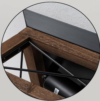
Premium Anti-rust Metal