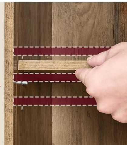
Image: Close-up demonstrating the adjustable shelves behind the cabinet door, highlighting the ability to customize shelf height.