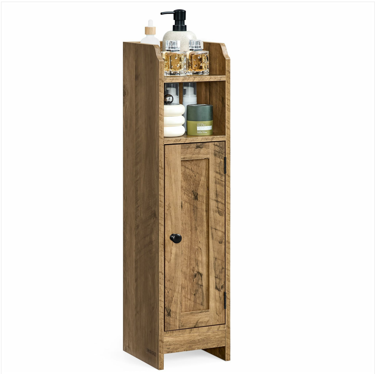
Image: The VASAGLE UBBK310K01 cabinet, showcasing its honey brown finish and compact design.