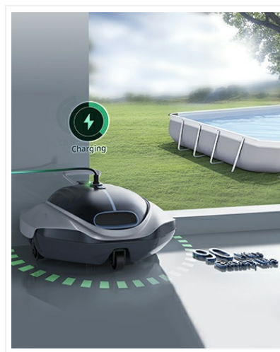
Figure 2: Robotic pool cleaner charging near the pool.