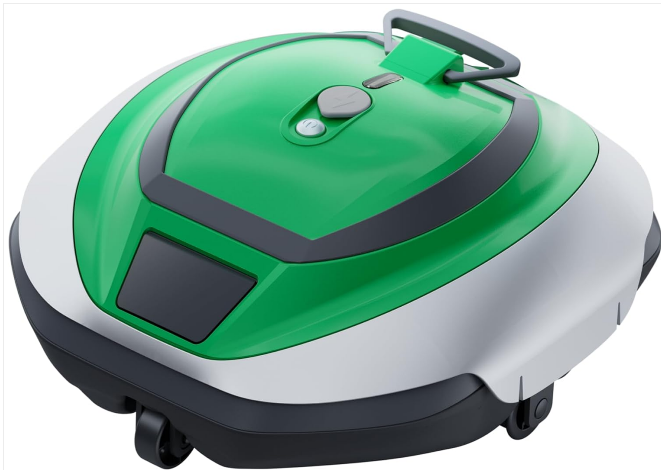
Figure 1: BuSwift 320P Robotic Pool Cleaner

The BuSwift 320P Robotic Pool Cleaner is designed for efficient and autonomous cleaning of above-ground pools up to 850 sq.ft. Featuring a hydro-dynamic design, superior suction, and advanced DirtLock 2.0 technology, it effectively captures leaves, debris, and fine particles, ensuring a clean pool with minimal effort. This cordless unit offers convenient operation and automatic parking when the battery is low.