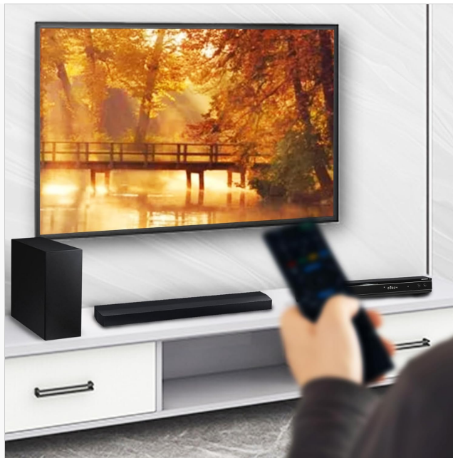
Image 3.1: Example of the remote control being used with a television.