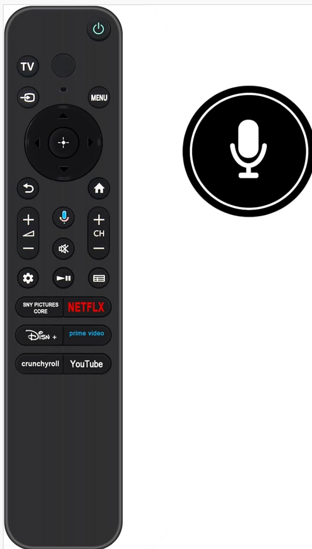
Image 2.1: The Google Assistant button, used for voice commands and pairing.