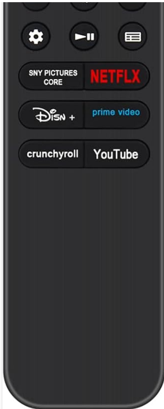
Image 1.1: Front view of the ECONTROLLY RMF-TX920U Voice Remote Control.