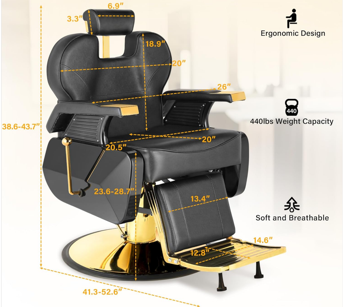
Image Description: A visual representation of the chair's reclining backrest, showing adjustable angles and the lever used for adjustment.