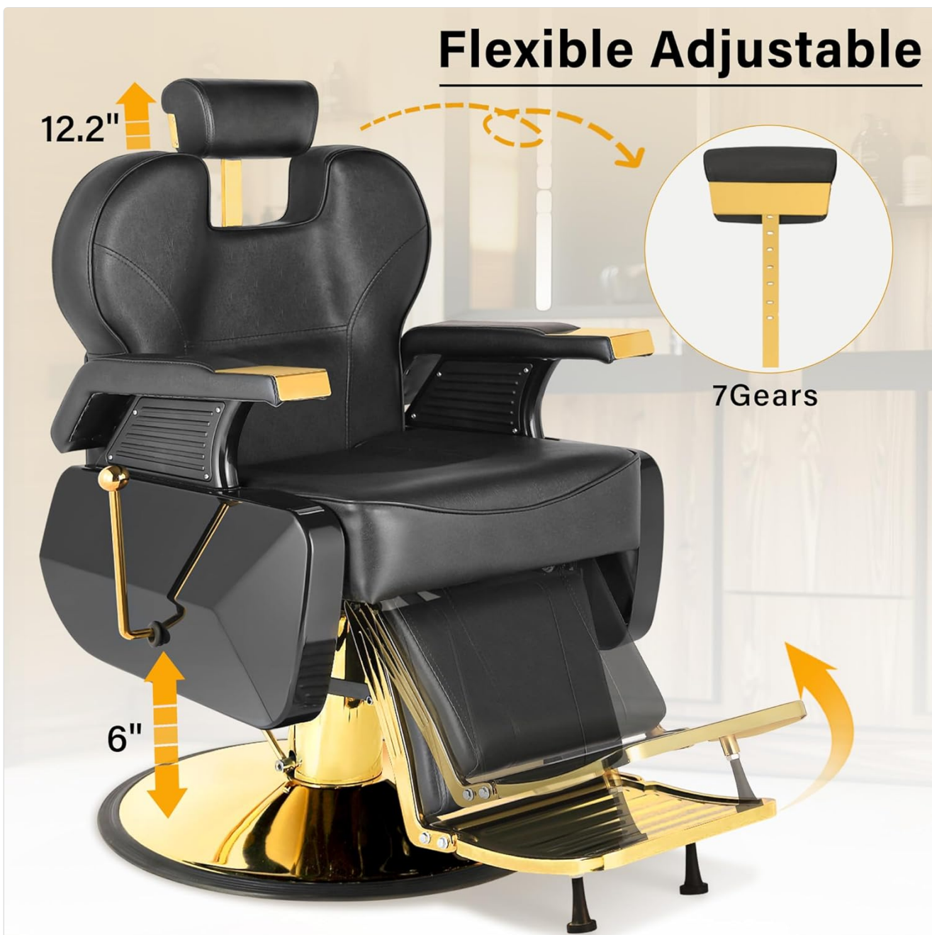
Image Description: An image highlighting the adjustable headrest and seat height, along with the flip-up footrest of the KIIUMI Barber Chair.