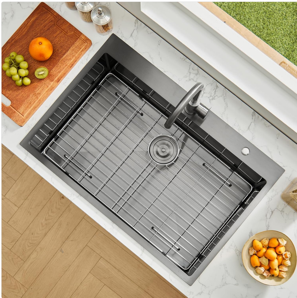
Image: The VEVOR 33-inch Kitchen Sink installed in a countertop, featuring the protective bottom grid in place, ready for daily use.