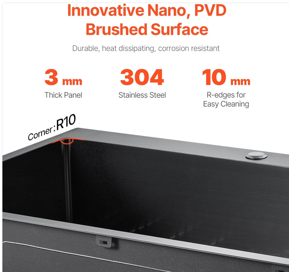
Image: Close-up of the VEVOR sink's innovative Nano PVD brushed surface, highlighting its 3mm thick panel, 304 stainless steel material, and R10° rounded corners designed for easy cleaning.