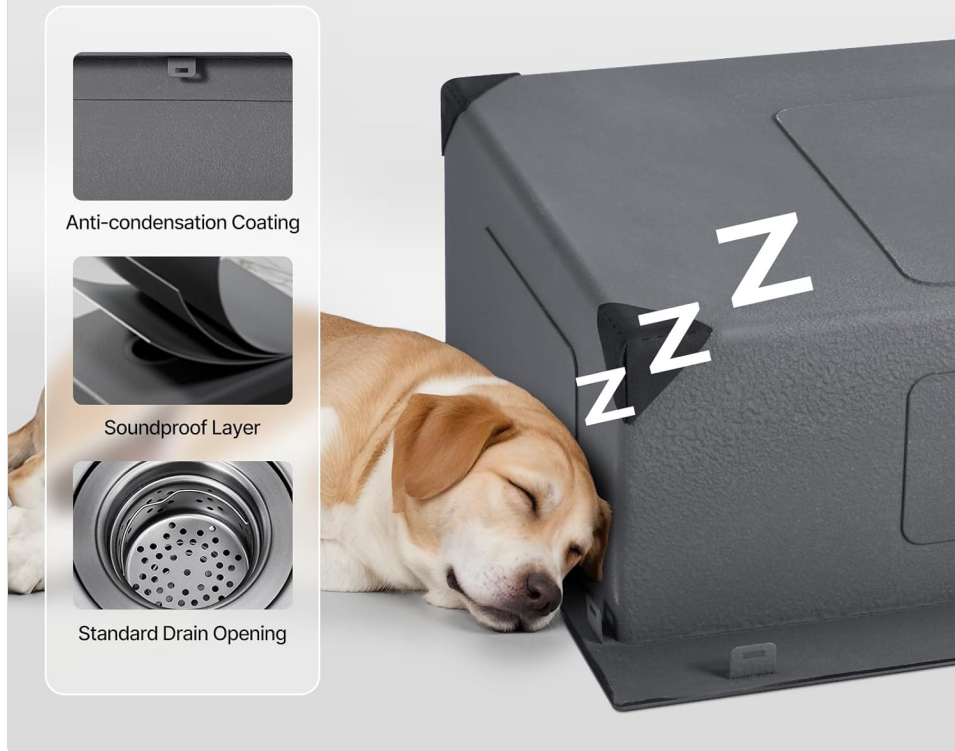
Image: Illustration of the VEVOR sink's soundproofing and anti-condensation features, including the anti-condensation coating and soundproof layer, contributing to quiet operation.