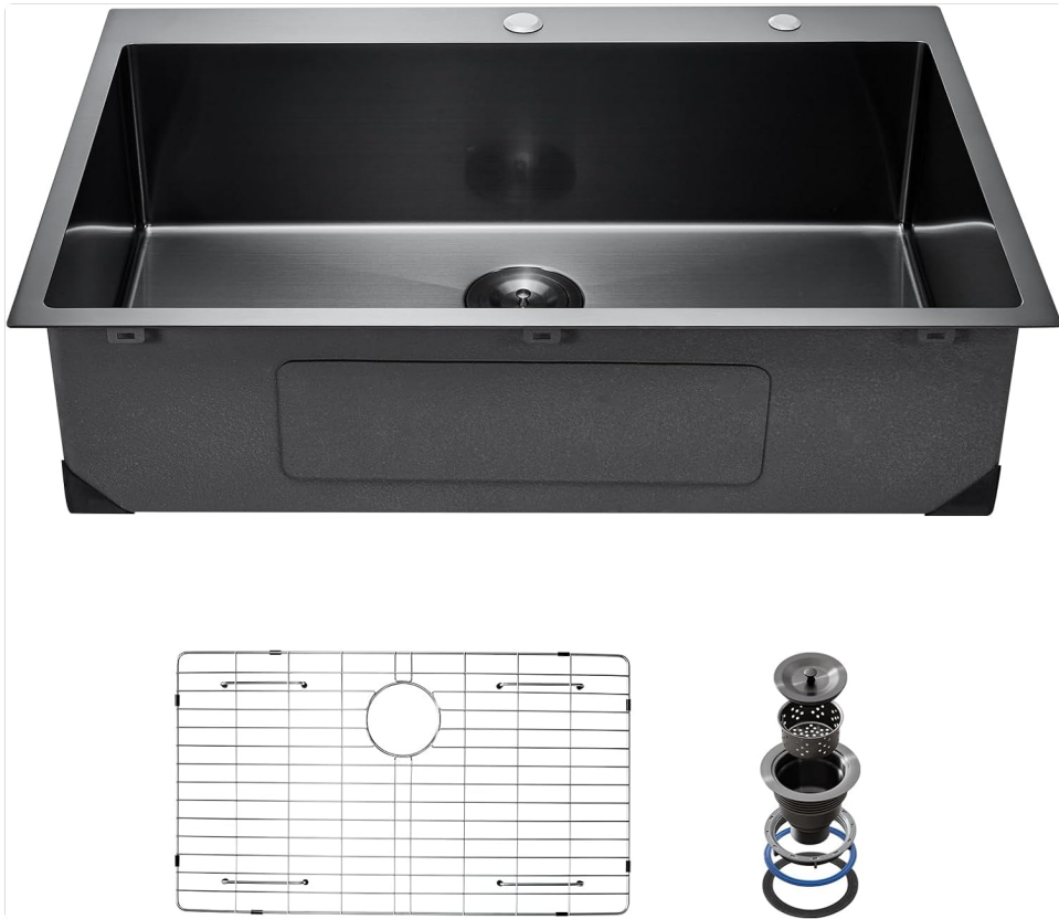
Image: The VEVOR 33-inch Black Kitchen Sink Workstation, showcasing the sink, bottom grid, and drain assembly components.