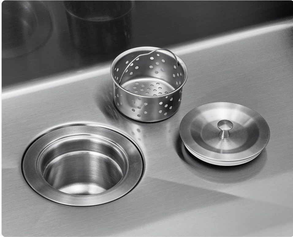
Image: Close-up view of the VEVOR sink's drain opening with the included strainer basket and stopper, demonstrating the accessories provided.