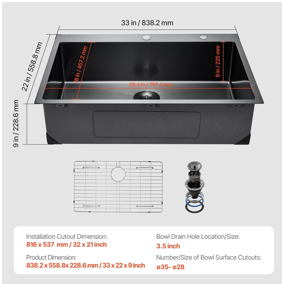
Image: Detailed diagram showing the external dimensions (33x22 inches), internal dimensions (32x21 inches), bowl depth (9 inches), and recommended installation cutout dimensions (32x21 inches) for the VEVOR sink.