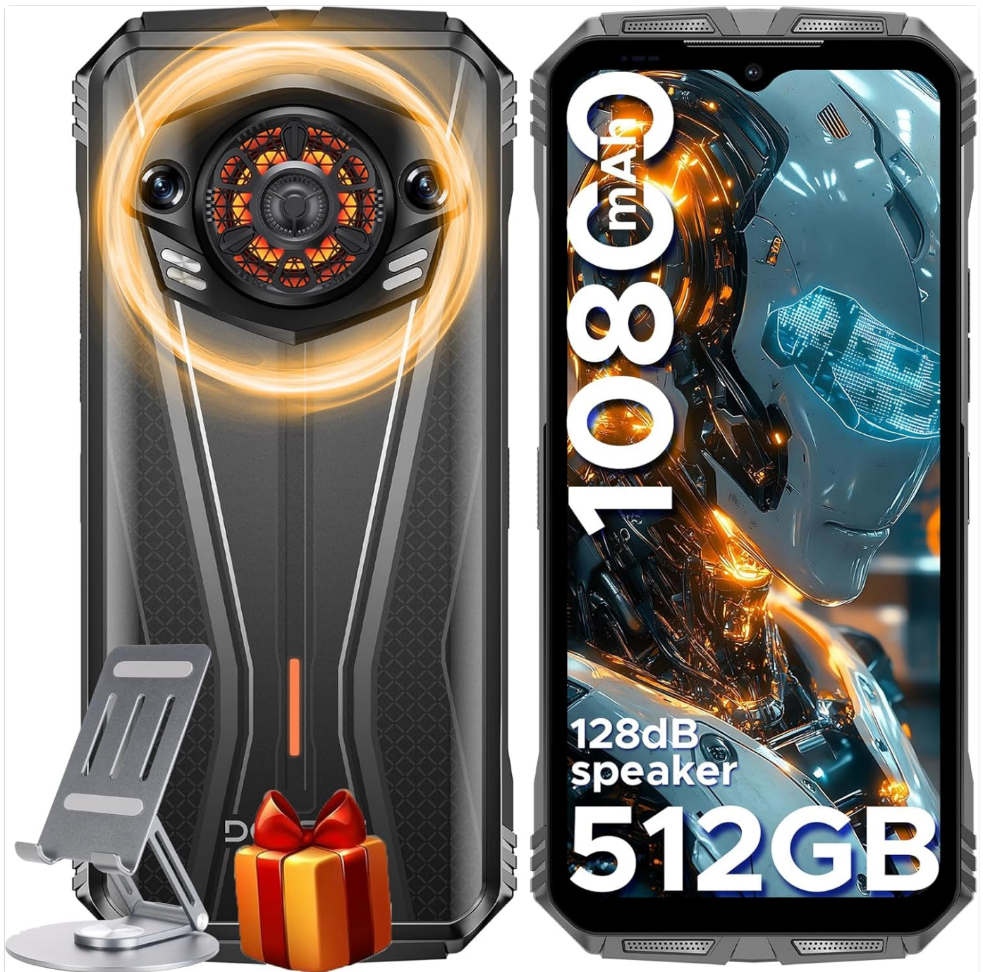
The DOOGEE S Punk Pro (2025) Rugged Phone, showcasing its front display and the unique rear design with the large speaker and dynamic lighting.