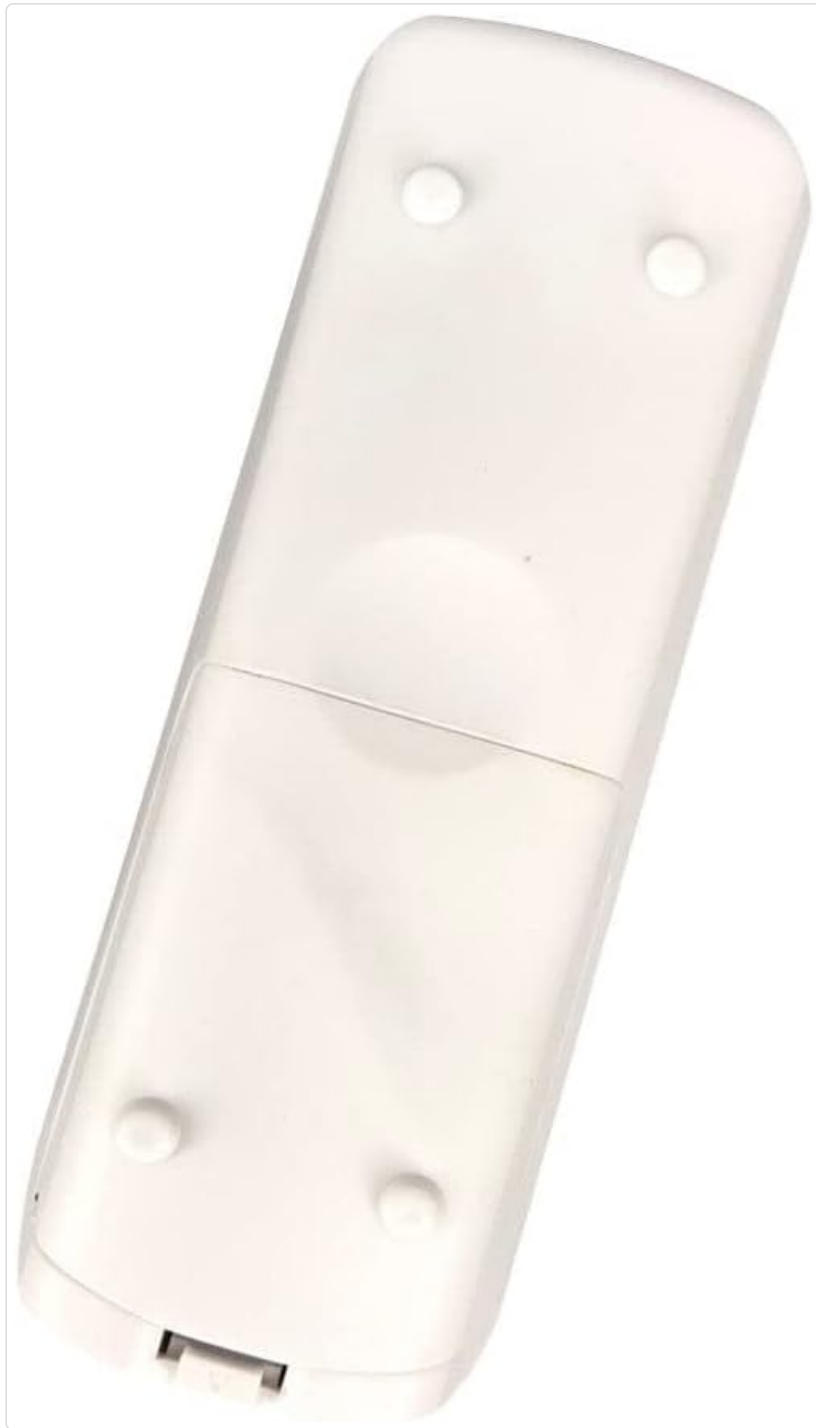
Figure 2: Back View of the Remote Control. This image shows the rear of the white replacement remote control. The design is simple, featuring a smooth surface with a visible battery compartment cover in the lower section, indicating where batteries are to be inserted.