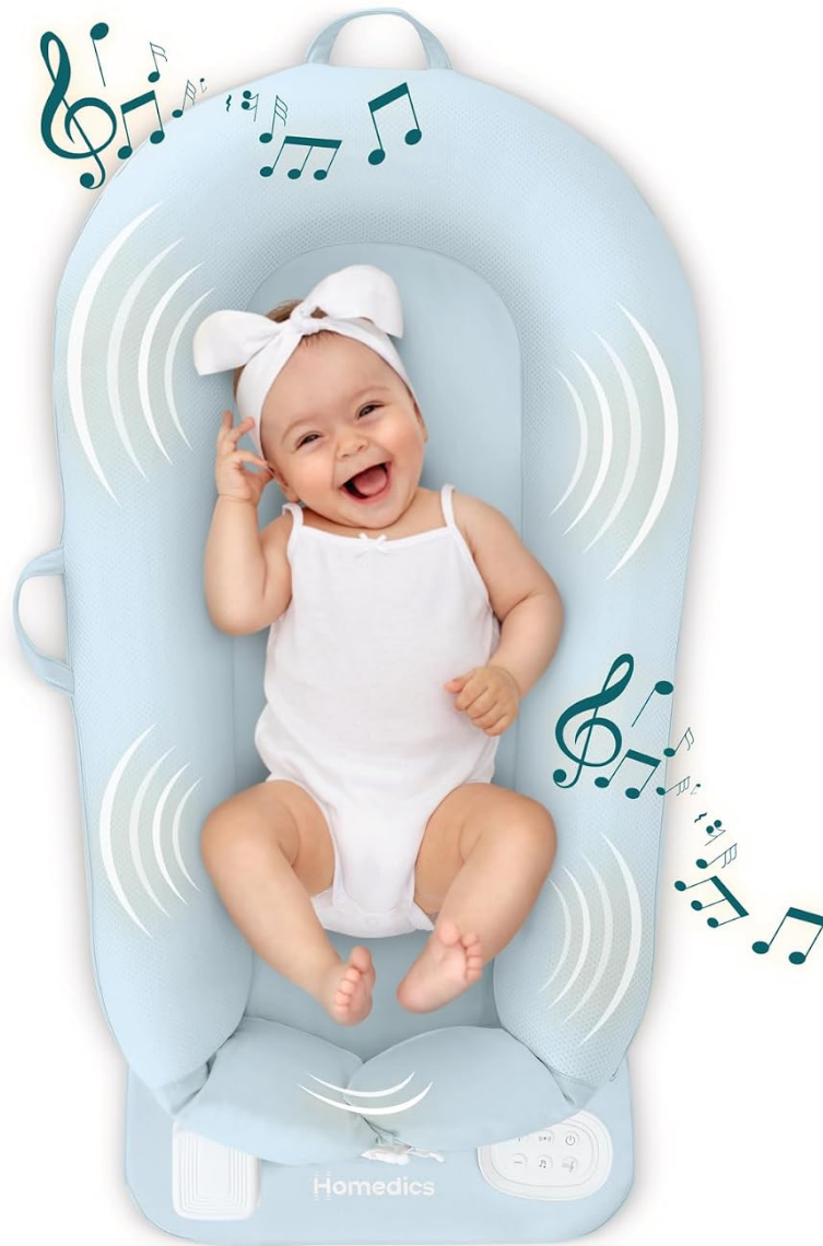
Figure 1: The MyBaby 3-in-1 Calming Baby Cushion, showcasing its soothing features with a content baby.