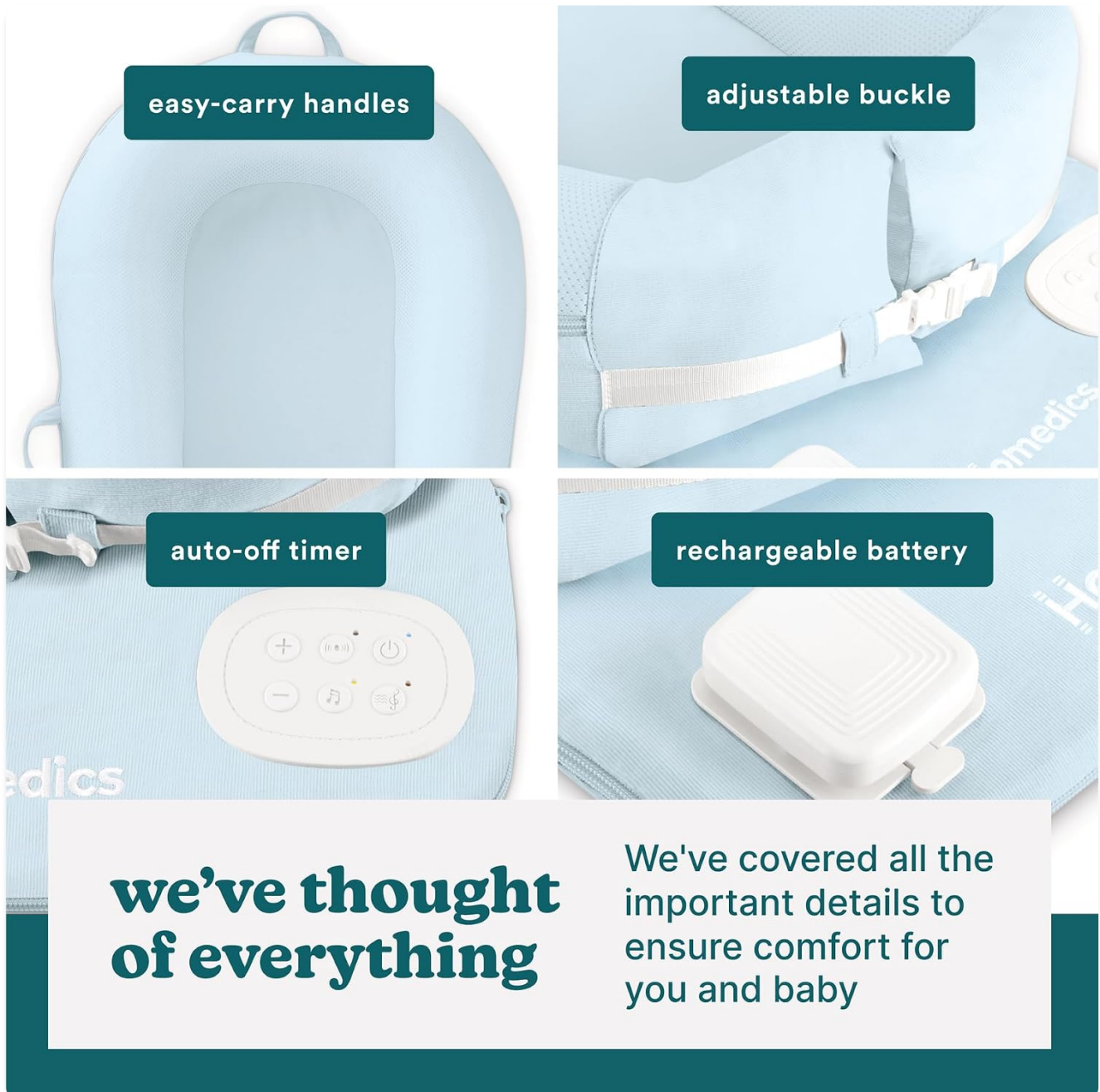
Figure 4: Detailed view of the cushion's control panel, handles, adjustable buckle, and the removable rechargeable battery.

Video 1: This video demonstrates how to place a baby into the cushion and highlights the soothing sound and vibration features, as well as the cushion's support for growing babies.