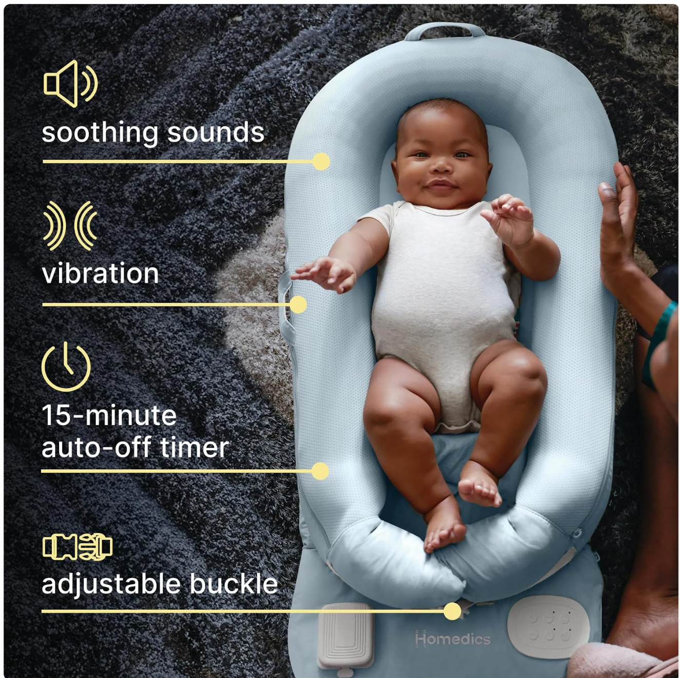
Figure 3: Visual guide to the cushion's main features, including sound, vibration, timer, and adjustable buckle.