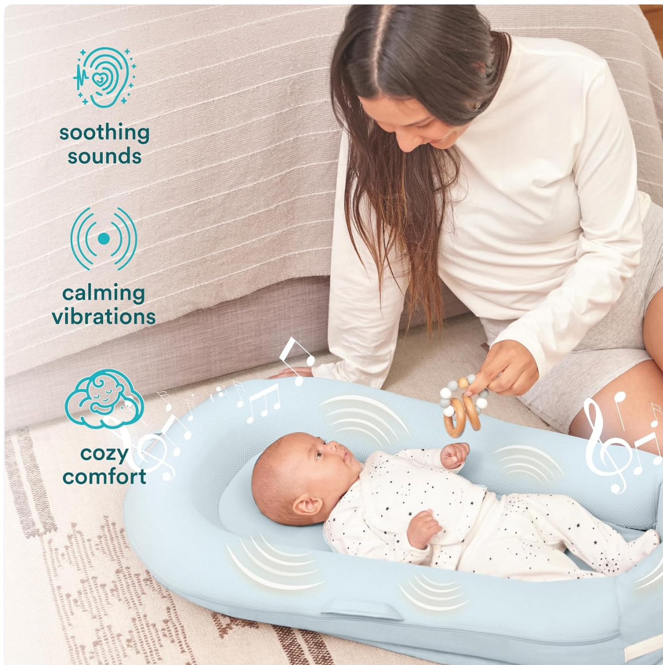
Figure 5: A baby enjoying the soothing sounds and gentle vibrations provided by the cushion.