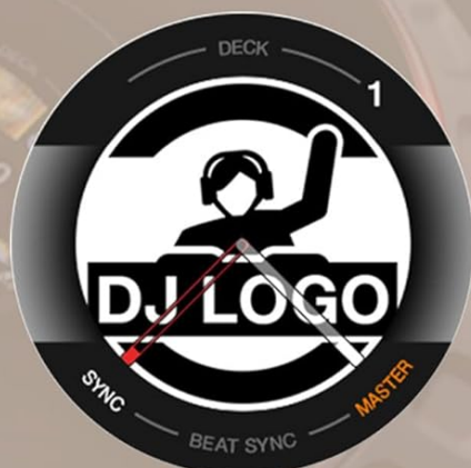
DJ Logo Display

Customize jog displays with 4 modes showing features like 3 Band Waveforms (rekordbox only), Mix Point Link, vocal analysis, and Performance Pad status—stay focused on your decks!