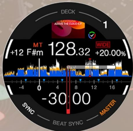
Deck Info mode