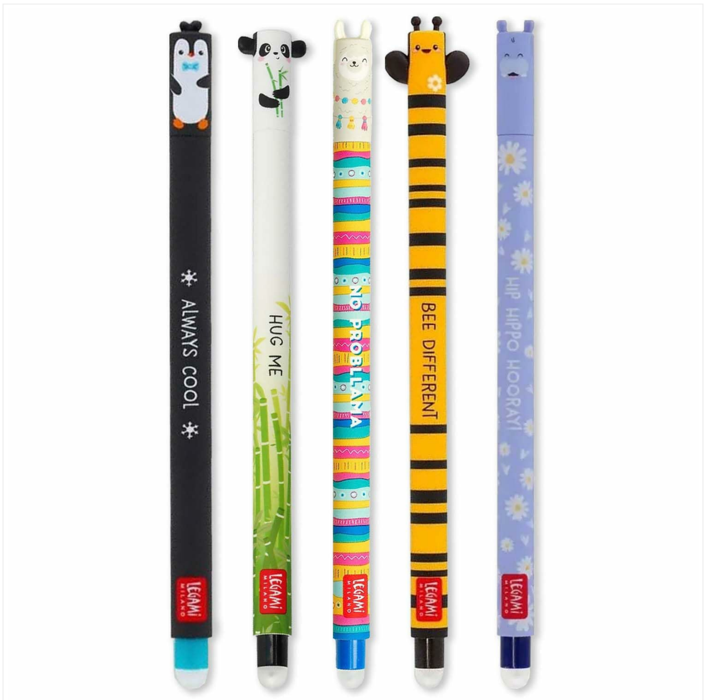
Image: The complete set of five Legami erasable gel pens, each featuring a different animal design and ink color.