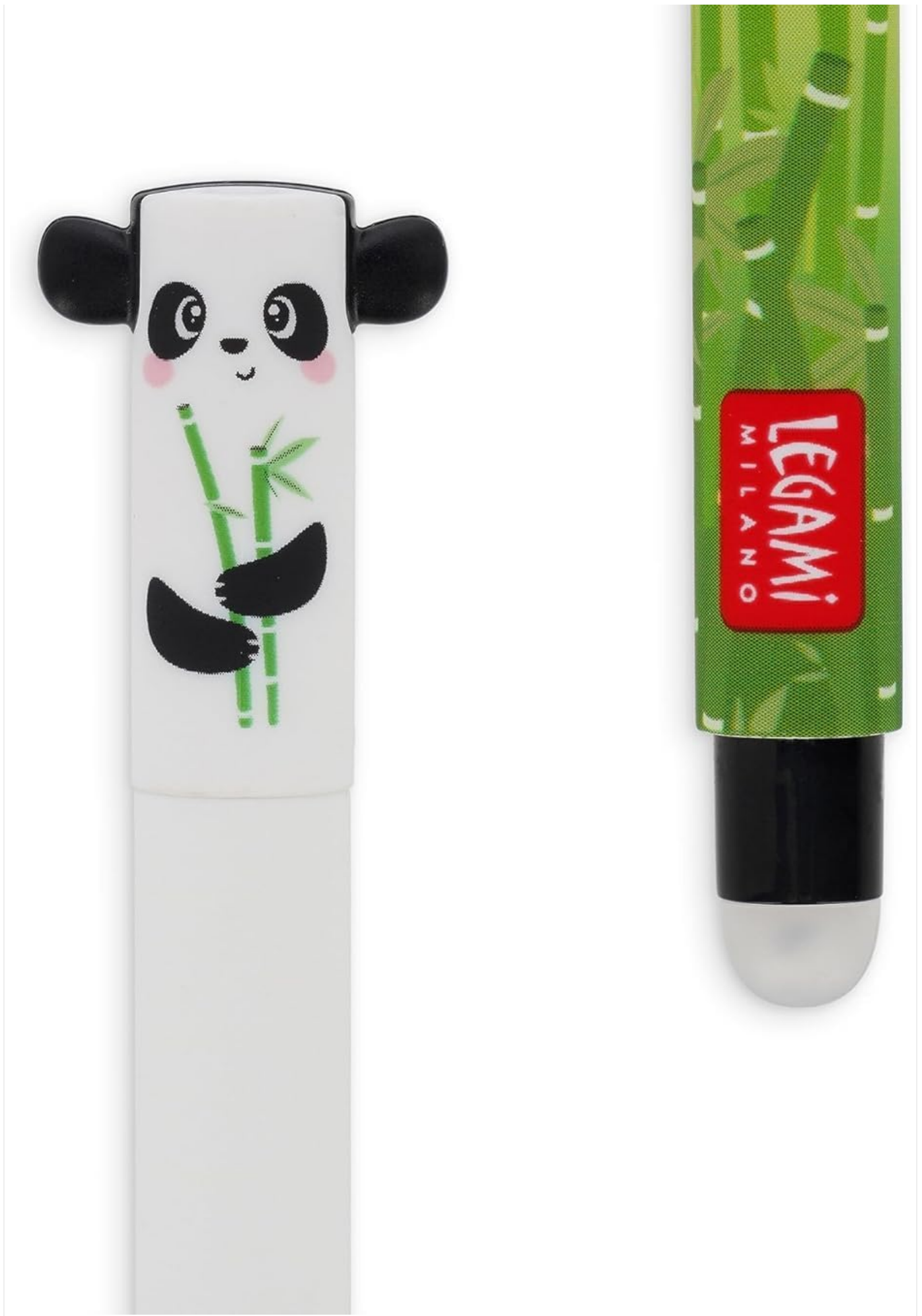
Image: A detailed view of the eraser mechanism at the top of the Legami Panda pen.