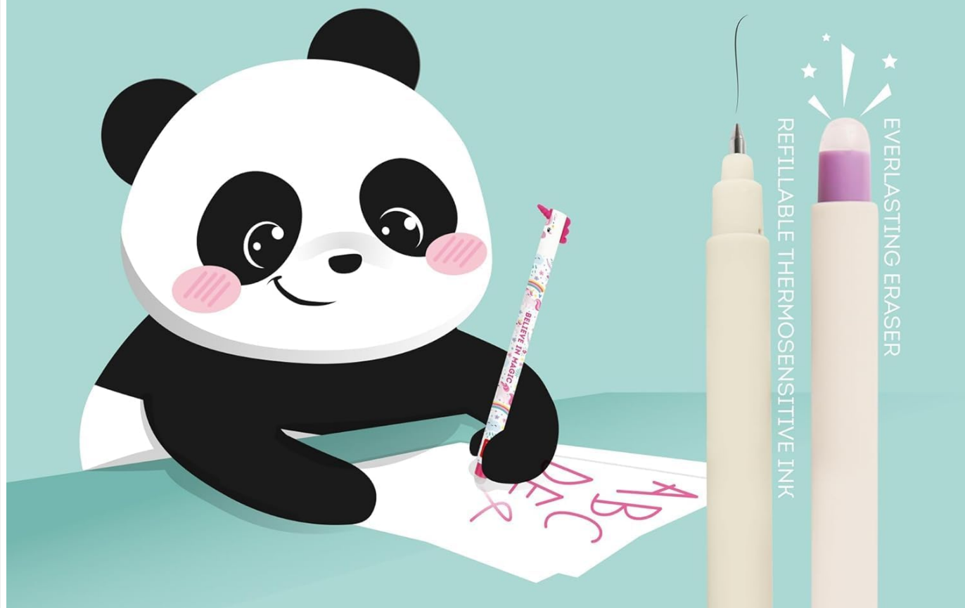
Image: An infographic highlighting the key features of Legami erasable pens, including refillable thermosensitive ink and an everlasting eraser.