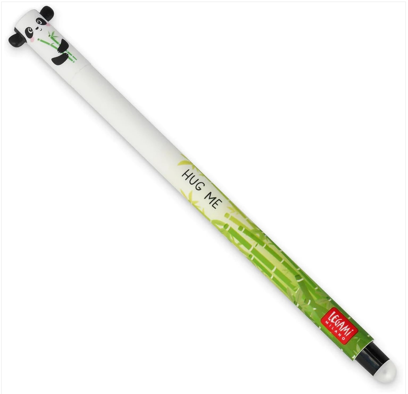
Image: A close-up view of one of the Legami erasable gel pens, highlighting its design and cap.