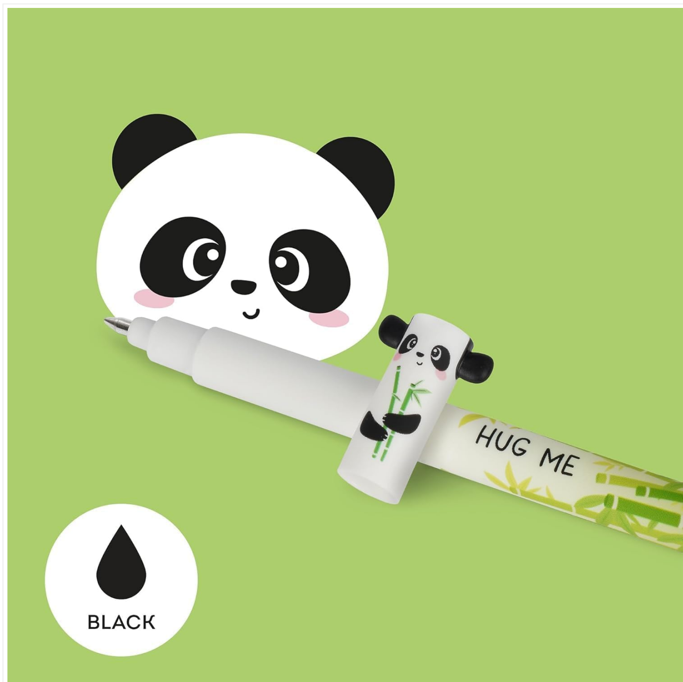
Image: A close-up of the Panda-designed pen, indicating its black ink color.