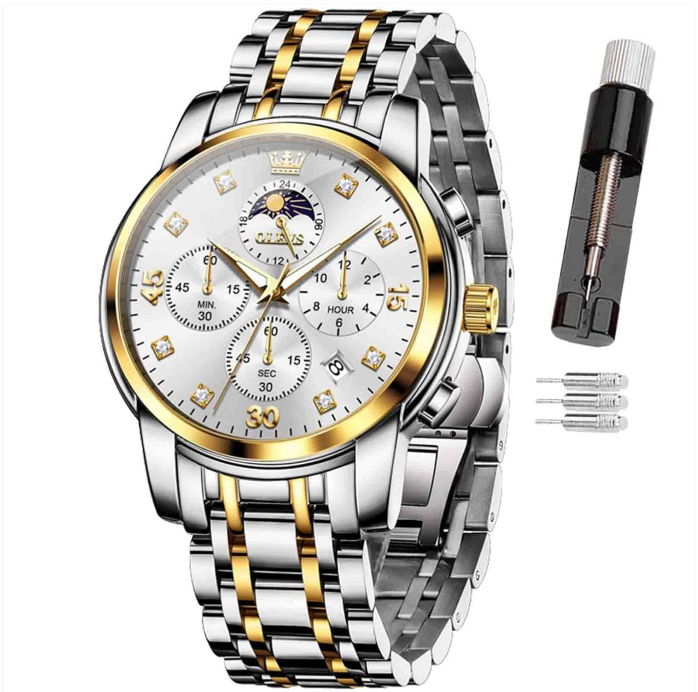
Figure 1: OLEVS IN-3652 Multifunction Chronograph Watch (Two-tone strap, white dial variant)