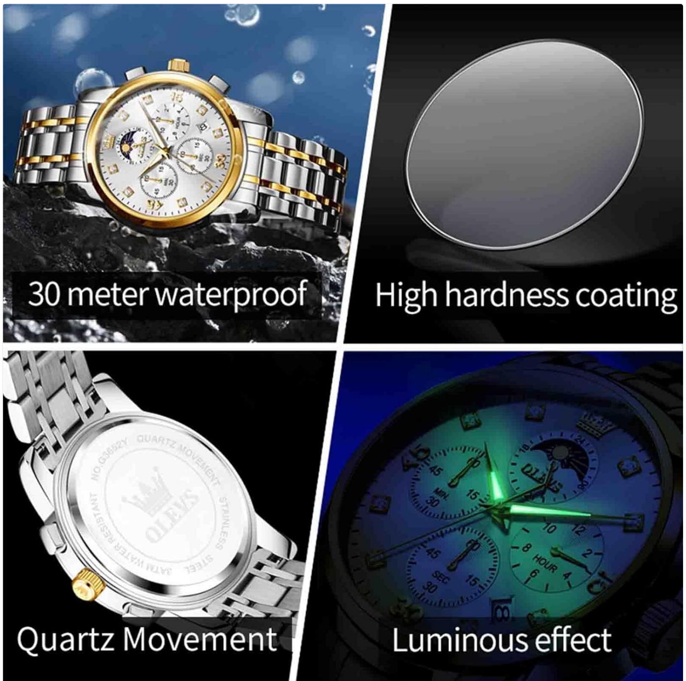
Figure 2: Key features of the OLEVS IN-3652 watch, including water resistance, crystal coating, movement type, and luminous display.