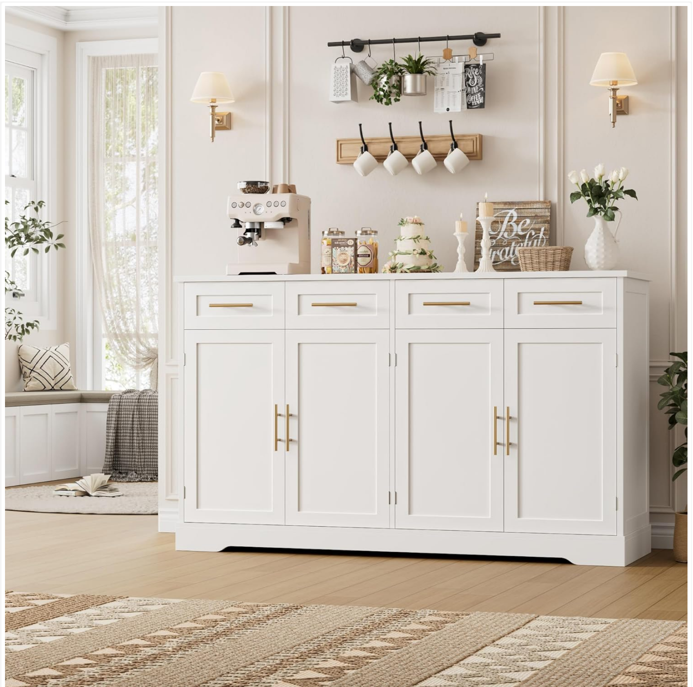
Image: The sideboard functioning as a coffee bar in a living room.

Video: An official product video demonstrating the features and versatility of the HOSTACK 60-inch Large Buffet Sideboard. This video highlights the gold handles, extra-wide tabletop, easy-glide drawers, concealed cupboards, and overall tall structure suitable for multiple scenarios.