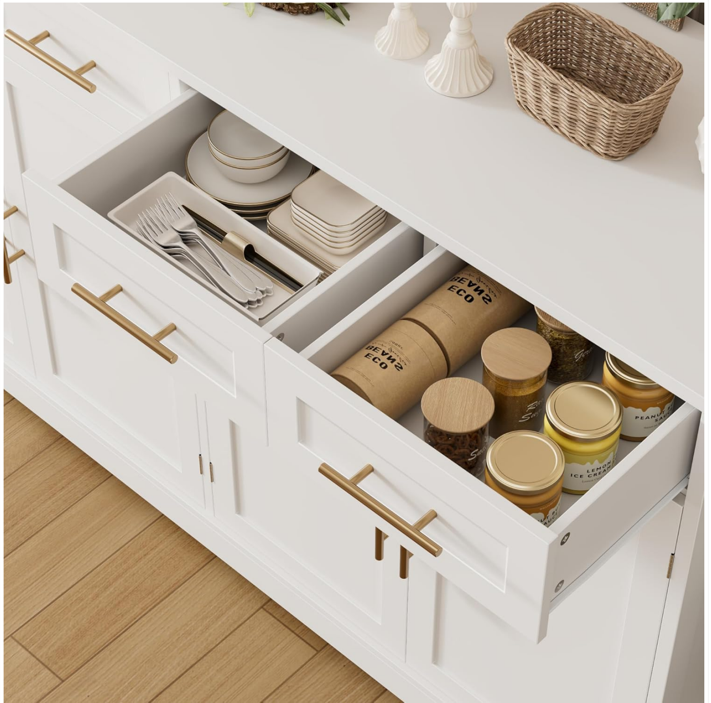
Image: Example of organized storage within the easy-glide drawers.