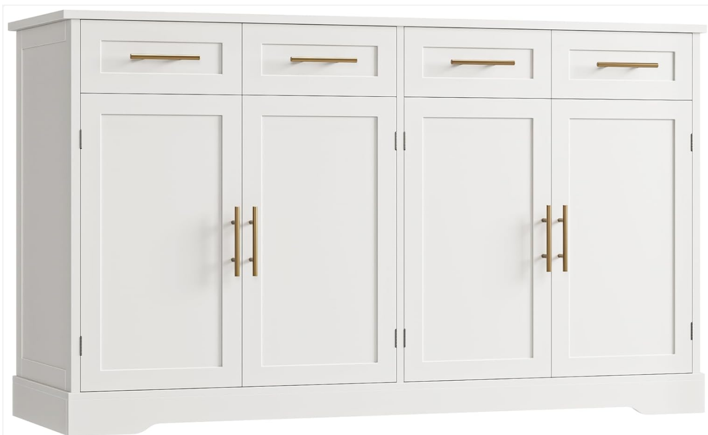
Image: Front view of the assembled HOSTACK Buffet Sideboard.