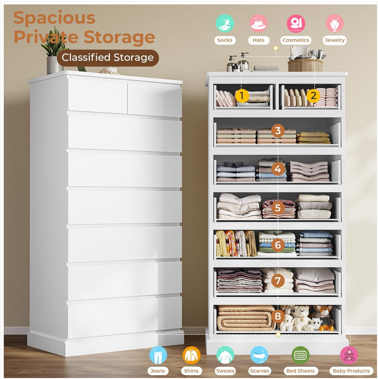
Image: Illustration of the DICTAC Tall Dresser's spacious and classified storage, showing various items like socks, hats, cosmetics, jewelry, jeans, shirts, and baby products organized within its eight drawers.