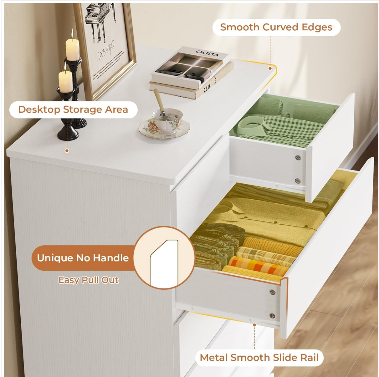
Image: Close-up view of the DICTAC Tall Dresser highlighting the unique no-handle bevel design for easy drawer pull-out and the smooth metal slide rails.