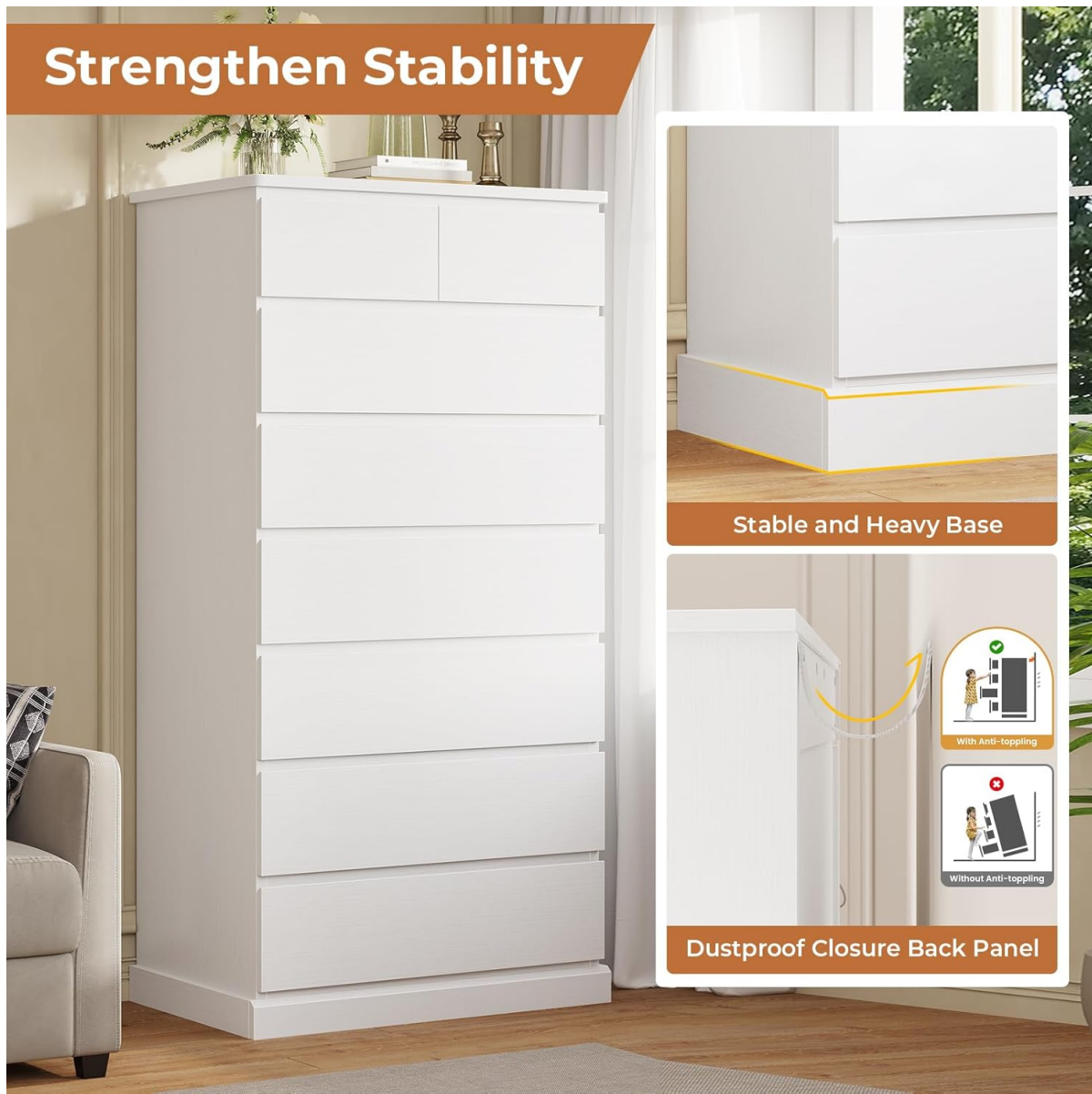
Image: The DICTAC Tall Dresser demonstrating its stable and heavy base, along with the dustproof closure back panel and the anti-tipping device for enhanced safety.