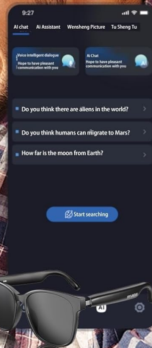
Image 4.2.1: Demonstrating the AI Voice Dialogue feature, allowing users to converse naturally with the AI.

There is currently no conclusive evidence to prove the existence of aliens in the world, But from a scientific perspective, the possibility of extraterrestrial existence is Cannot be excluded.