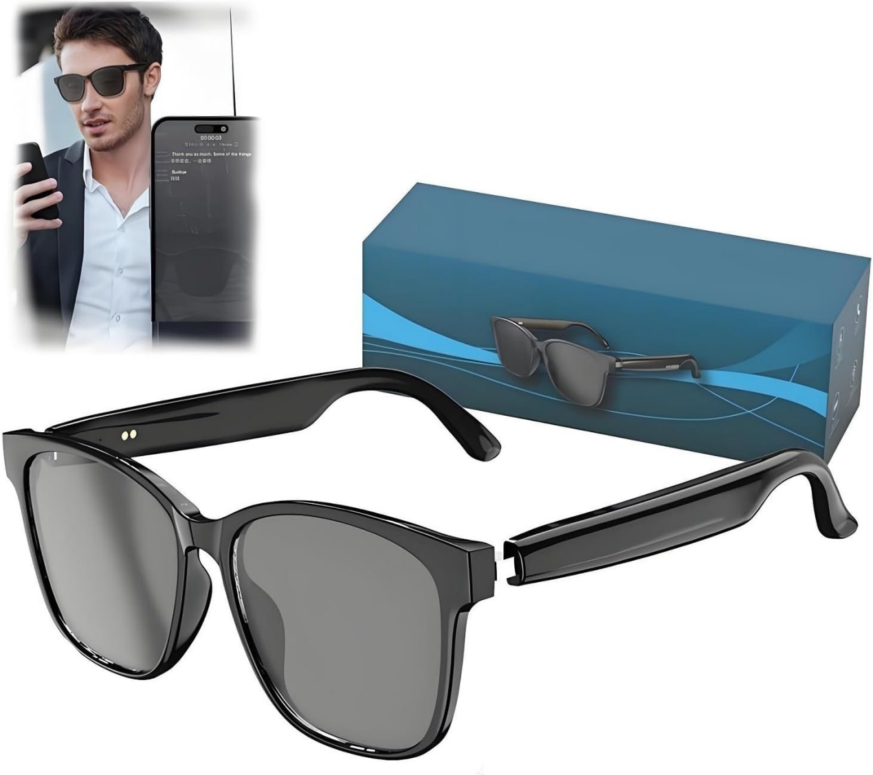
Image 1.1: The Hy C8 PRO Smart Glasses with their packaging, showcasing the sleek black design.