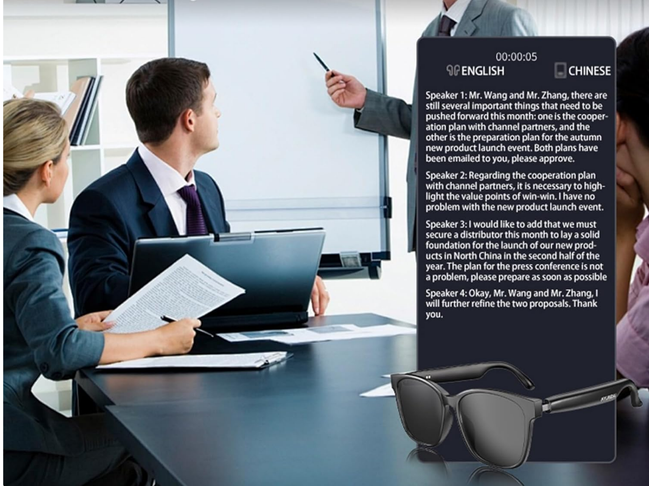
Image 4.3.1: Illustration of the on-site meeting recording feature, showing real-time transcription and translation.

You can start live recording on the APP.