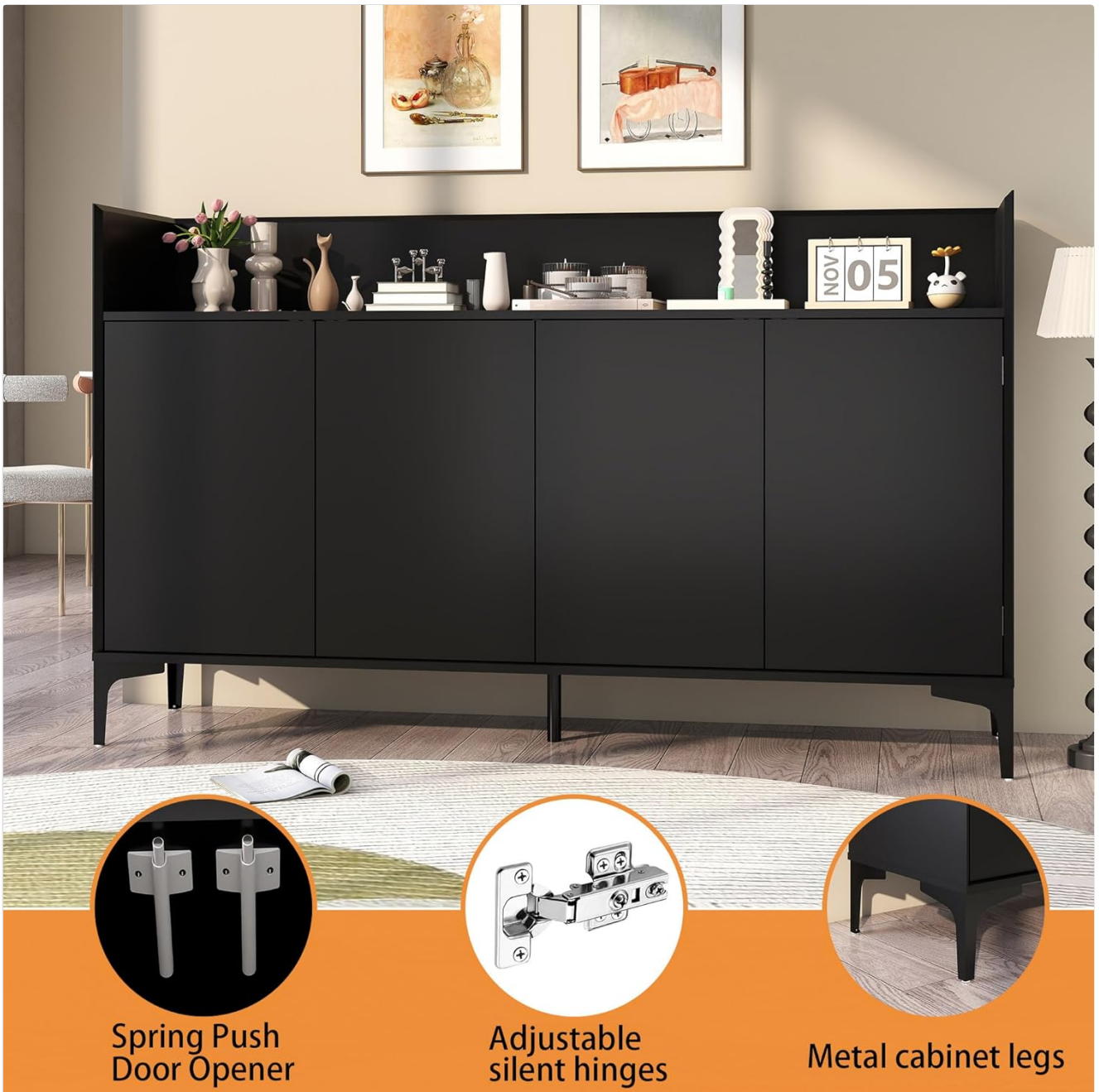
Figure 2: Close-up of the innovative door design features, including the spring push door opener and adjustable silent hinges, alongside the sturdy metal cabinet legs.