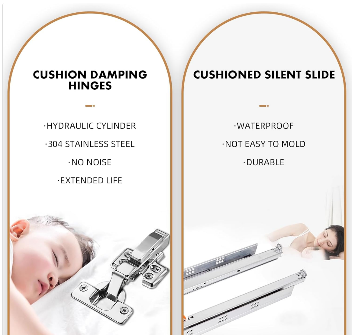
Figure 6.1: The vanity is equipped with hydraulic cylinder cushion damping hinges for quiet door closure and