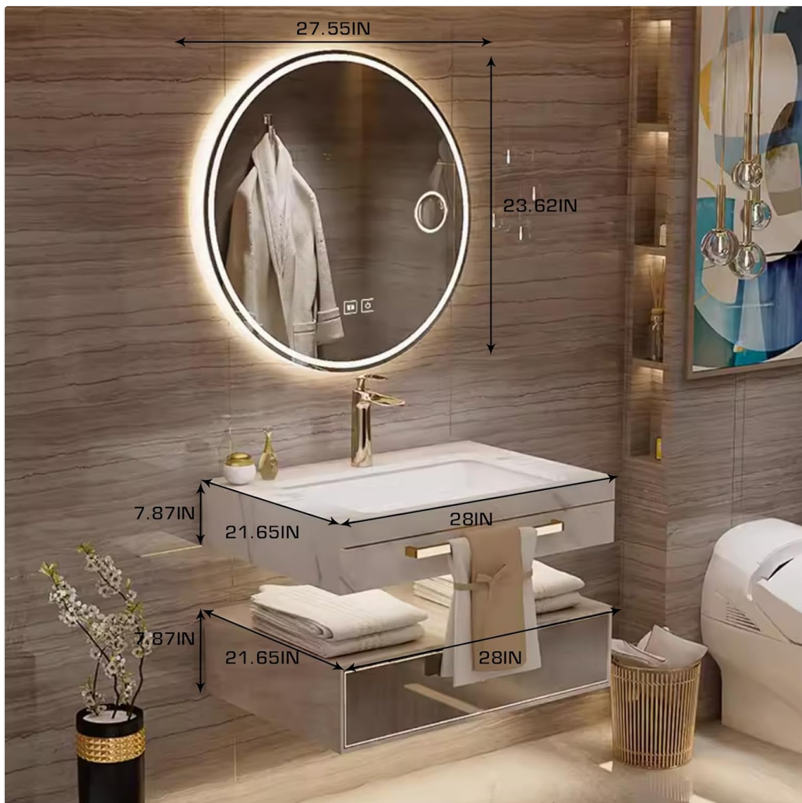
Figure 3.1: This diagram illustrates the overall dimensions of the vanity cabinet, sink, and LED mirror for proper installation planning.