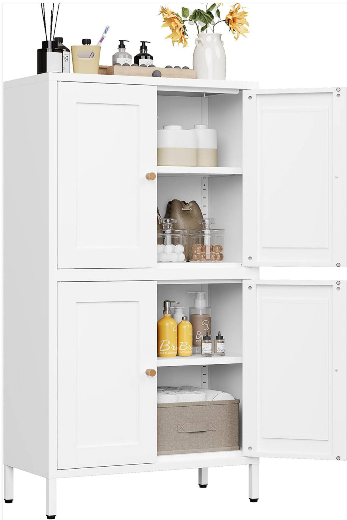
Image: SISESOL PT White Metal Storage Cabinet with 4 doors, open, showcasing internal shelves and items.