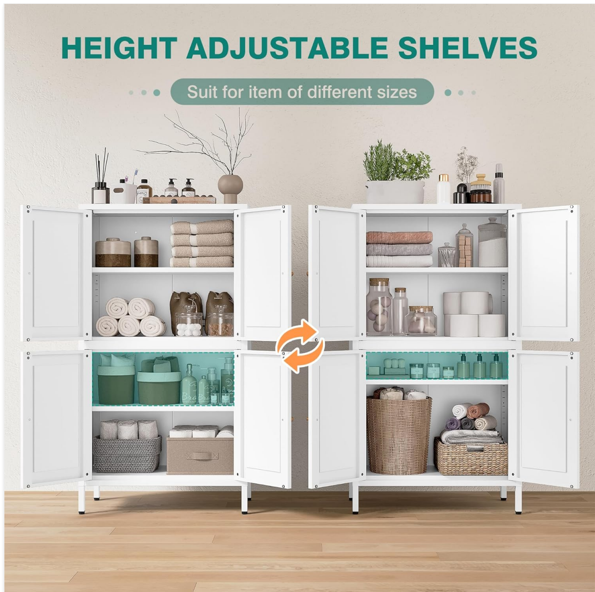
Image: Illustration demonstrating the height-adjustable shelves, allowing customization for items of different sizes.

Insert the shelf clips into the desired height slots on the side panels. Place the adjustable shelves onto the clips. You can customize the shelf heights to accommodate items of various sizes.