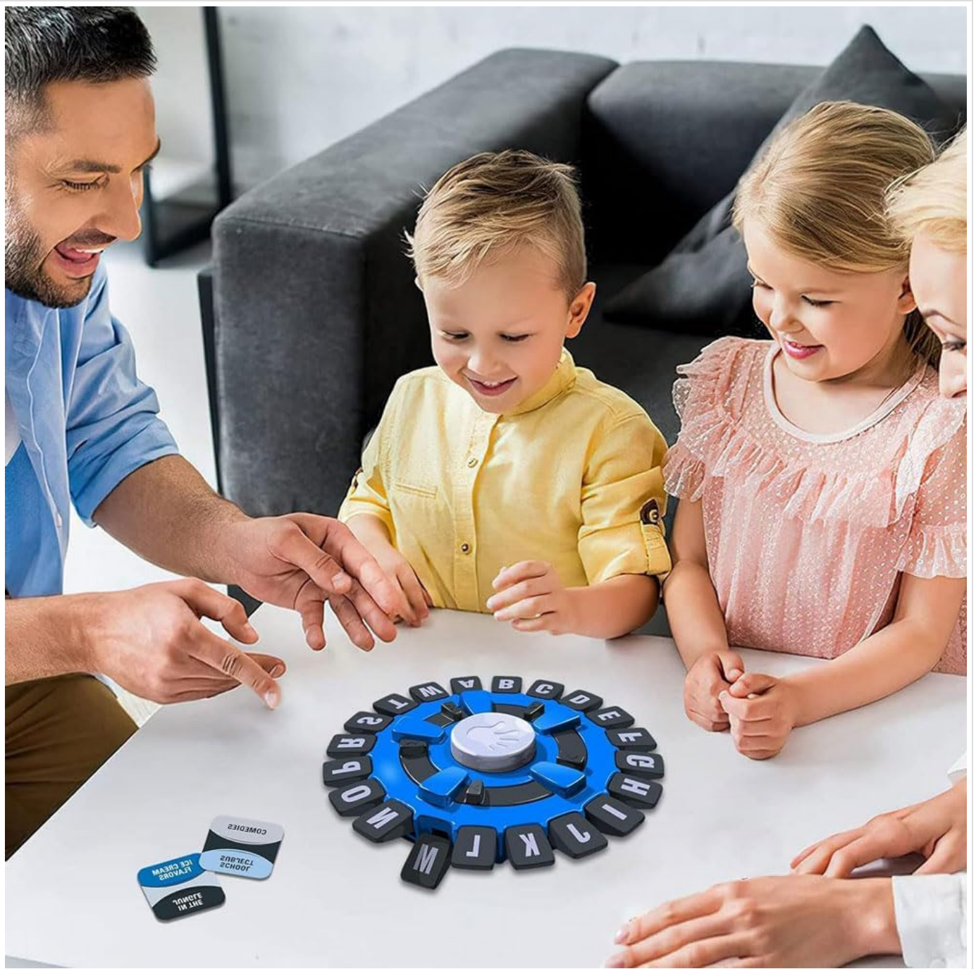
Image: A family, including two adults and two children, gathered around a table, actively engaged in playing the GERUI Words Game. The game board is central, with theme cards nearby, depicting a typical game session.