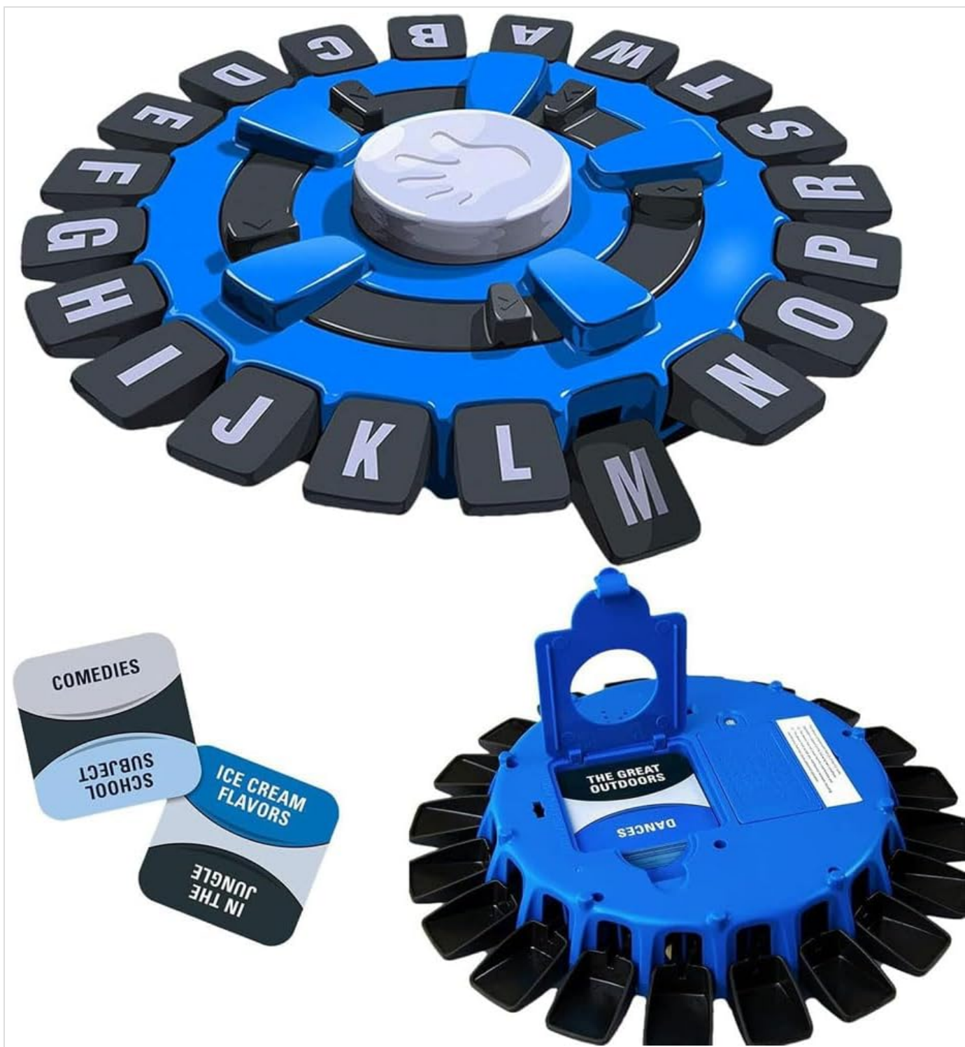
Image: The underside of the GERUI Words Game board, revealing the battery compartment and a stack of theme cards. This view helps in understanding how to install batteries.