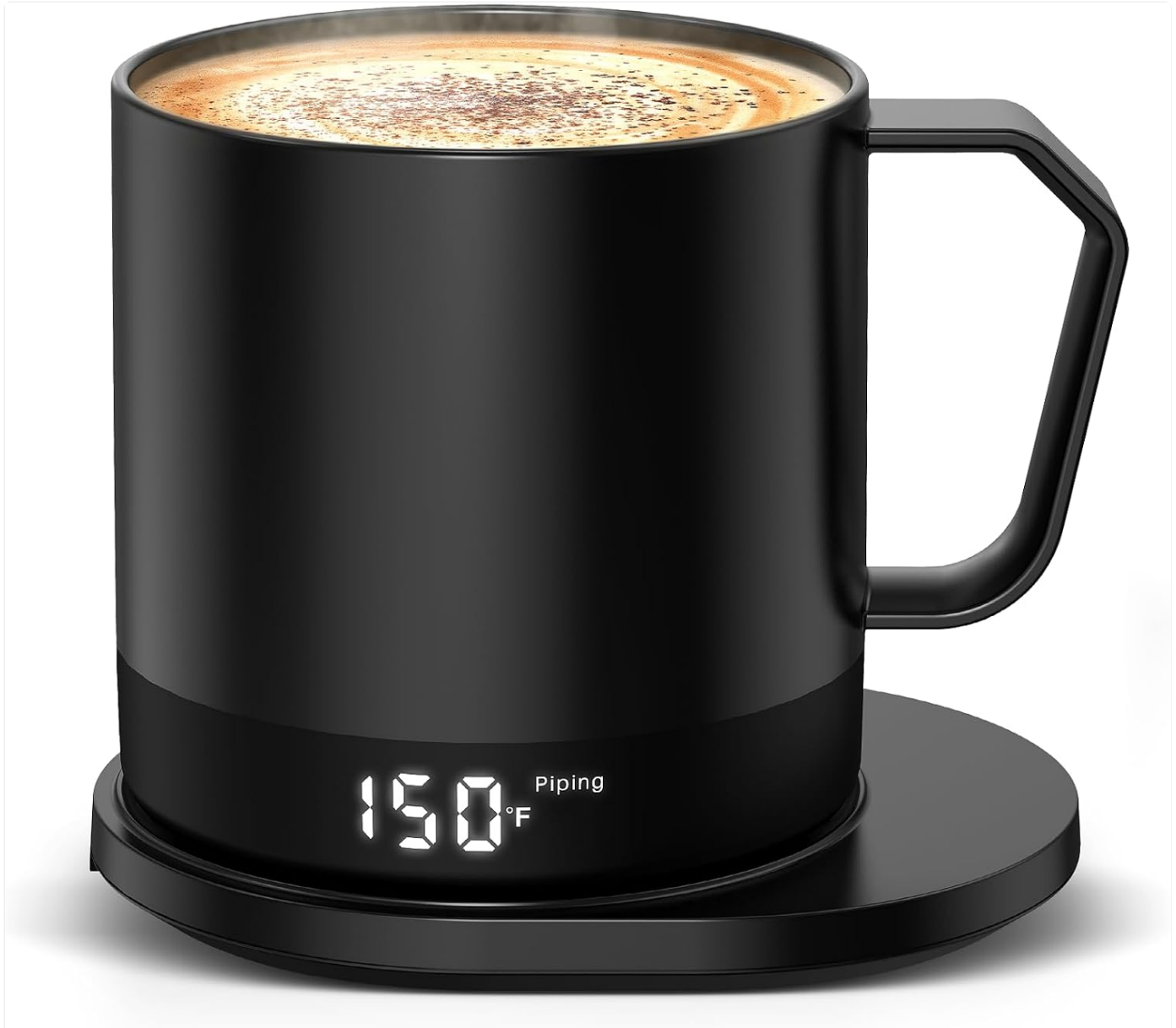
Image: The BUUO Smart Mug placed on the charging coaster, showing the digital temperature display. This illustrates the coaster's function in maintaining the mug's temperature.