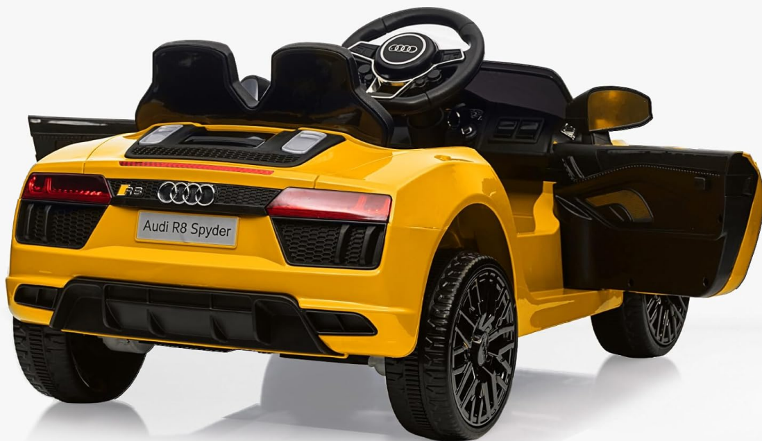
Image 3: Steering wheel and dashboard controls, including multimedia functions.