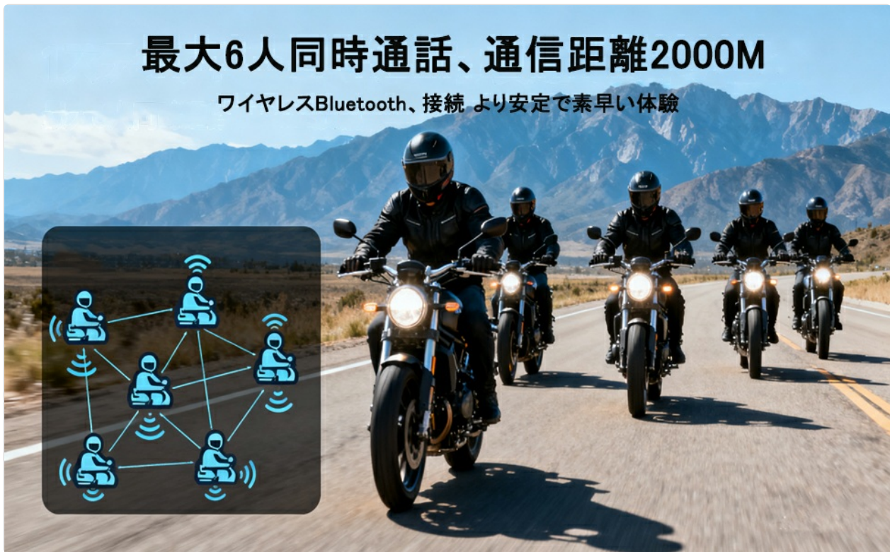
Image 5.2: Visual representation of up to 6 riders engaged in group intercom communication.

reconnection, so if a rider goes out of range, they will automatically rejoin the conversation when back in range.