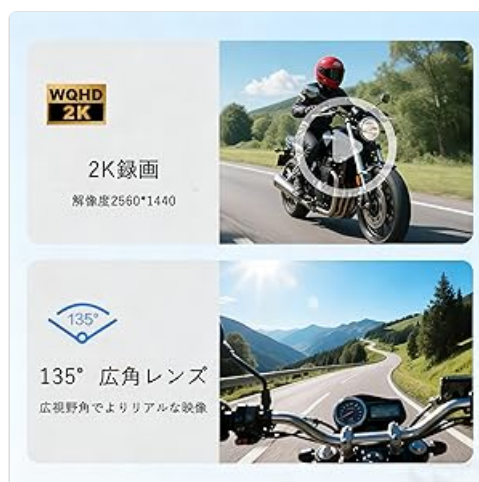
Image 5.3: Details on 2K video resolution (2560*1440) and the 135° wide-angle lens for comprehensive capture.