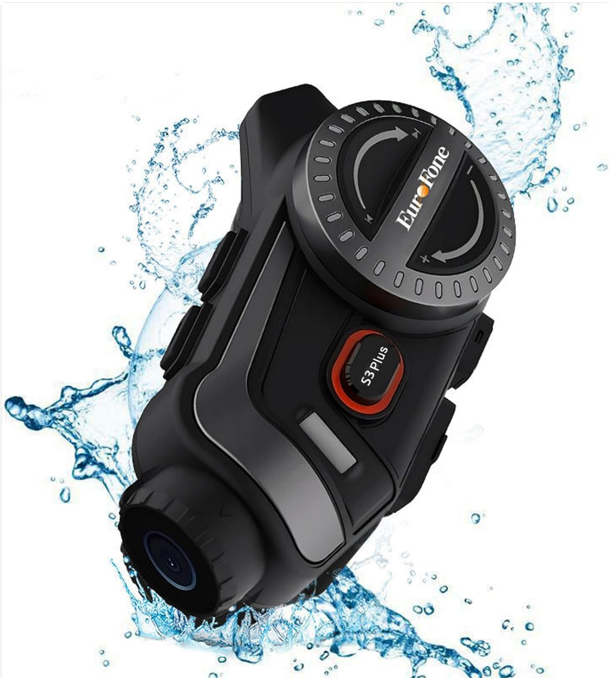
Image 6.1: The S3 Plus unit demonstrating its IP67 waterproof and dustproof capabilities.