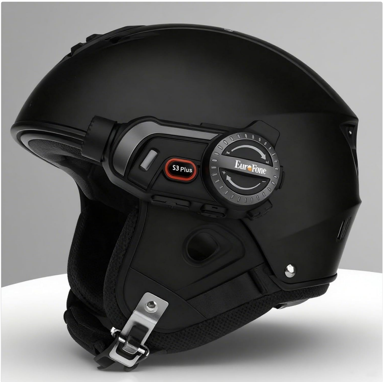
Image 4.1: The S3 Plus intercom unit securely attached to the side of a helmet.