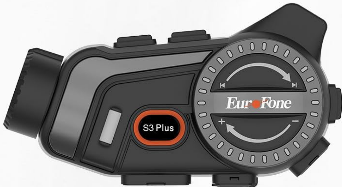
Image 1.1: The EuroFone S3 Plus Intercom unit, showcasing its compact design and control dial.