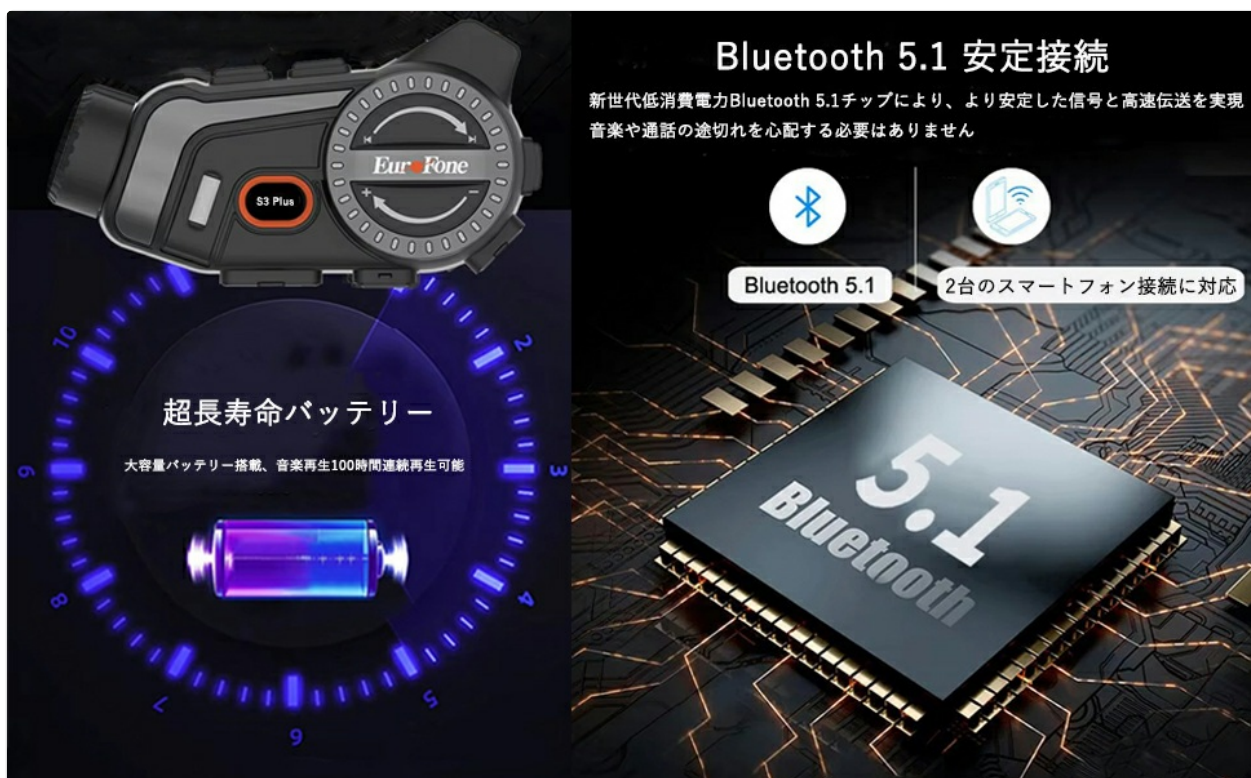
Image 5.1: Illustration of Bluetooth 5.1 connectivity and extended battery performance.