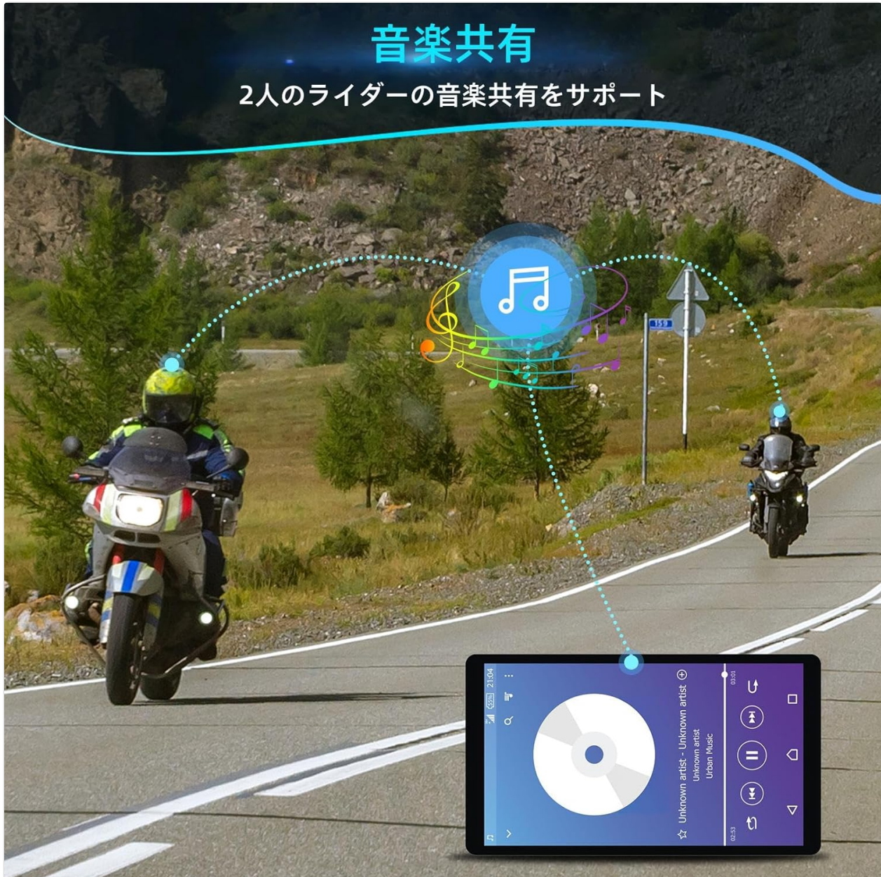
Image 5.4: Two riders enjoying shared music during their journey, illustrating the music sharing feature.