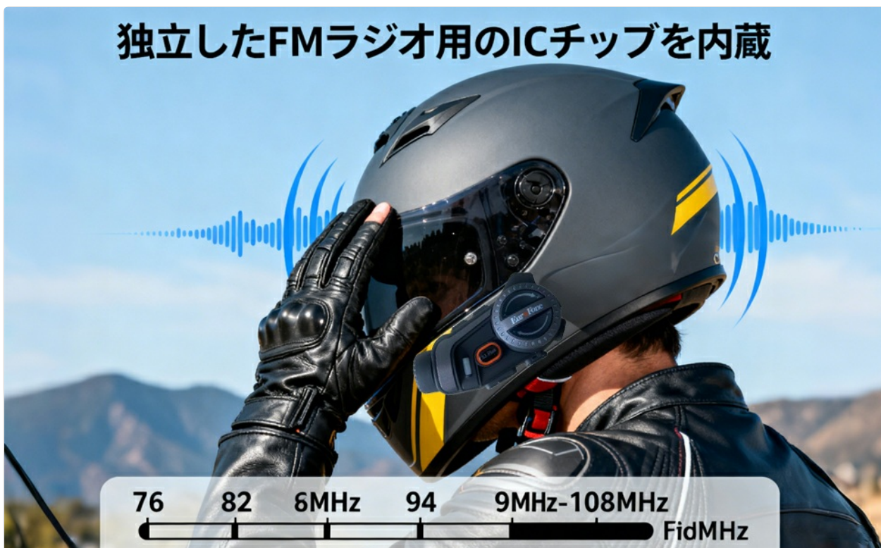
Image 5.5: A rider listening to FM radio, highlighting the integrated FM radio functionality.