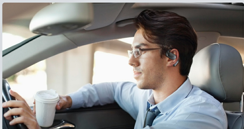
Image: A man driving while wearing the earbuds, emphasizing safe driving by allowing awareness of traffic sounds.

Profitez de la musique tout en écoutant les sons importants de la circulation. Encouragez un comportement de conduite sécuritaire.