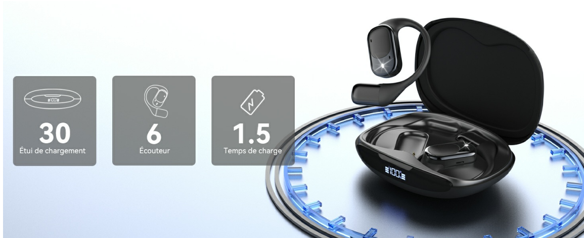
Image: Charging case displaying battery levels for both the case and individual earbuds. The case provides up to 30 hours of additional playtime, with earbuds offering 6 hours per charge, and a full charge taking approximately 1.5 hours.

Before first use, fully charge the earbuds and charging case. Place the earbuds into the charging case. Connect the USB charging cable to the charging port on the case and to a power source.