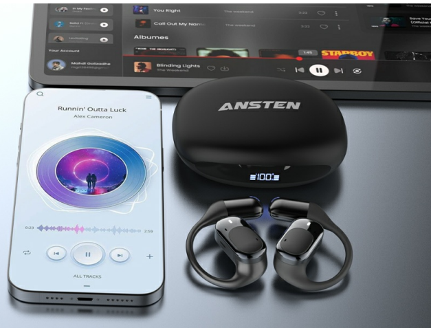
Image: The ANSTEN Y70 earbuds shown connected to a smartphone and a tablet, illustrating their wide compatibility with multiple devices.

Compatible avec plusieurs appareils, vous pouvez le faire avec un seul appareil !