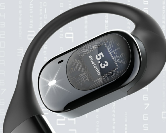
Image: Close-up of an earbud highlighting Bluetooth 5.3 connectivity for a quick and stable connection.

La connexion est une étape plus rapide mais le rejet prend beaucoup de temps.