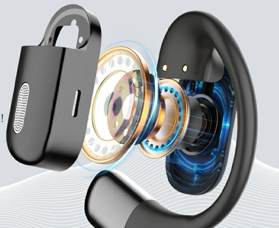
Image: An exploded diagram of an earbud showcasing its 10mm sound membrane, designed for a high-fidelity audio experience.

Membrane sonore de 10 mm pour une expérience sonore ultime !