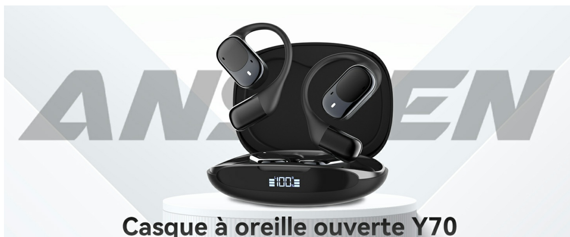
Casque à oreille ouverte Y70

Thank you for choosing the ANSTEN Y70 Open Ear Bluetooth 5.3 Earbuds. These earbuds are designed to provide a comfortable listening experience while maintaining awareness of your surroundings. Featuring advanced Bluetooth 5.3 technology, IPX6 water resistance, and intuitive touch controls, they are suitable for various activities including work, sports, and daily use.