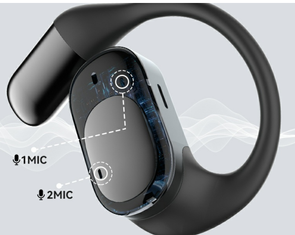
Image: Detailed view of an earbud highlighting the two integrated microphones for intelligent noise suppression during voice calls.

Appel vocal à double microphone, suppression intelligente du bruit