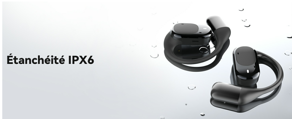
Image: The earbuds shown with water droplets, signifying their IPX6 water resistance, making them suitable for use during exercise or in light rain.

The ANSTEN Y70 earbuds are IPX6 water-resistant, meaning they can withstand powerful water jets. This makes them suitable for sports and outdoor use, protecting against sweat and rain. However, they are not designed for submersion in water. Do not use them while swimming or showering.