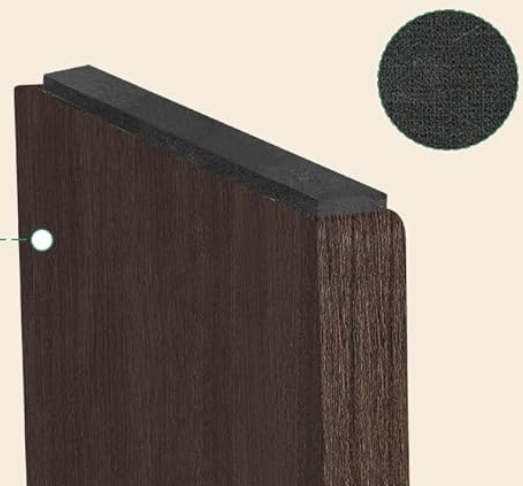
Figure 5.4: A practical and stylish addition to an entryway for quick access items.

Keeps it stable and protects your walls from scratches