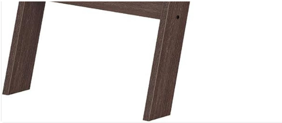
Figure 5.1: Blanket ladder in use, showcasing its storage capabilities for blankets and accessories.