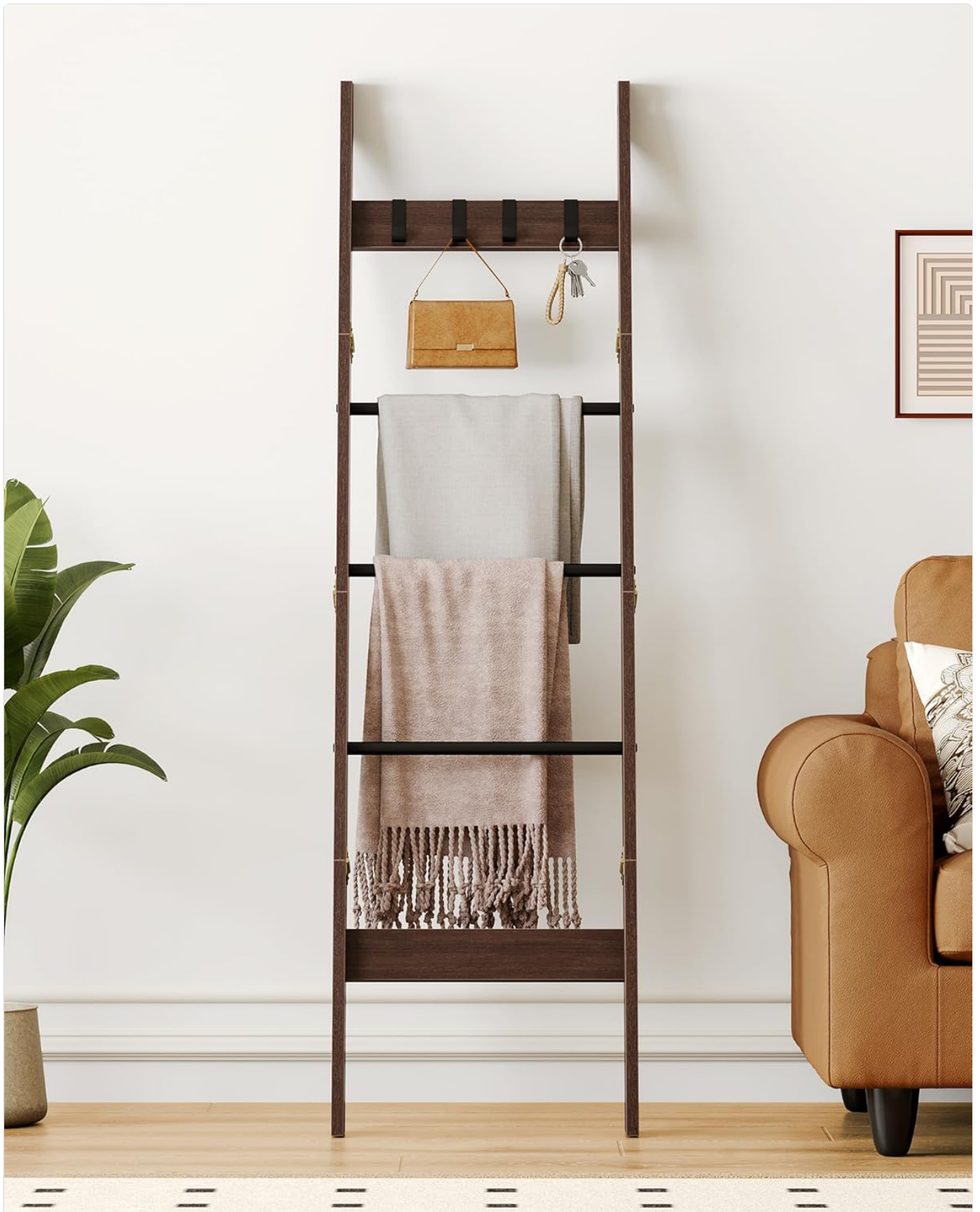
Figure 5.2: The ladder shelf seamlessly integrates into a living room, providing both storage and decor.