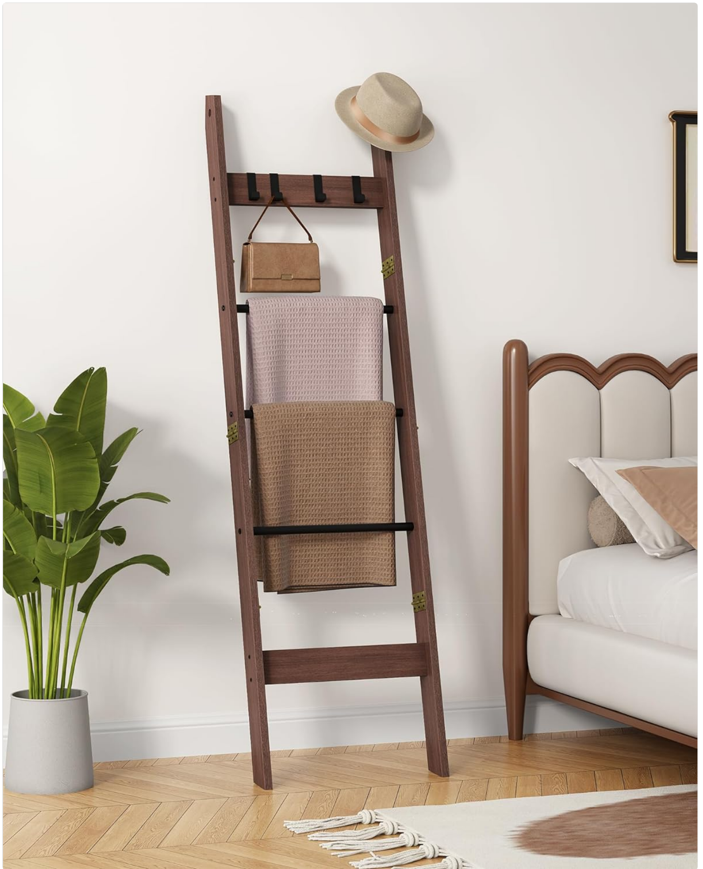
Figure 5.3: Ideal for bedroom use, keeping blankets and personal items organized.