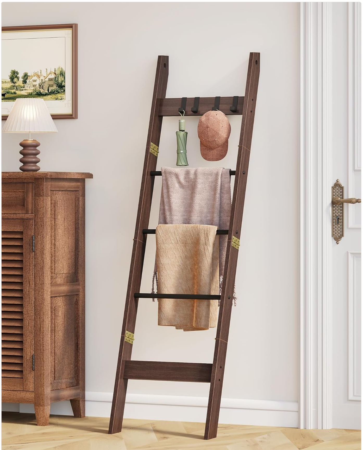
Figure 4.1: Key features for easy assembly and protection, including anti-slip felt pads and foldable hinges.