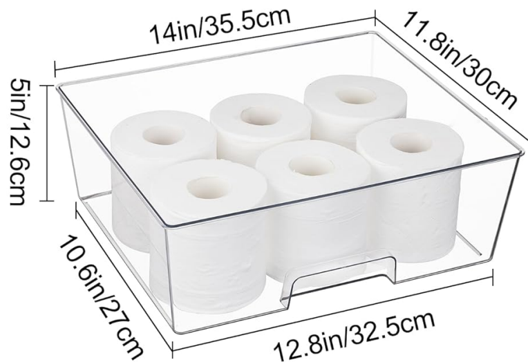
Image: A diagram illustrating the dimensions of the outer frame (15in/38cm W x 12in/30.5cm D x 5.7in/14.5cm H) and inner drawer (14in/35.5cm W x 11.8in/30cm D x 5in/12.6cm H).