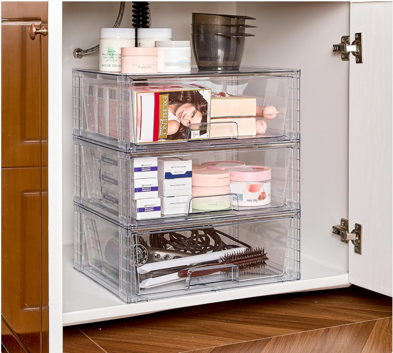
Image: Vtopmart drawers neatly organizing cleaning supplies and other items under a sink, highlighting their effectiveness as undersink organizers.