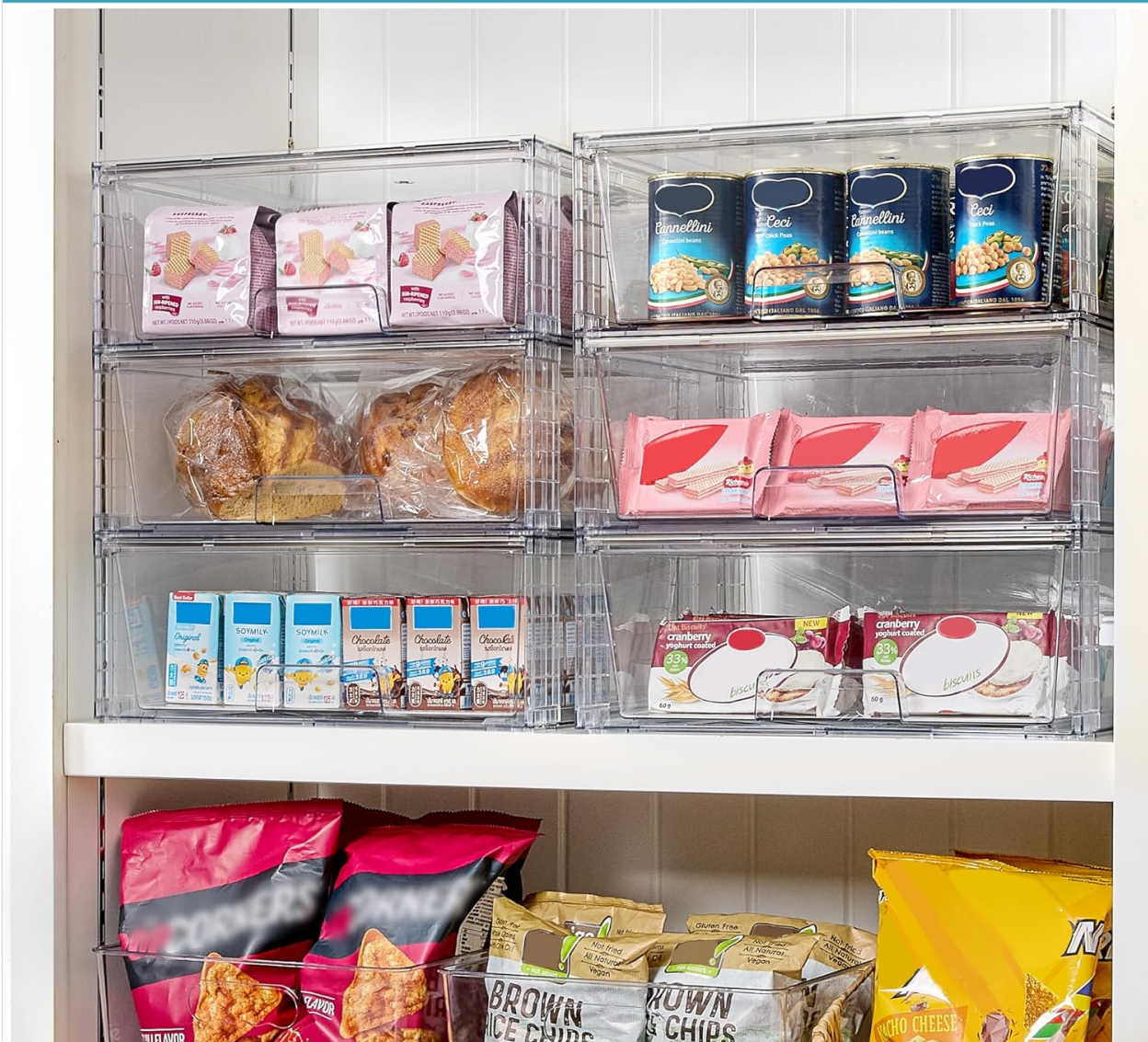
Image: Vtopmart drawers used to organize packaged food items and cans in a pantry, illustrating their application for pantry organization.