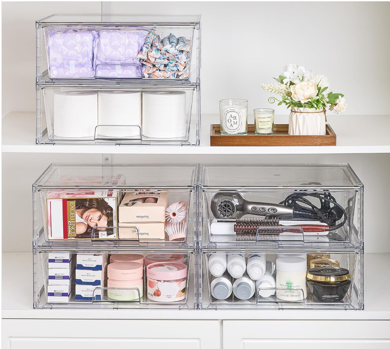
Image: Vtopmart drawers used to organize various bathroom essentials such as hygiene products, hair tools, and cosmetics on a bathroom shelf, showcasing their use as bathroom cabinet organizers.