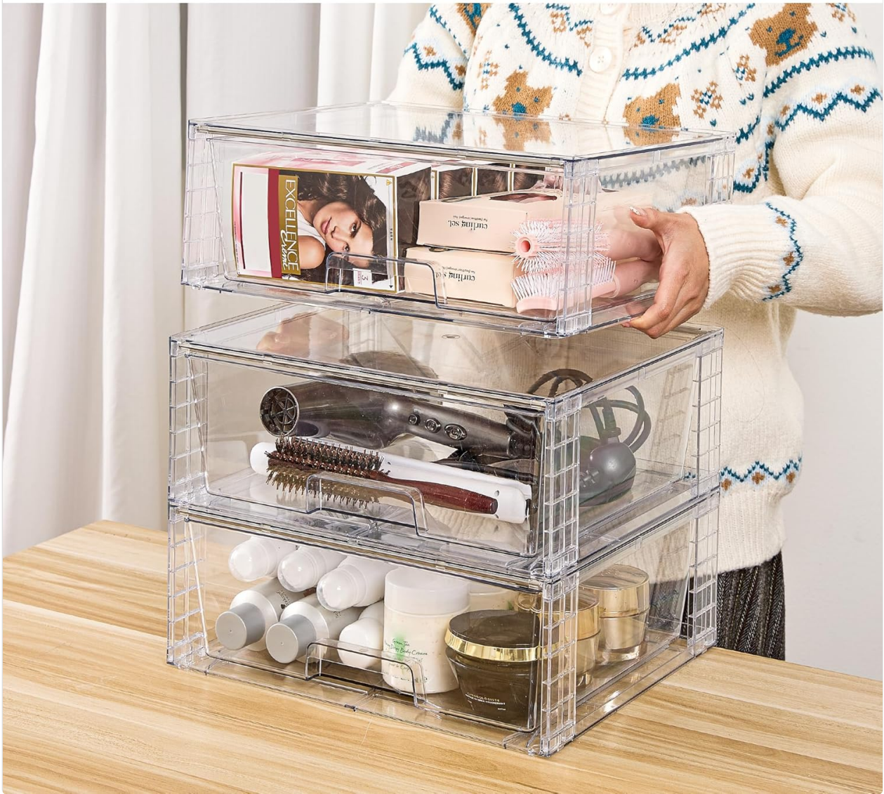
Image: Three Vtopmart clear storage drawers stacked, showcasing the secure stackable design and how they can be used to organize various items like cosmetics, hair tools, and bottles.