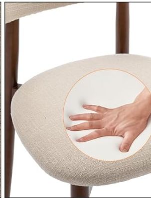
High Density Comfort Sponge