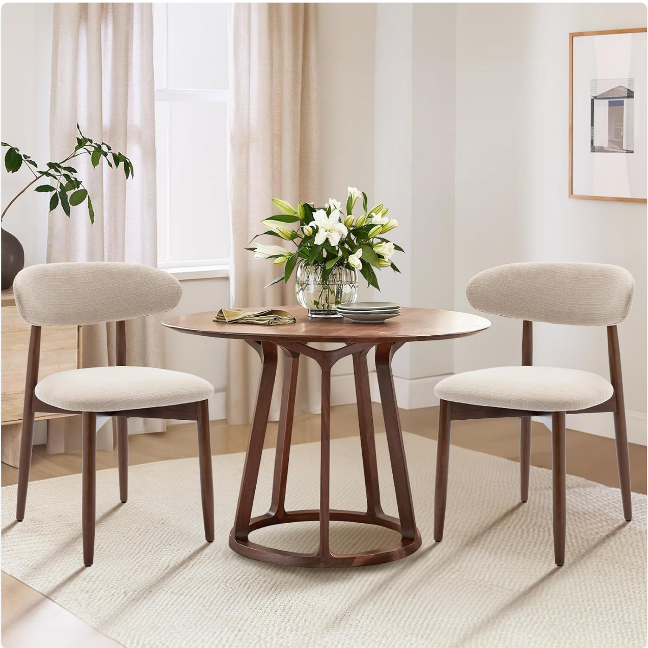
Side view of the dining chair, highlighting the curved backrest and leg structure.