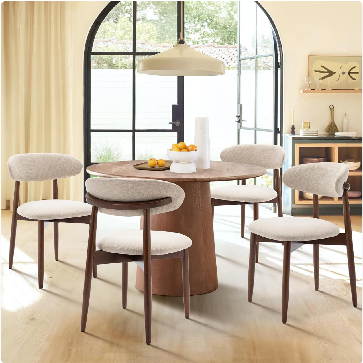
Chairs arranged around a round dining table, demonstrating their adaptability to different table shapes.