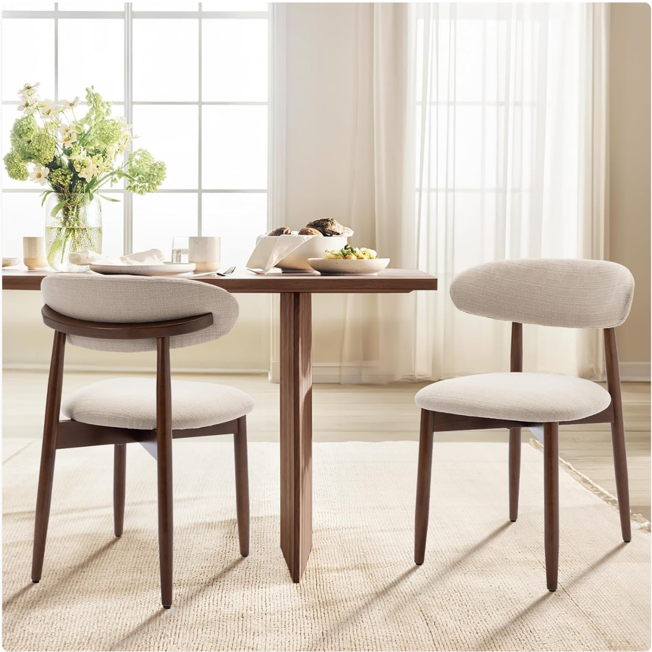
Chairs positioned around a rectangular dining table, showcasing their suitability for various dining setups.