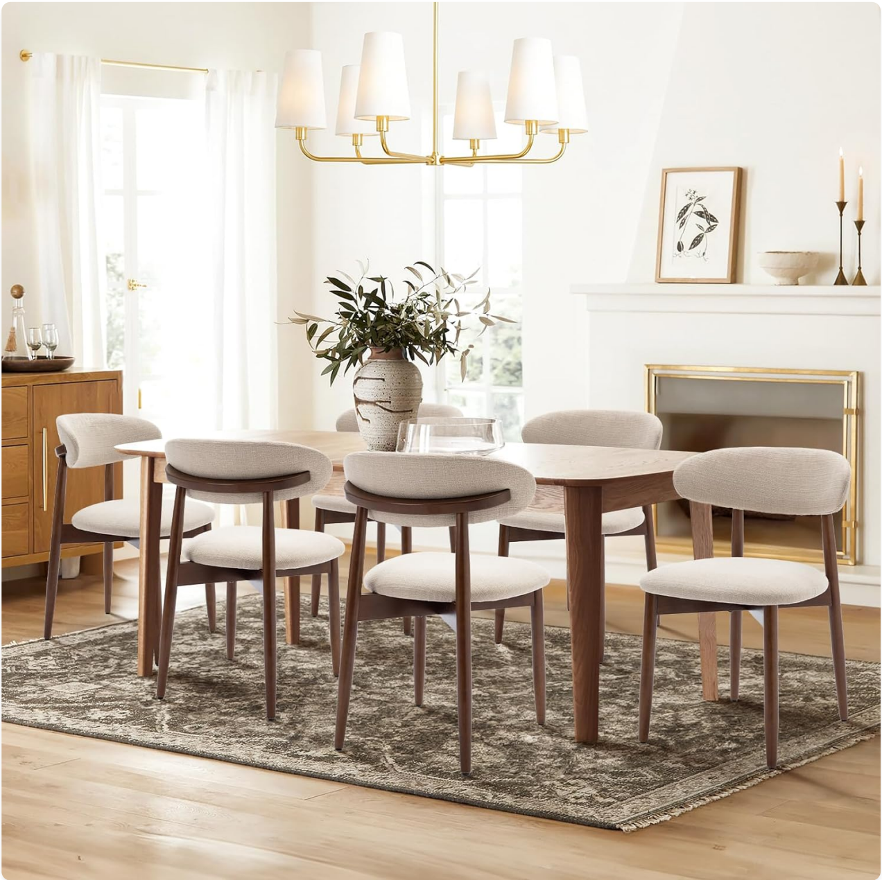
The COLAMY Wooden Dining Chairs Set of 6, showcasing their modern design and comfortable appearance in a dining room setting.