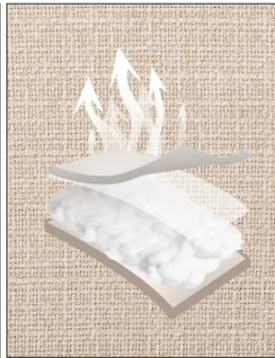
Comfortable Breathable Fabric