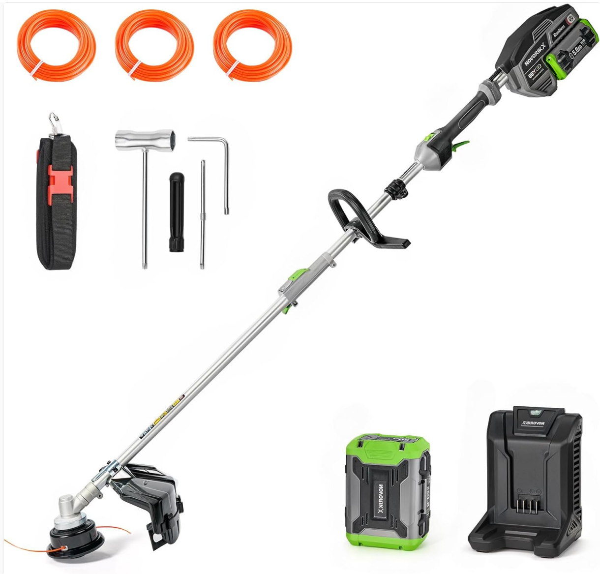
Figure 1: NovorikX 60V Lithium Ion Cordless String Trimmer