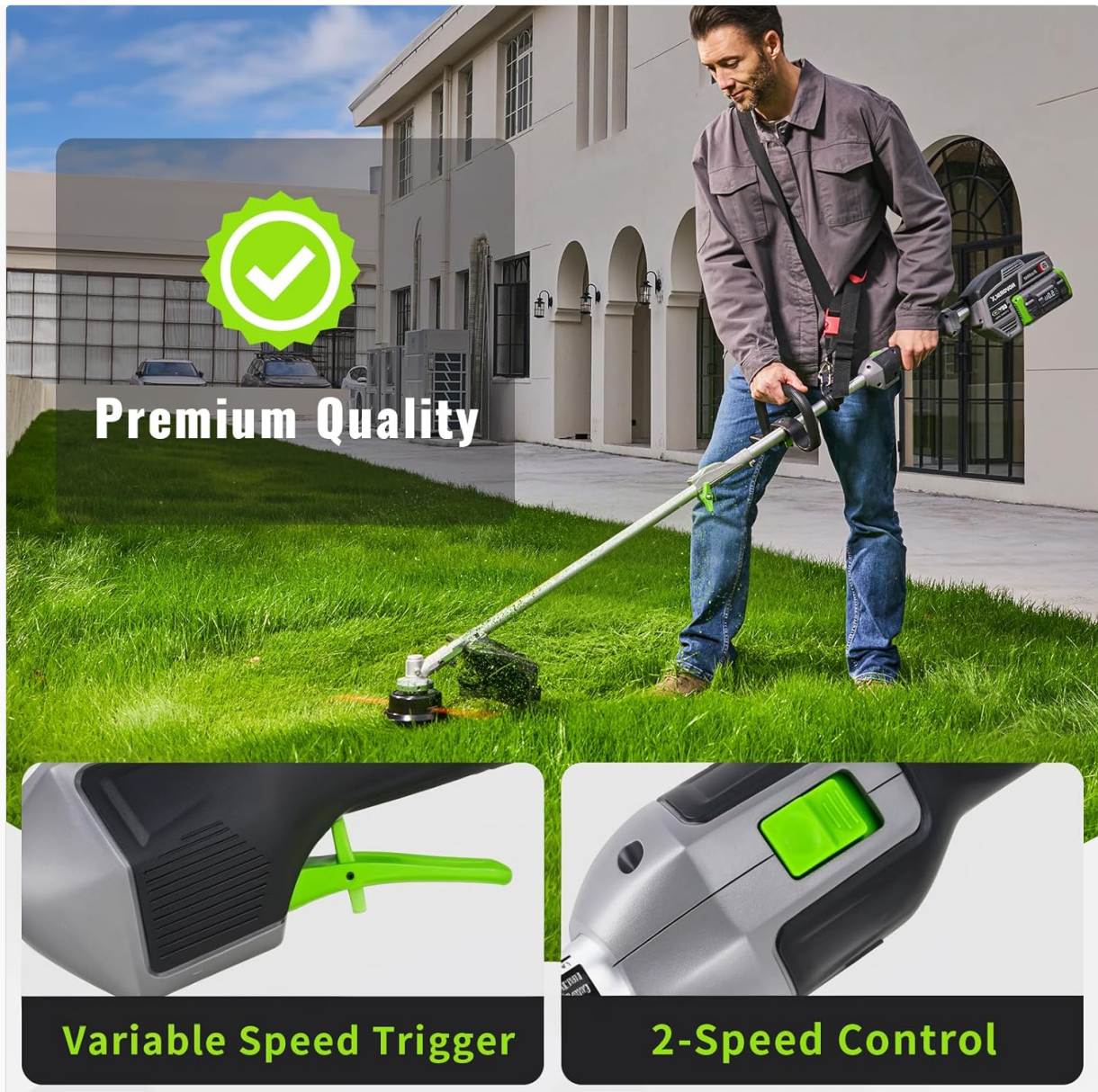
Figure 3: Adjustable Auxiliary Handle and Controls