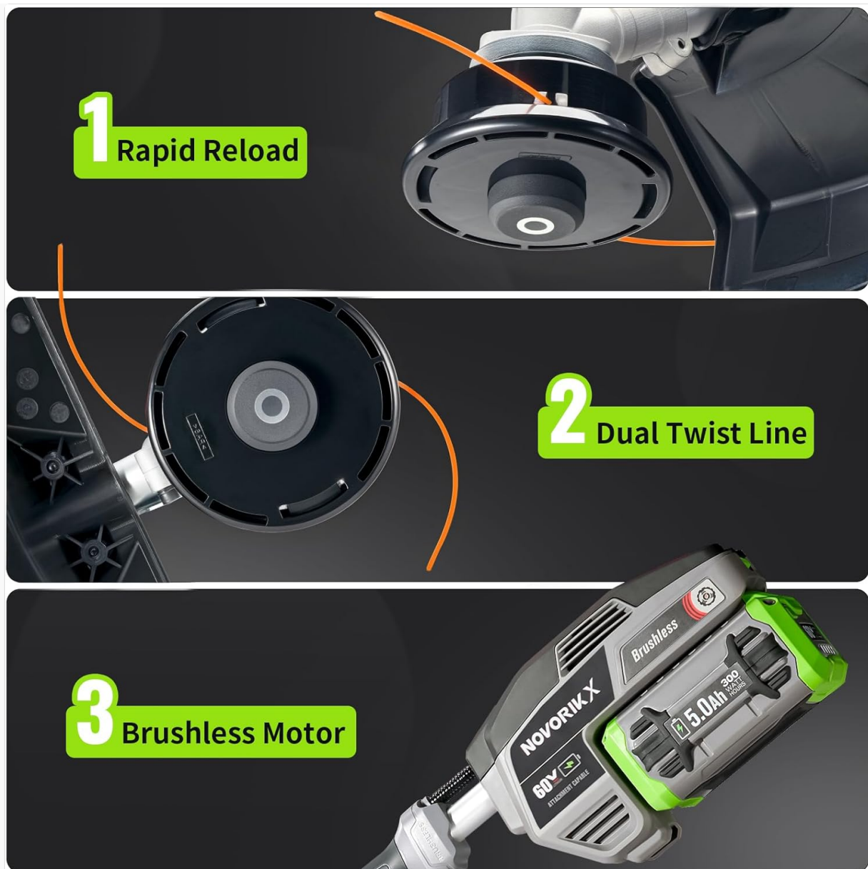
Figure 6: Line Feeding and Motor Features