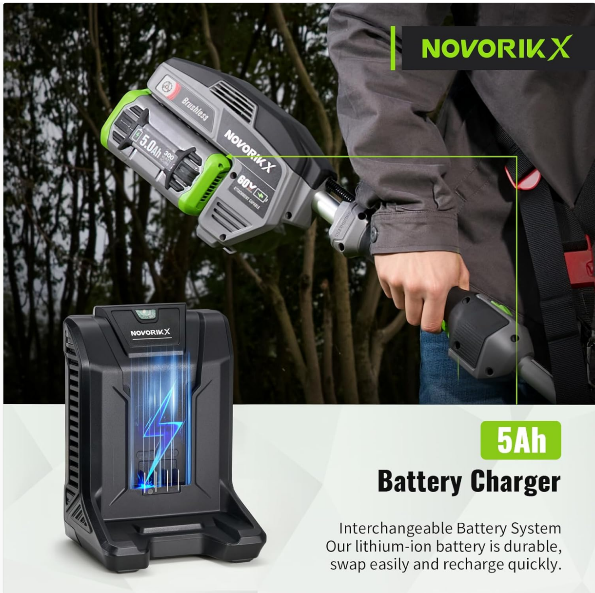
Figure 4: 5.0Ah Battery and Charger