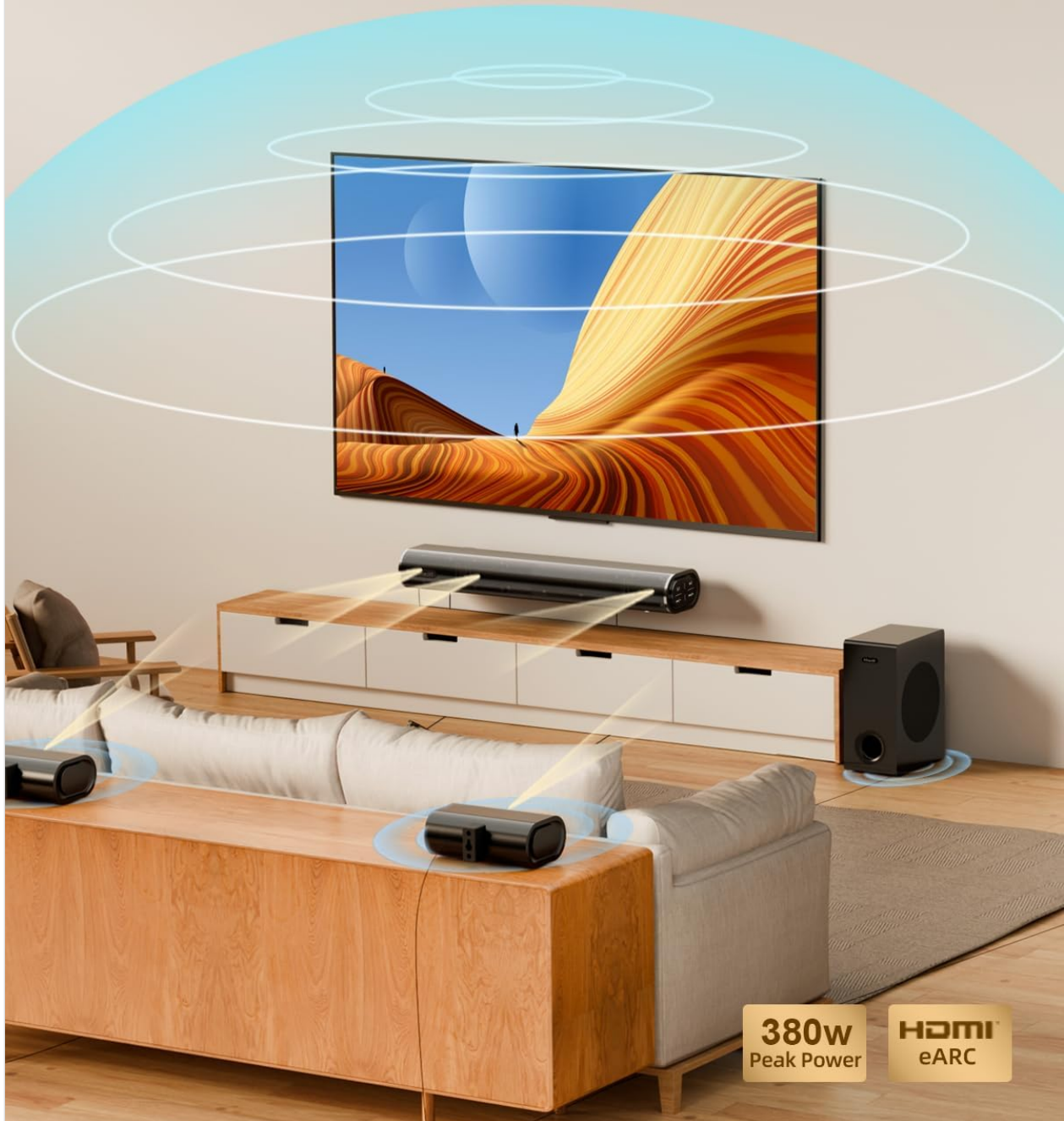
Image: An illustration demonstrating the recommended placement of the Hiwill HiElite A51 soundbar, wired subwoofer, and two wired rear speakers in a typical living room environment for optimal 5.1 channel Dolby Atmos sound.