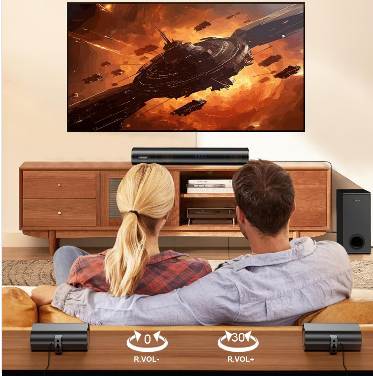
Image: Two wired rear surround speakers with independent volume controls (0 to 30 levels) for customized sound. These speakers enhance the surround sound experience.