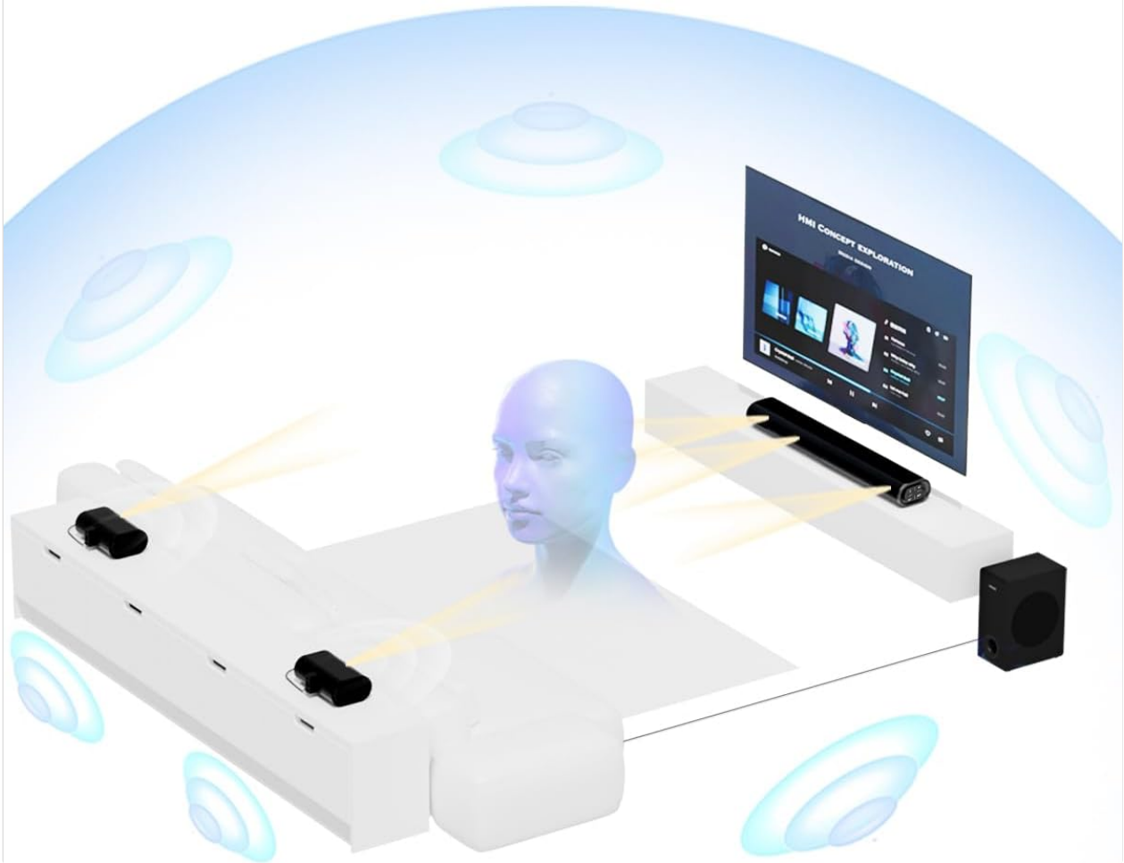
Image: A visual representation of the Dolby Atmos 5.1 channel 3D surround sound configuration, showing sound waves emanating from the soundbar, subwoofer, and rear speakers to create an immersive audio field around the listener.