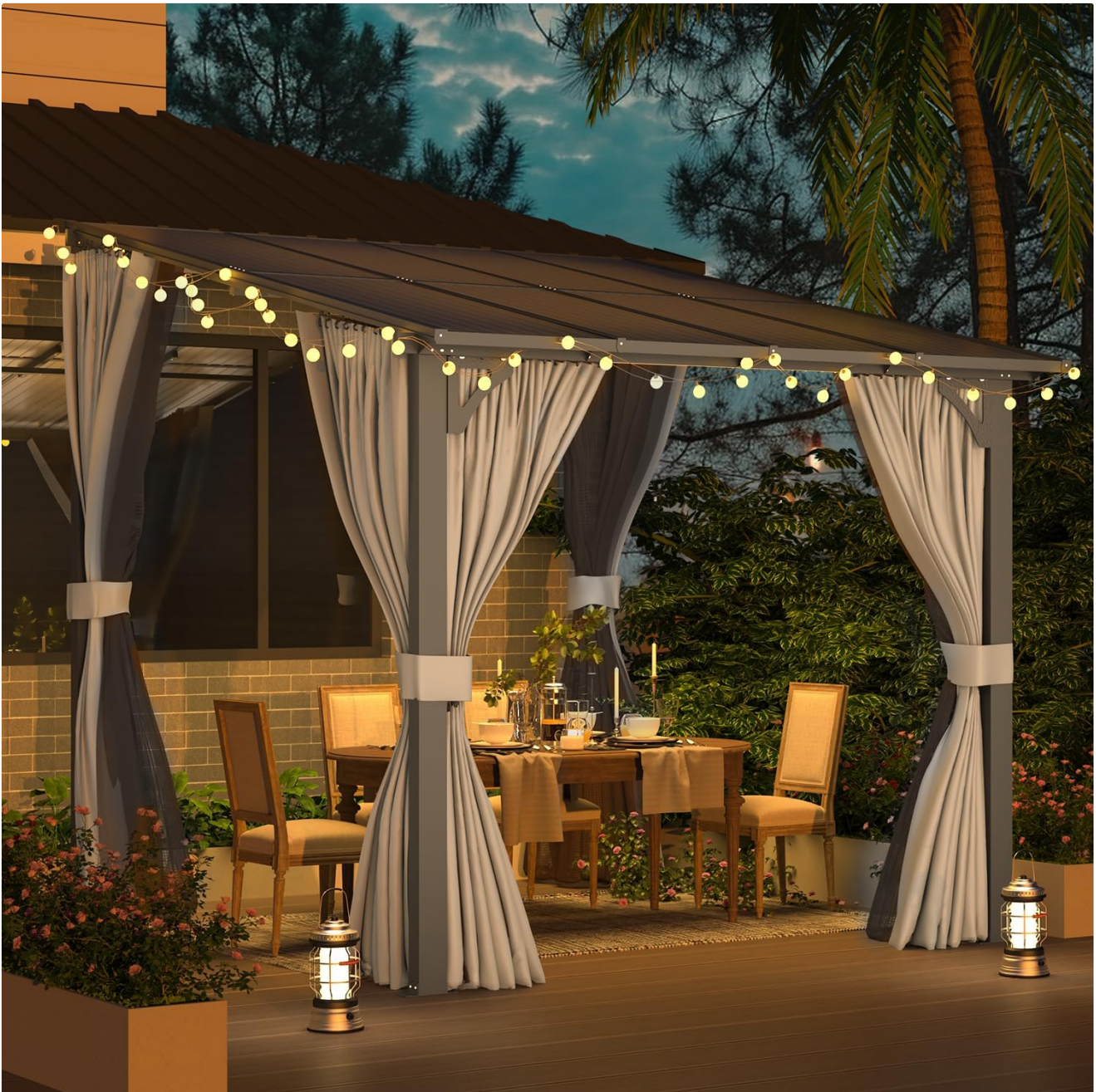
Image: Fully assembled AECOJOY 8x8 Gazebo on a patio, illuminated by string lights.