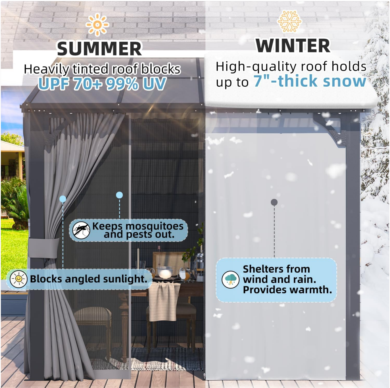
Image: Visual representation of the gazebo's performance in summer (UV protection, mosquito barrier) and winter (snow load capacity, shelter from wind and rain).

Shelters from wind and rain. Provides warmth.