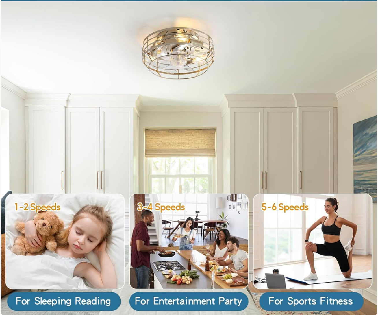
Image: Depiction of the 6-speed fan adjustment, suggesting optimal speeds for different activities like sleeping, entertaining, and exercising.

Choose the Wind Speed According to Your Need