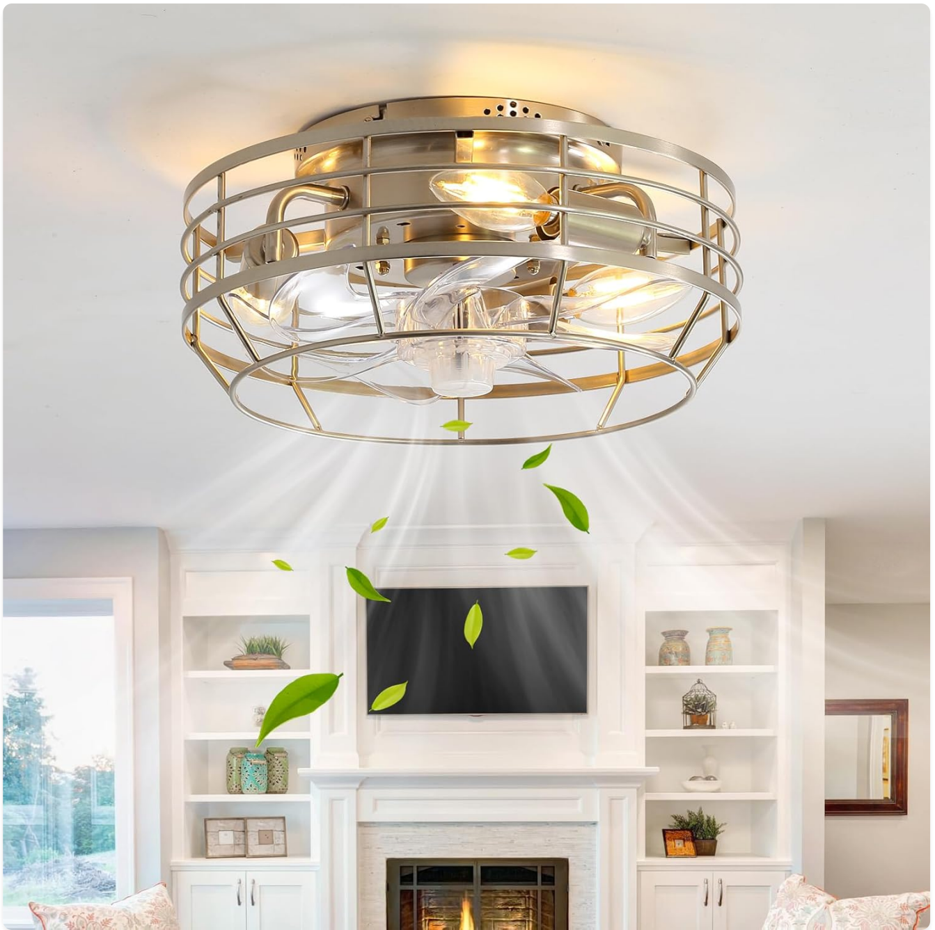
Image: The Youroke Caged Ceiling Fan with Light and Remote, featuring a brushed nickel finish, installed on a ceiling in a living room setting, demonstrating its aesthetic appeal and air circulation.