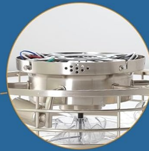
Sturdy Top-Sucking Disk