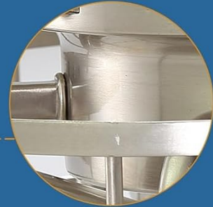
Powerful Reversible Motor