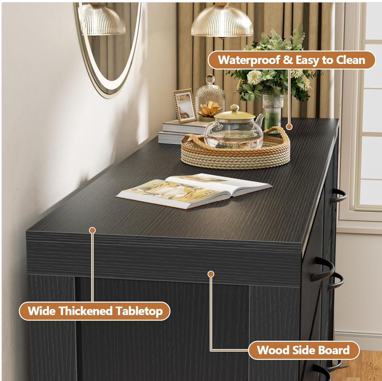
Image: A close-up view of the dresser's top surface and side panel, indicating the wide thickened tabletop and wood side board, and noting its waterproof and easy-to-clean properties.