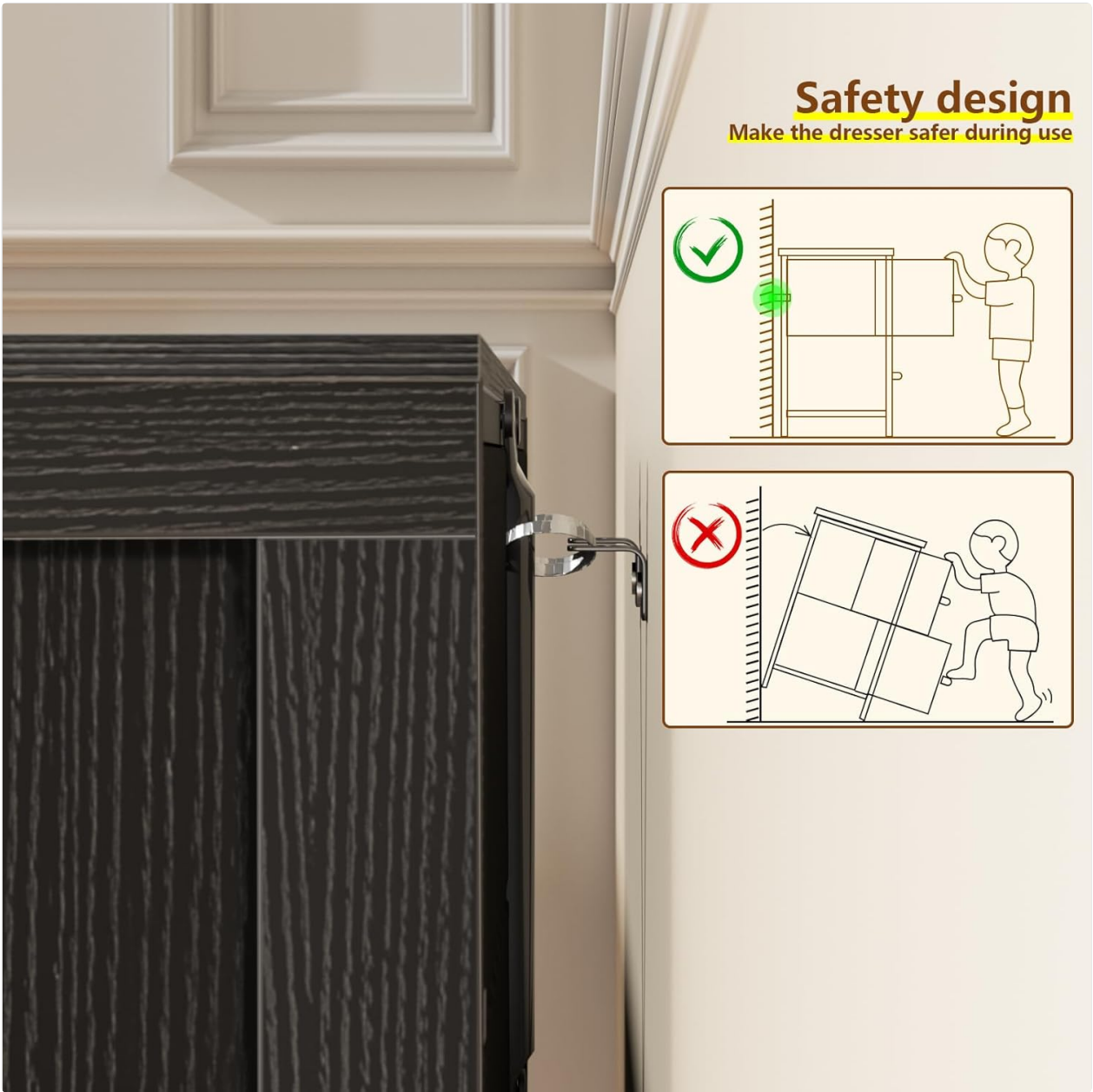
Image: A diagram showing the correct and incorrect way to secure the dresser to a wall using an anti-tipping kit, emphasizing safety.