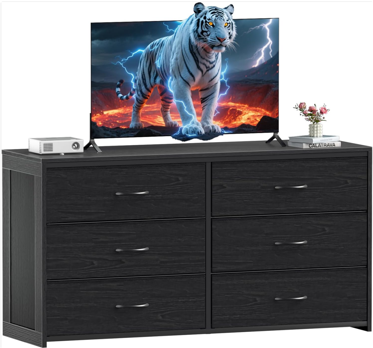
Image: The OURPIC 6-Drawer Dresser and TV Stand, showcasing its black finish and six drawers, with a television and projector placed on top.