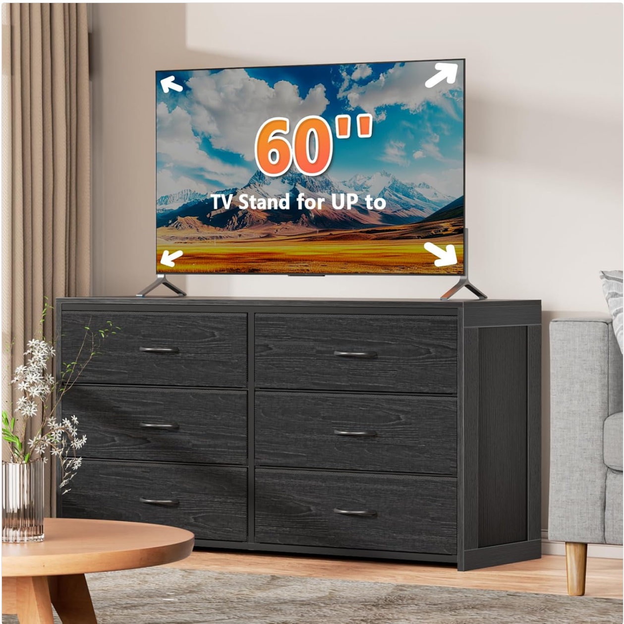
Image: The dresser functioning as a TV stand in a living room, with a large television placed on its top surface.