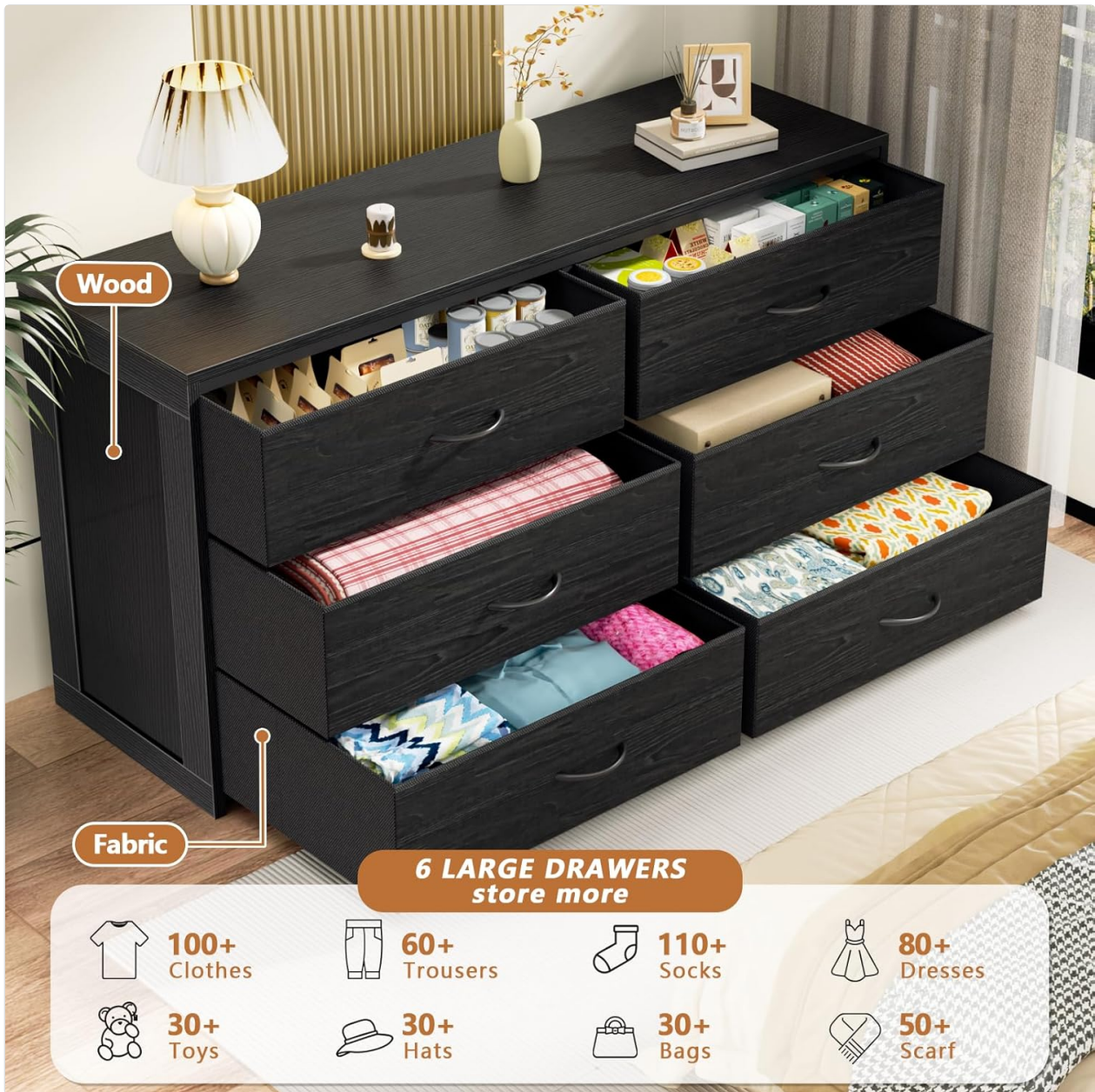
Image: The dresser with its six fabric drawers pulled out, demonstrating the large storage capacity for clothes, socks, and other items.