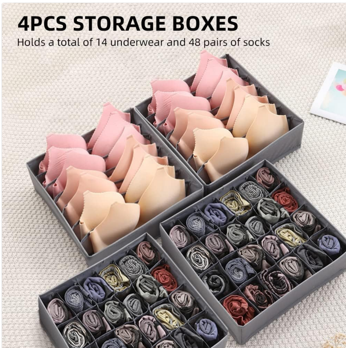
Image 3.2: Example of organized items within the four storage boxes.

Holds a total of 14 underwear and 48 pairs of socks