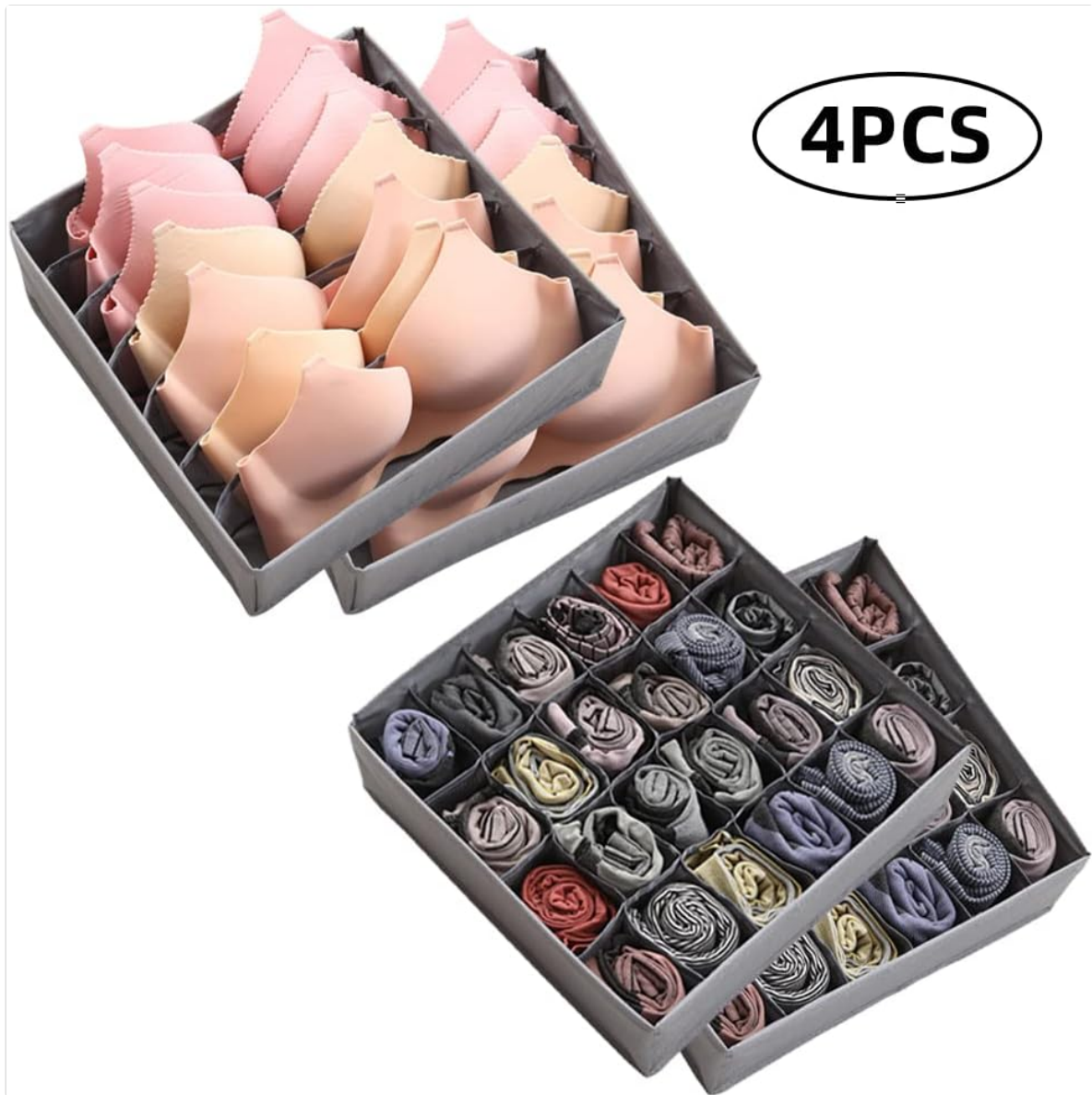
Image 1.1: The complete set of four TARSHYRY storage boxes, ready for use.