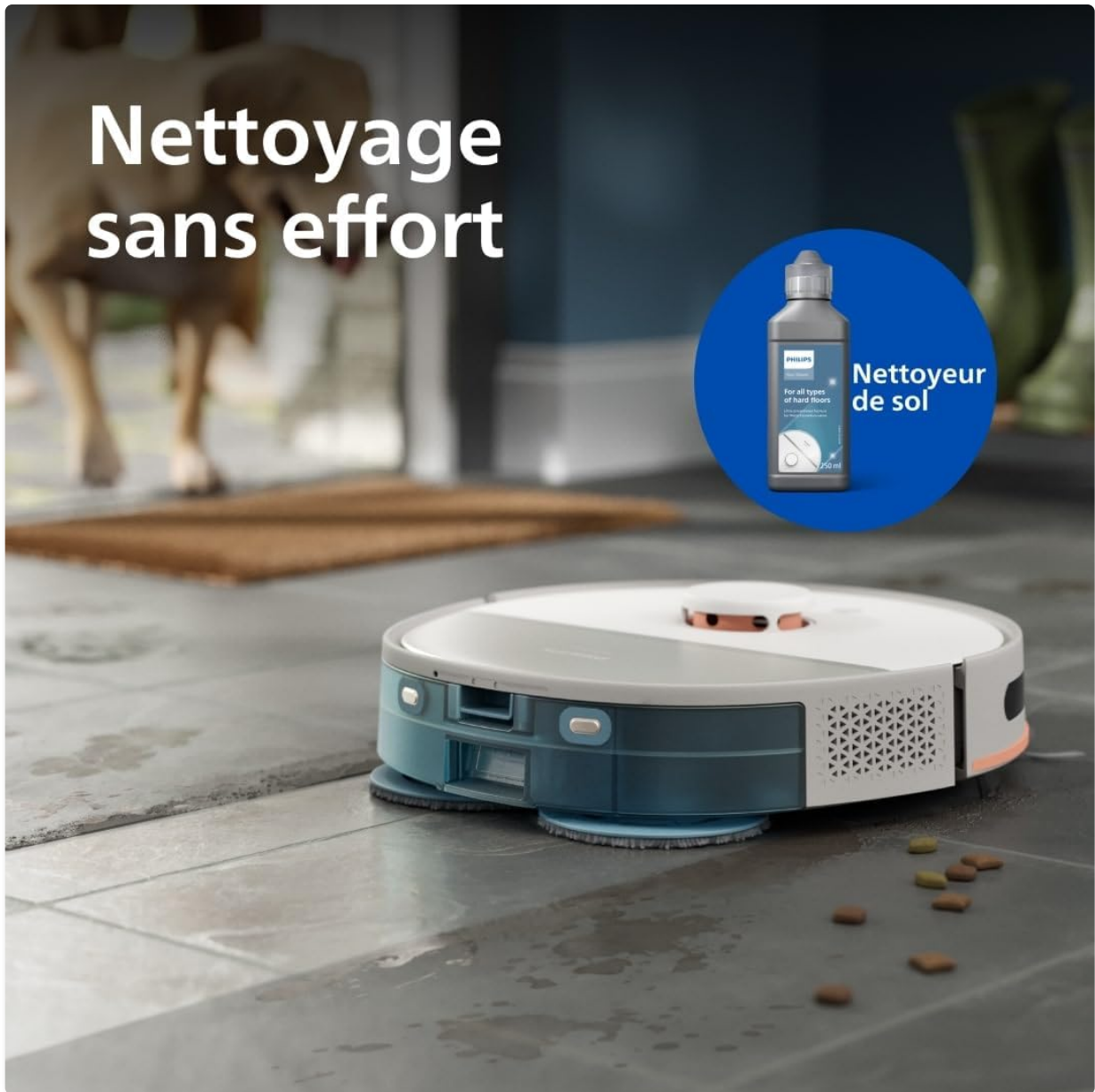
Image: The robot vacuum actively mopping a tiled floor, with a bottle of Philips cleaning solution visible, indicating its use for enhanced cleaning.