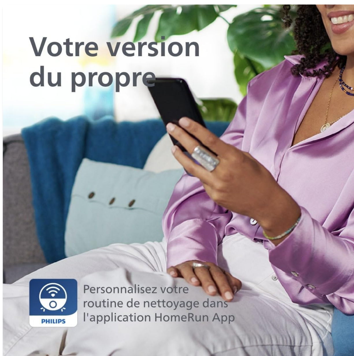
Image: A user interacting with the Philips HomeRun app on a smartphone to manage cleaning routines for the robot vacuum.