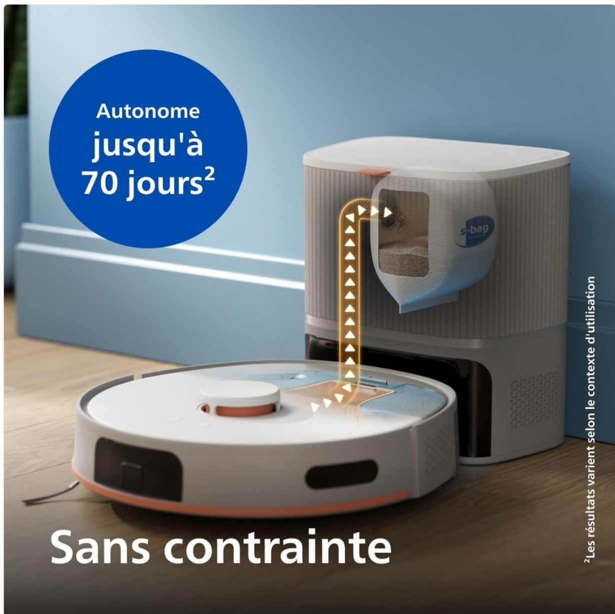
Image: The robot vacuum docked at its auto-empty station, illustrating the automatic dust disposal process into the S-bag.