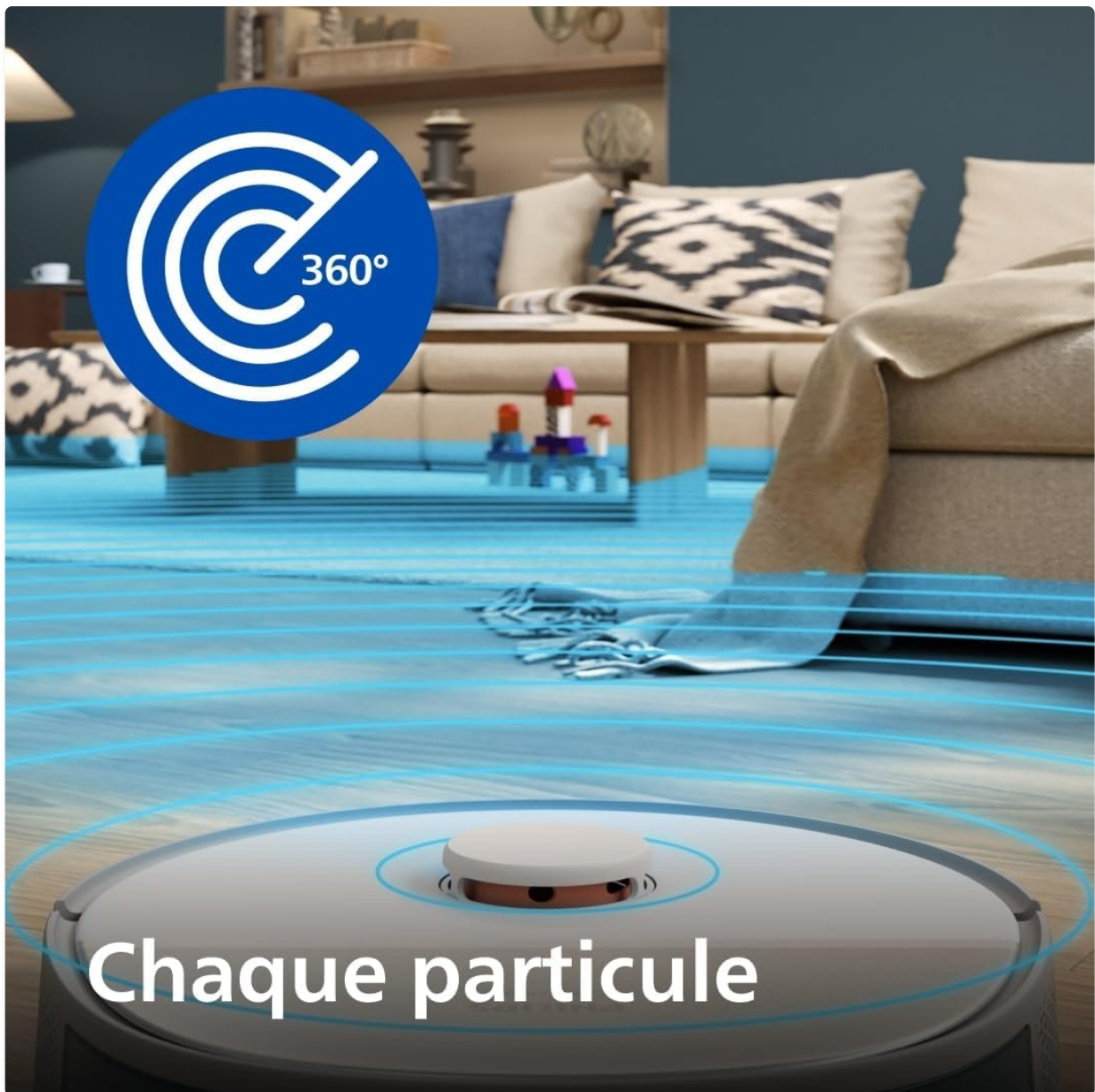
Image: The robot vacuum utilizing its 360-degree laser navigation system to accurately map its surroundings and plan its cleaning path.