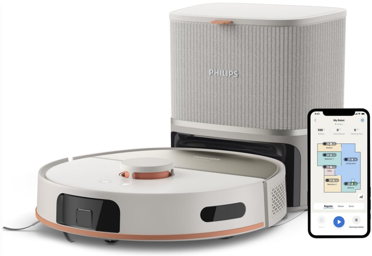
Image: The Philips HomeRun 5000 Series Robot Vacuum Cleaner and Mop, shown with its auto-empty station and a smartphone displaying the HomeRun app interface for controlling the device.