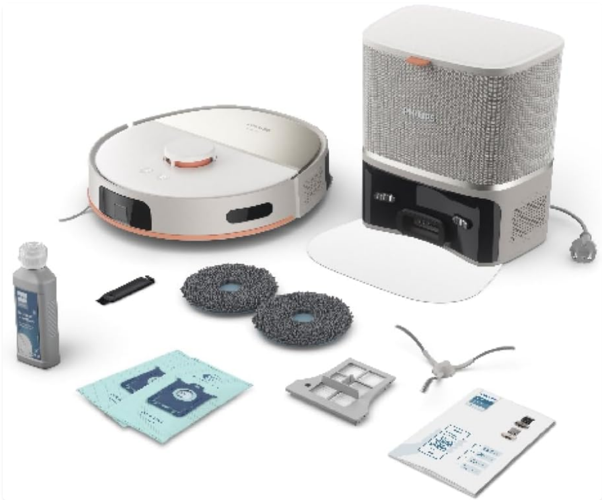
Image: All components included in the Philips HomeRun 5000 Series Robot Vacuum Cleaner package, laid out for inspection.